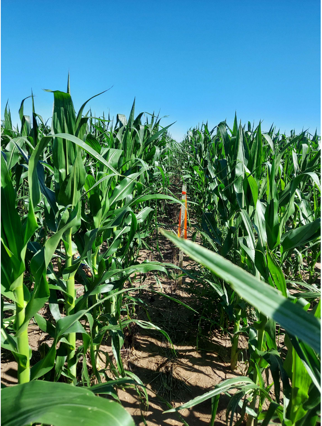
LOOKING FROM THE SOUTH TO THE NORTH