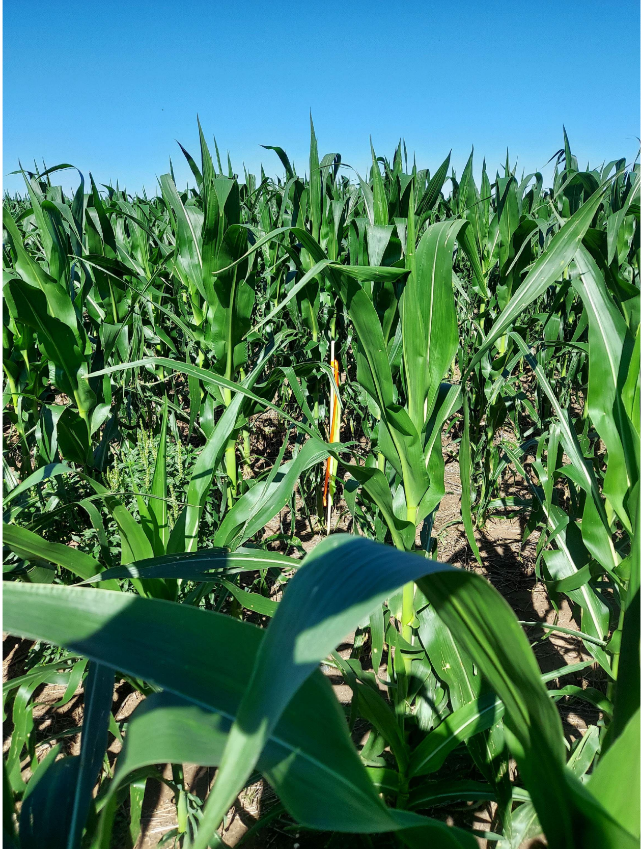
LOOKING FROM THE EAST TO THE WEST