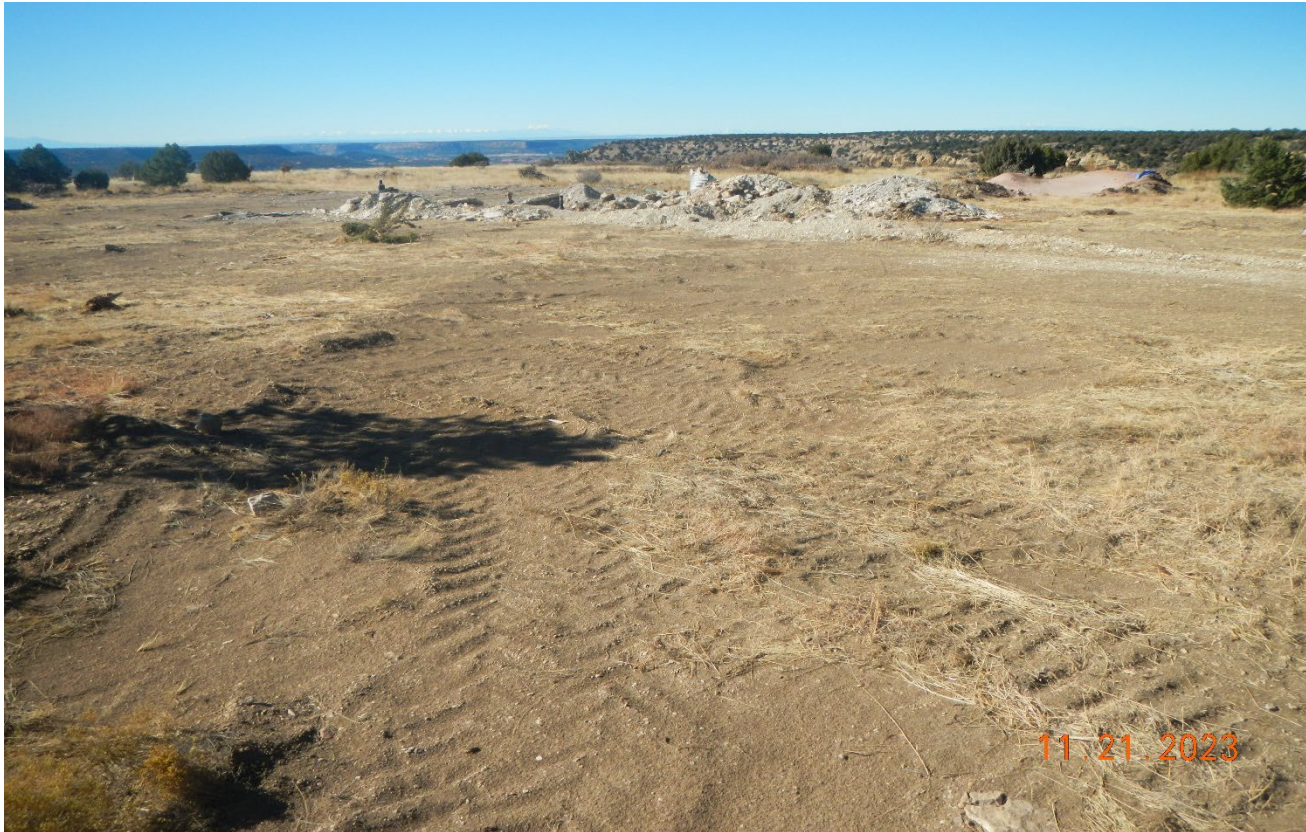
Photo 6. Facing west toward the location.