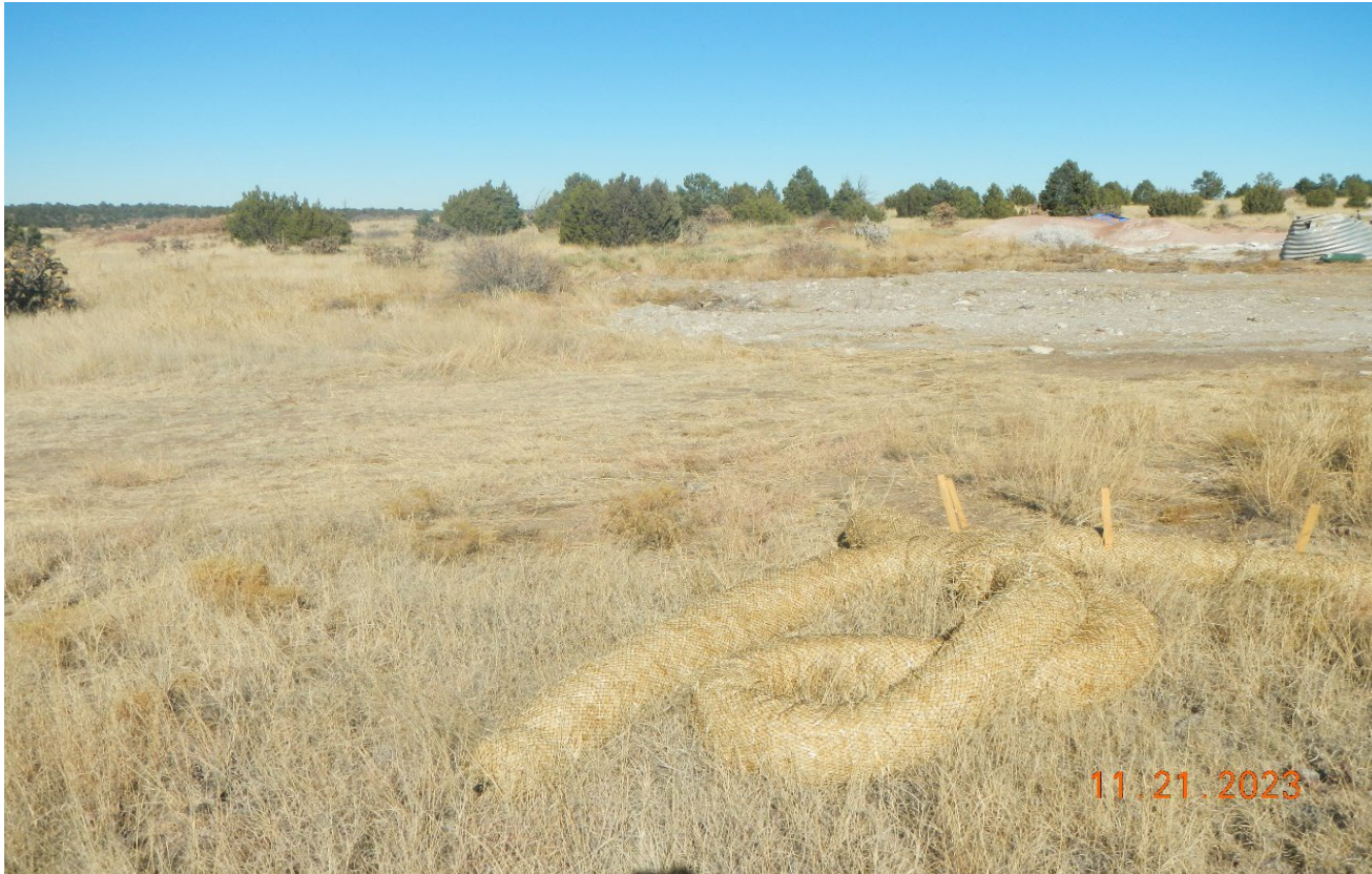
Photo 19. Facing northeast at west side of the location. The straw wattles area not installed at the northwest side of the location which the topography slopes toward.