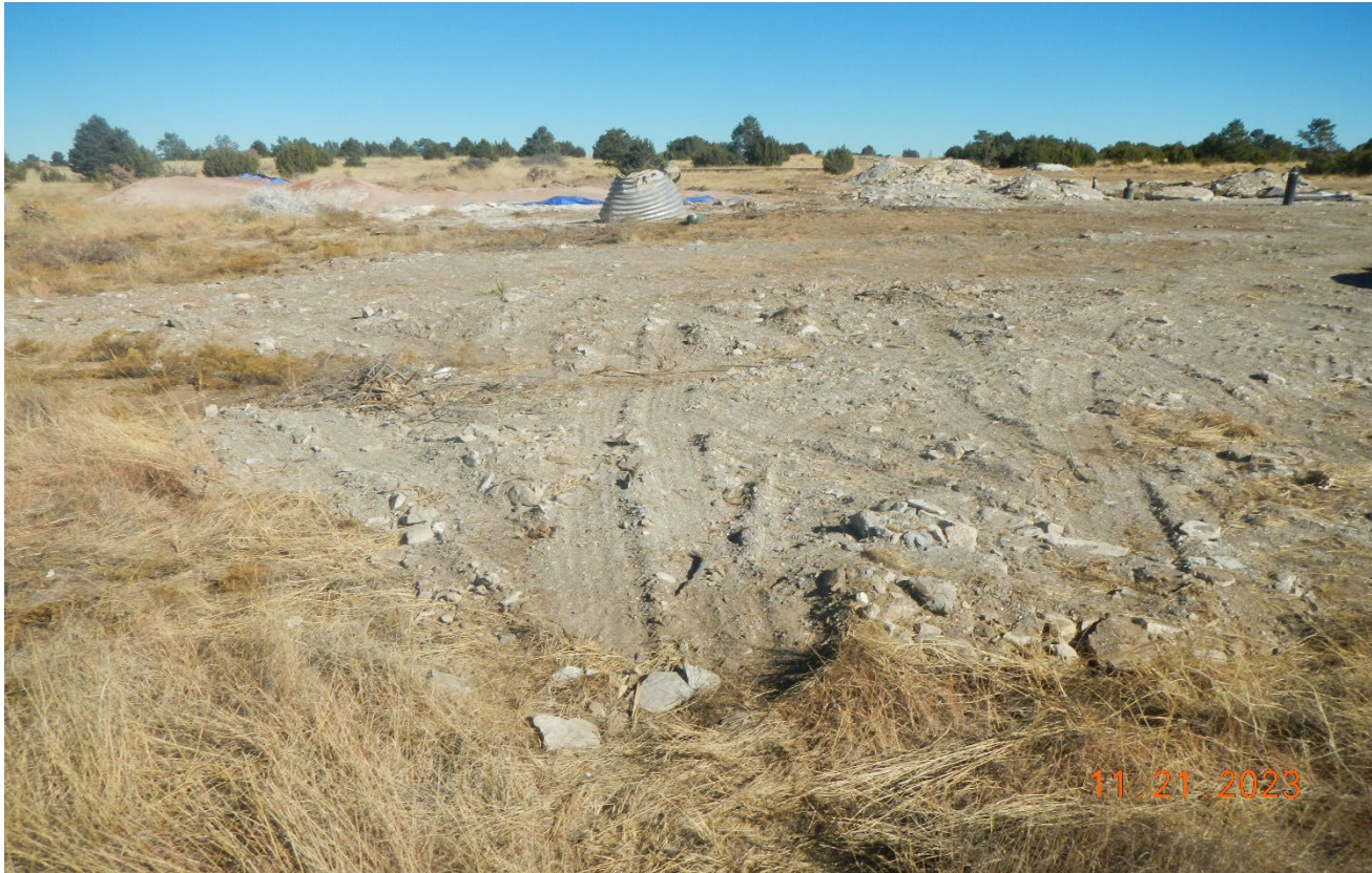
Photo 18. West side of the location facing east. There are rocky subsoils that have been pushed out to this area. No stormwater BMP's are installed in this area.