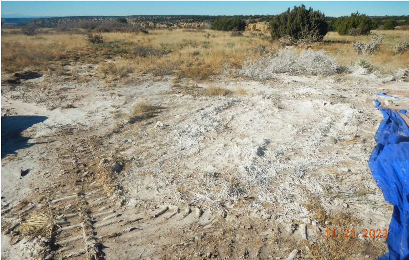
Photo 17. Facing toward the northwest. The white unknown substance is spread over this area. There are no stormwater controls around this perimeter to prevent stormwater transport offsite. The topography also slopes down to the northwest.