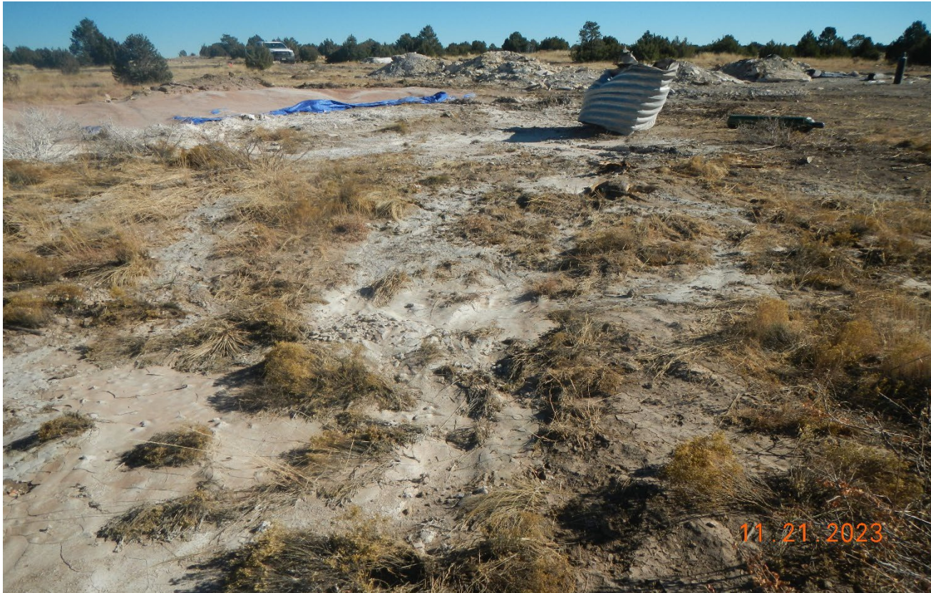
Photo 15. Facing southeast at the location. There is white substance in this area which appears to have washed out further out to the northwest due to evidence of a flow pattern.