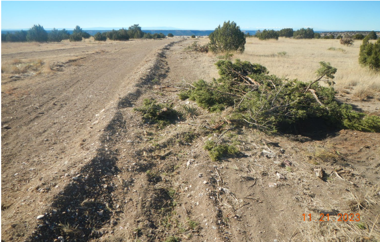
Photo 2. Facing west along the flowline disturbance. There is tree debris along the disturbance which will need to be removed. Additionally it does not appear that topsoil was properly segregated and replaced as there was rocky subsoils observed.