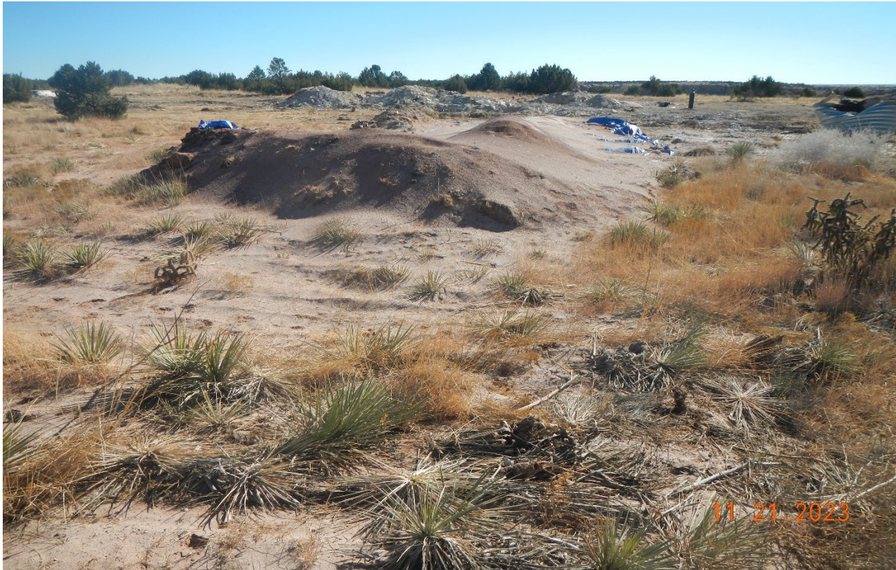
Photo 14. North side of the location facing south. The cuttings pile has blown off the blue tarp which was not properly stored and contained. .