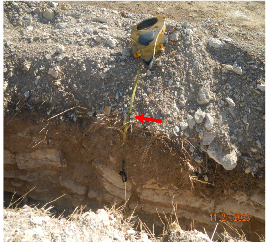
Photo 11. Another view of the topsoil horizon shows 6-7" of dark topsoil before rocky subsoils are encountered. Operator failed to salvage topsoil at the location..