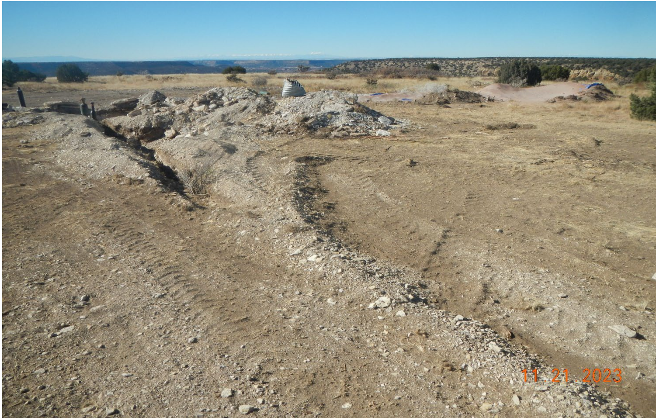
Photo 7. Facing west. There is an open excavation at the wellhead. Excavated soils have been mixed with rocky subsoils.