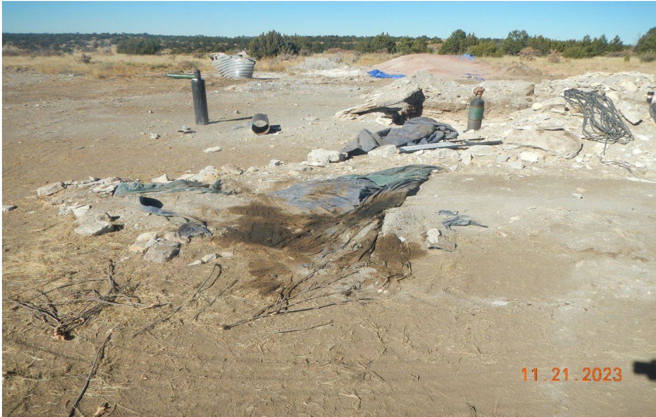
Photo 8. Facing northwest near the wellhead. There is areas of oil stained soils and plastic liner debris left on location.