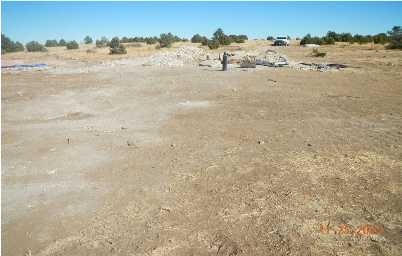
Photo 21. West side of the location facing east..