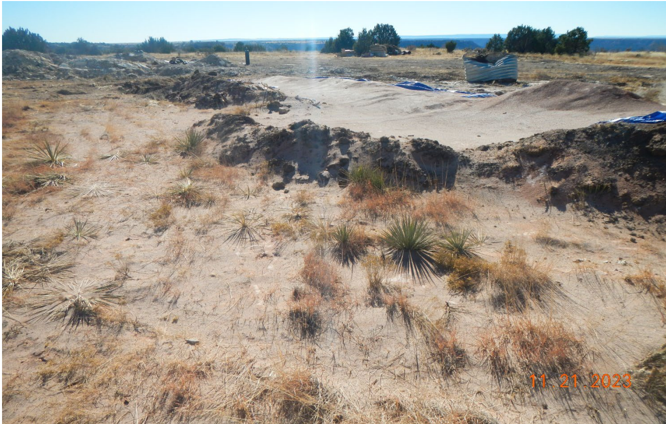
Photo 13. North side of the location facing southwest. The cuttings pile has blown off the blue tarp which was not properly stored and contained.