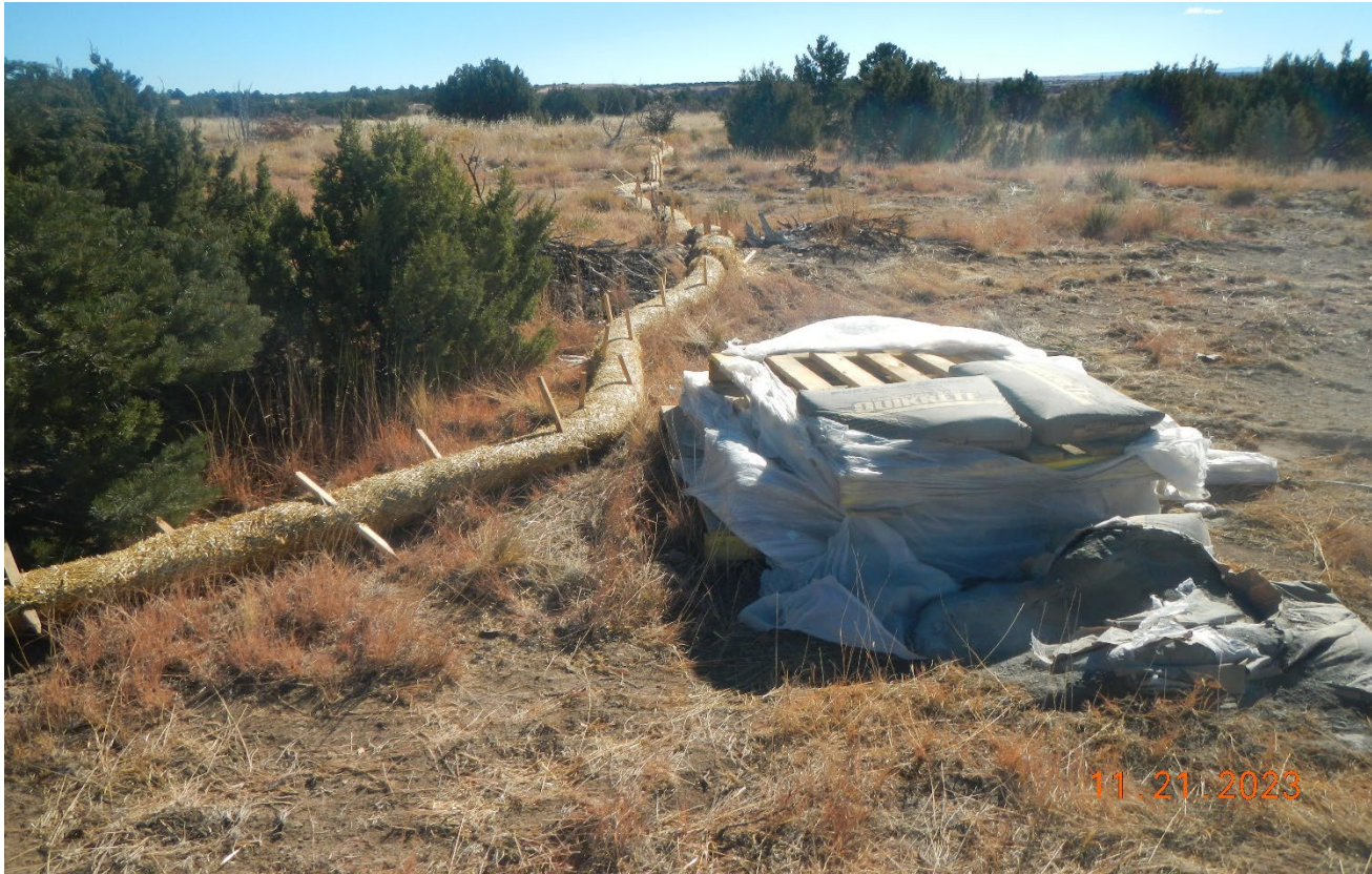
Photo 4. Facing south at the east side of the location. The wattles are displaced and the concrete bags have spilled out onto the soil.