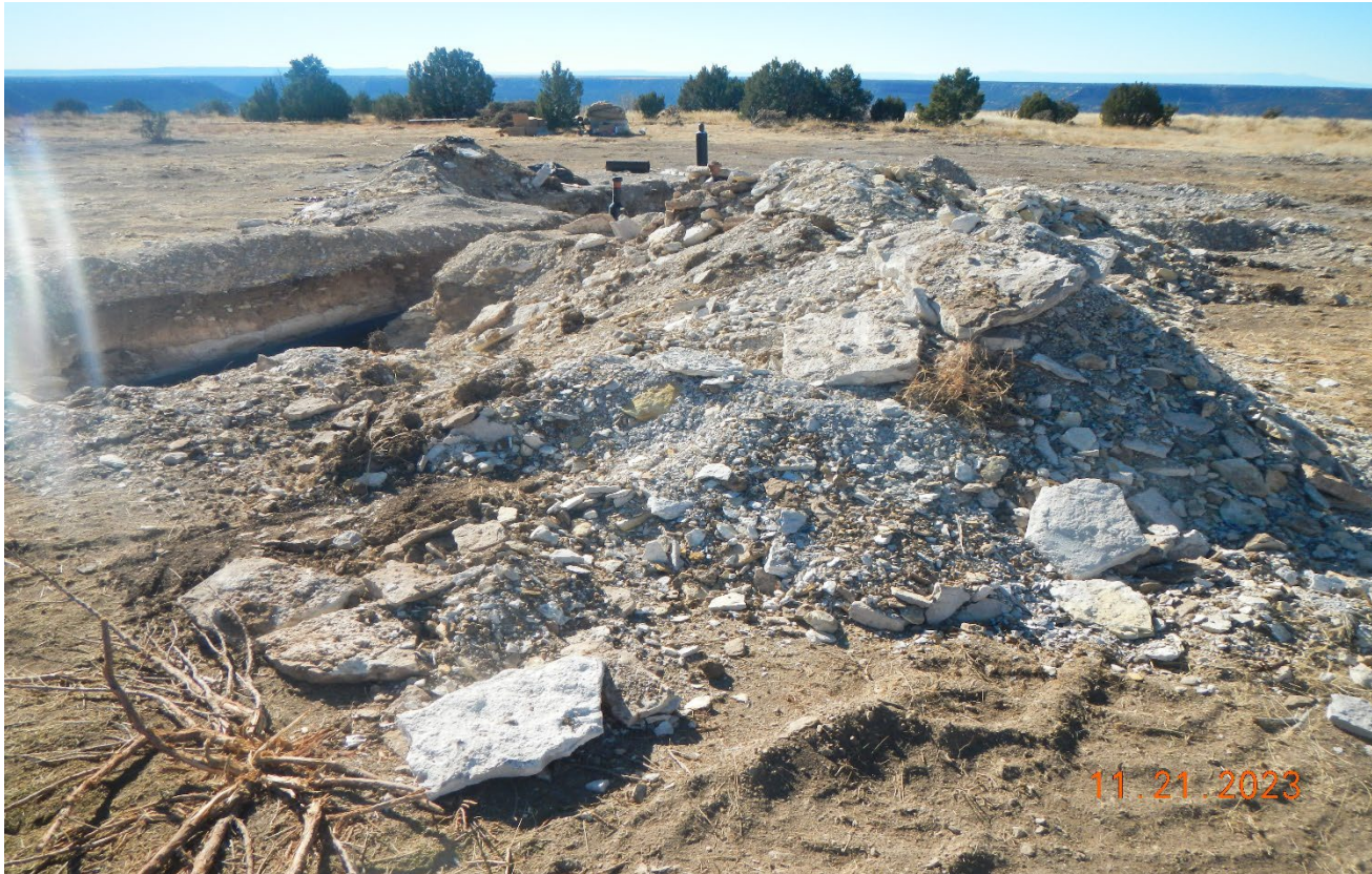
Photo 12. Facing southwest at the location. The rocky subsoils have been mixed with the topsoil which was not salvaged per the rules.