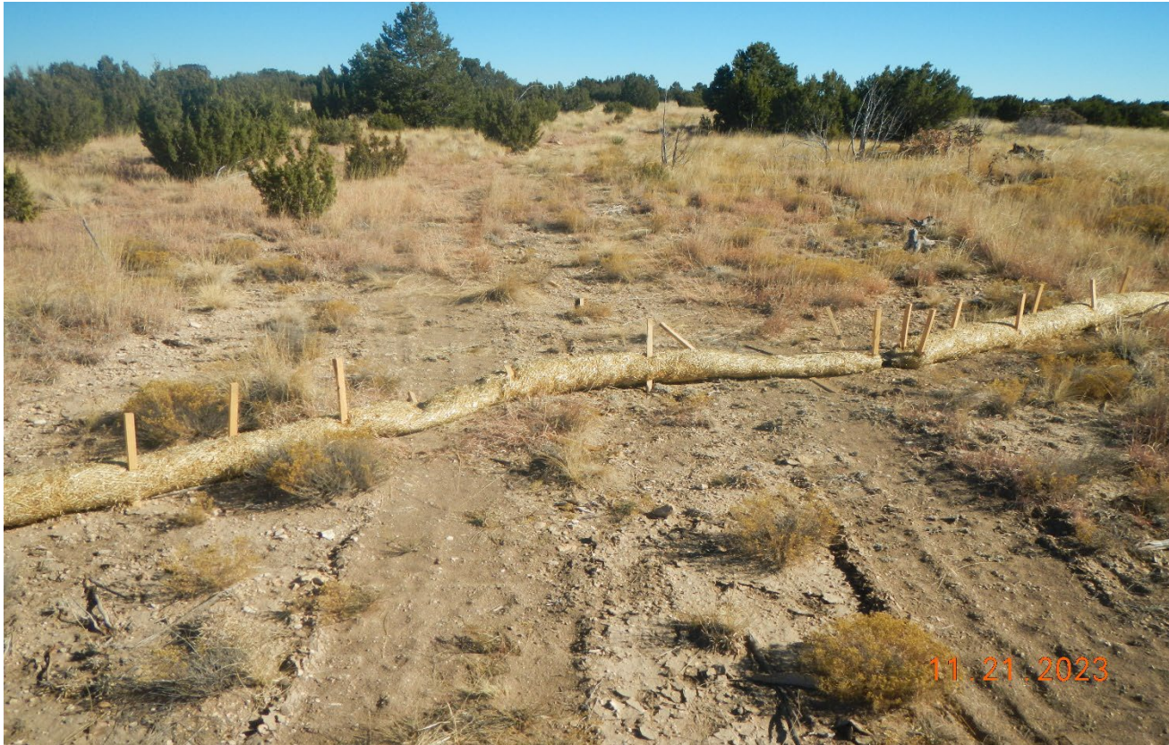
Photo 5. Facing southeast. Vehicle have driven over and displaced the wattles. There was vehicle tracks observed outside of the designated access road boundary.