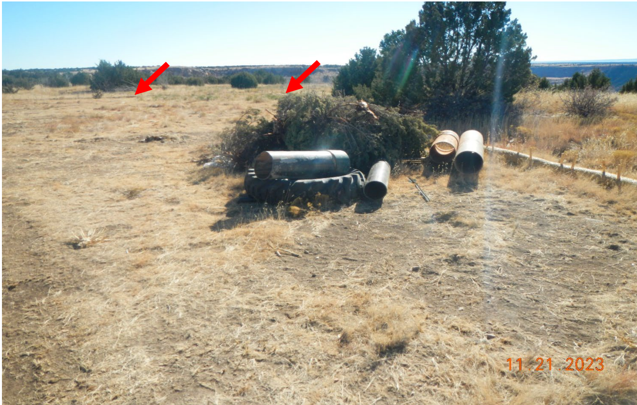
Photo 20. Facing south at the west side of the location. There is tree debris and plastic trash in this area that needs to be removed. The straw wattles shown at red arrow need to be installed closer to the disturbance area to prevent disturbed soils from migrating further out into the vegetation.