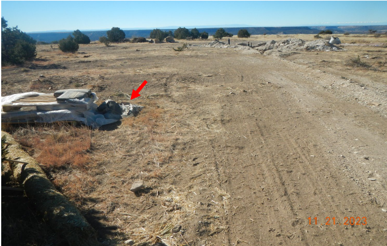
Photo 3. Facing west at the location. There is bags of concrete stored at the location and one of the bags was driven over and torn open. The concrete needs to be properly stored and contained.