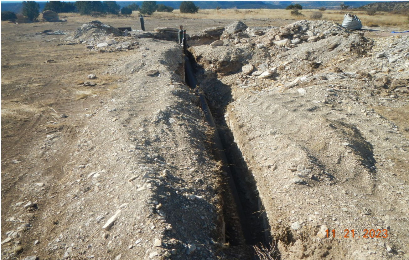
Photo 22. Facing west toward the open excavation area. There are concerns that wildlife or livestock could fall into the open excavation.