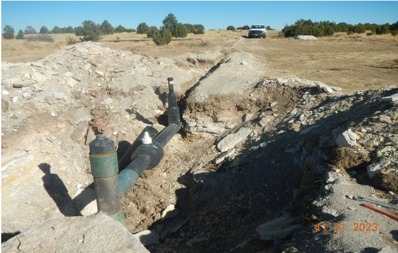
Photo 9. Facing east toward the open excavation at the wellhead. There was a hissing leak coming from the pipe connection and the operator was immediately notified.