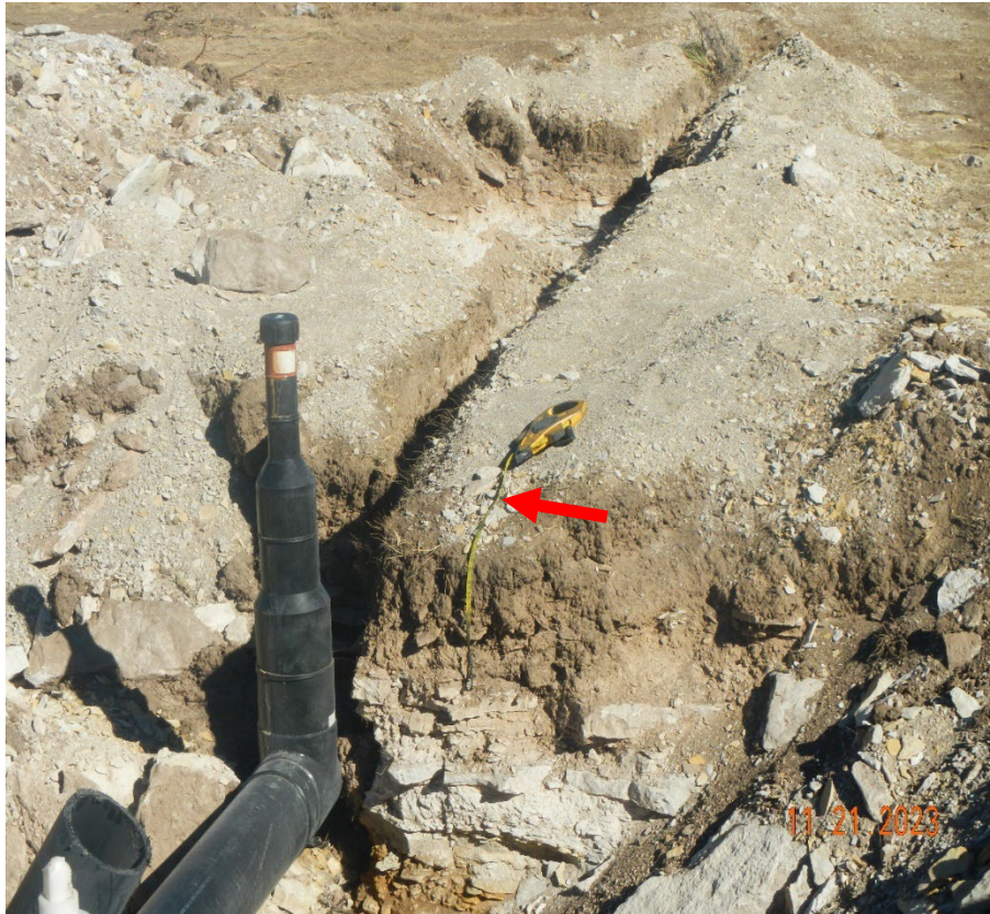
Photo 10. The tap measure shows approximately 6-7 inches of topsoil which was not salvaged at the excavated area of the wellhead or along the flowline trench.