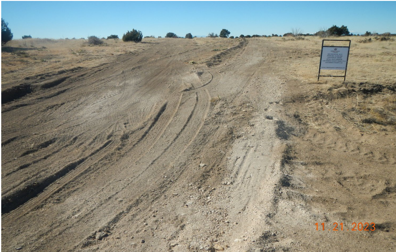
Photo 1. Facing west at the beginning of the access road standing from the County Road. There is a concern of vehicle tracking onto the County Road which will require BMP's.