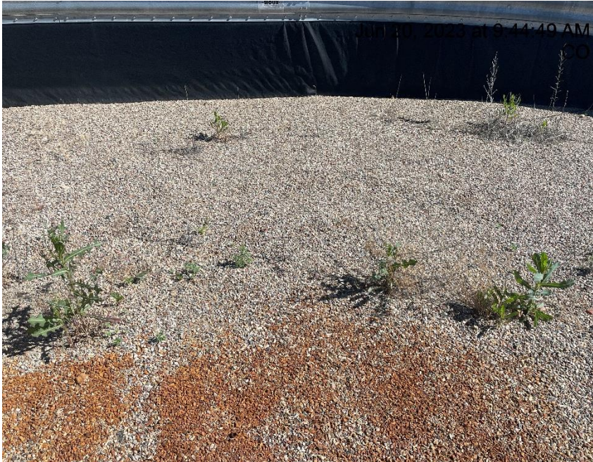
Photo # 1090 Weeds/Undesirable plant species in secondary containment