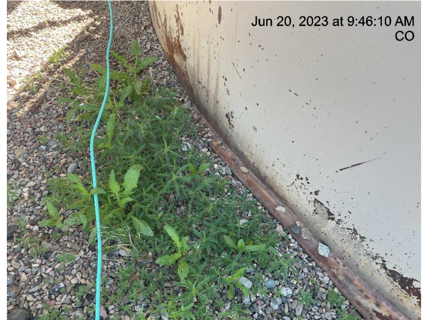
Photo # 1093 Weeds/Undesirable plant species in secondary containment