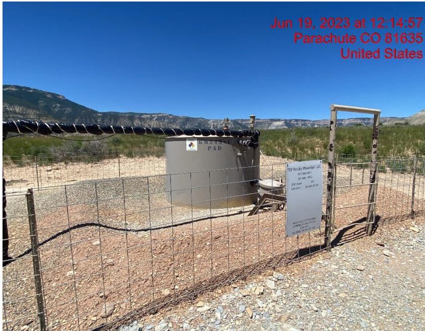
Tank Battery – Photo #04571