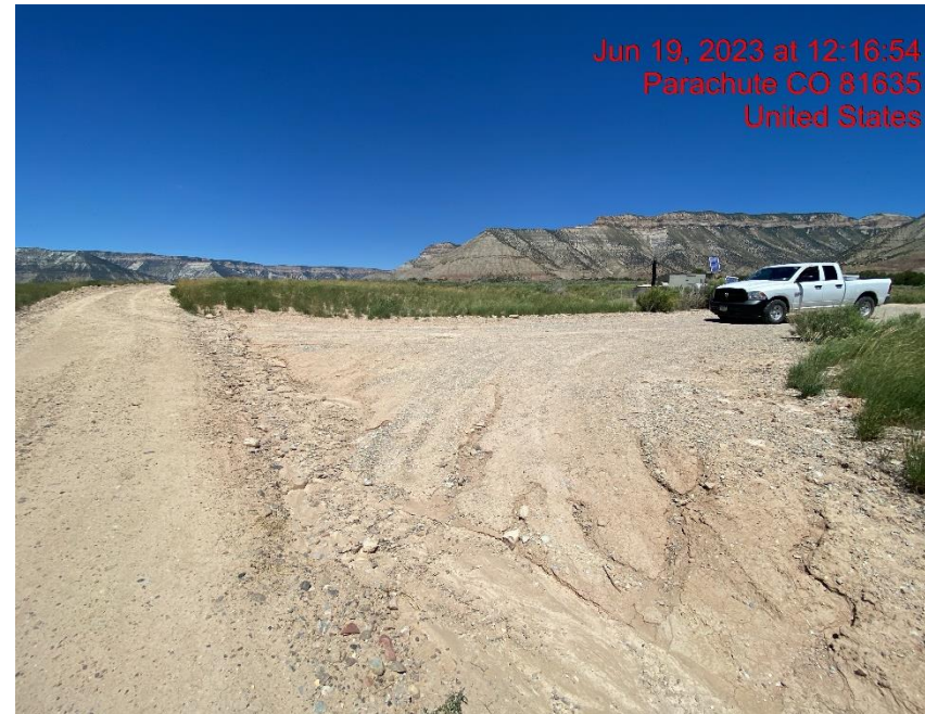
Insufficient Vehicle Tracking BMPs at Location Entrance/Exit – Photo #04579