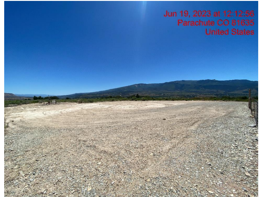
NW Corner of Location – Photo #04566