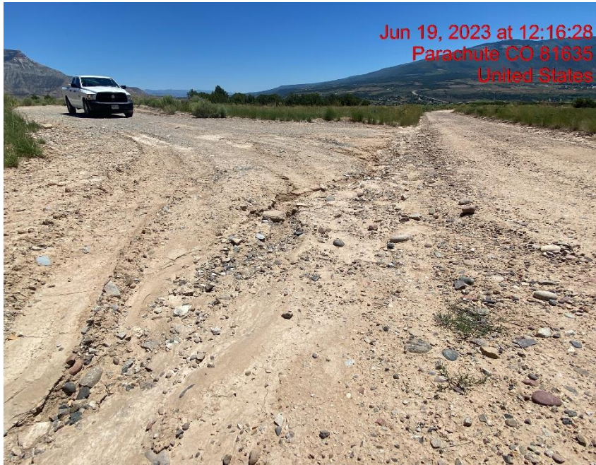
Rill Erosion Across Access Road – Photo #04576