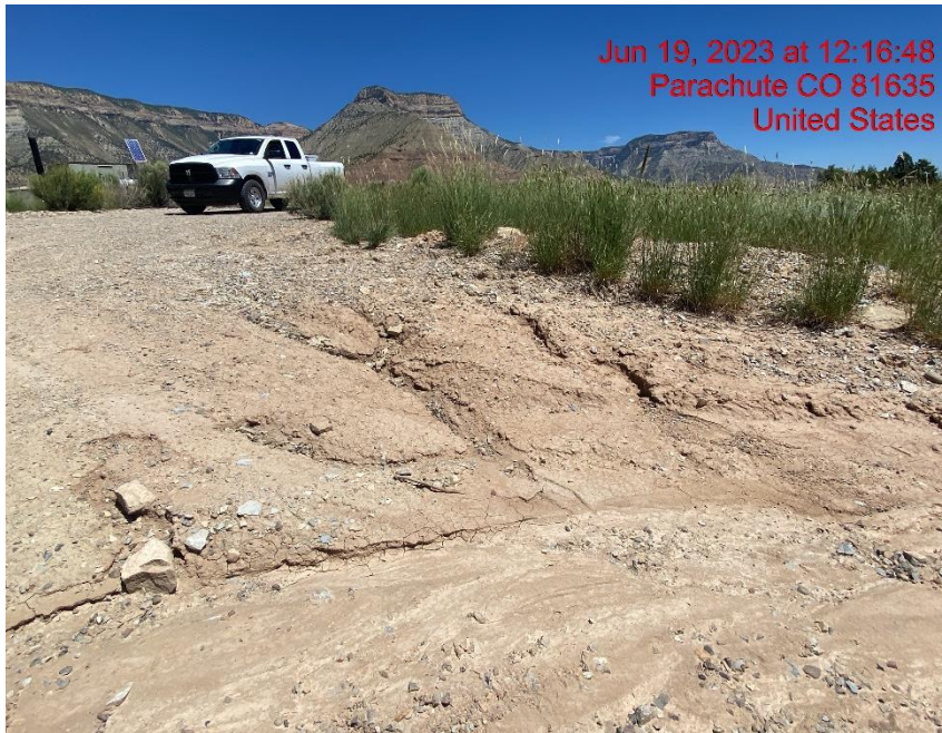
Rill Erosion Across Access Road – Photo #04578