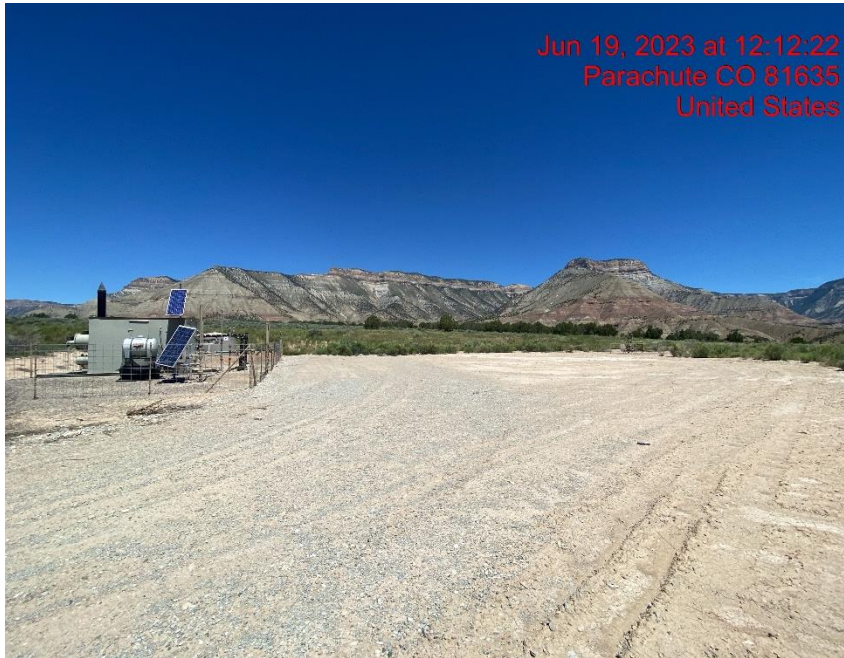
SW Corner of Location – Photo #04565