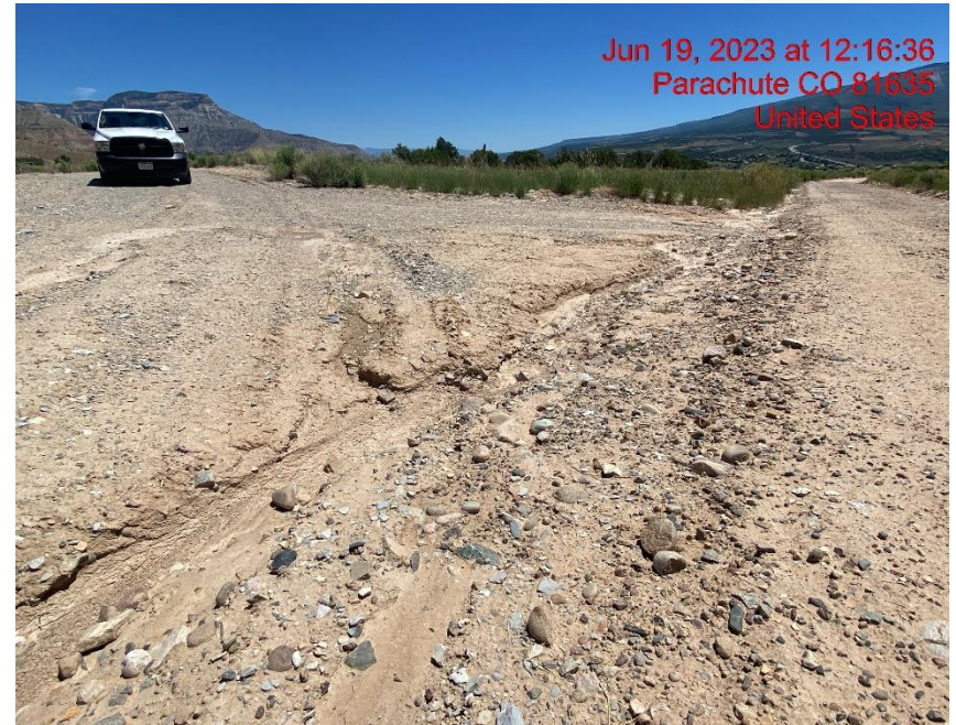
Rill Erosion Across Access Road – Photo #04577