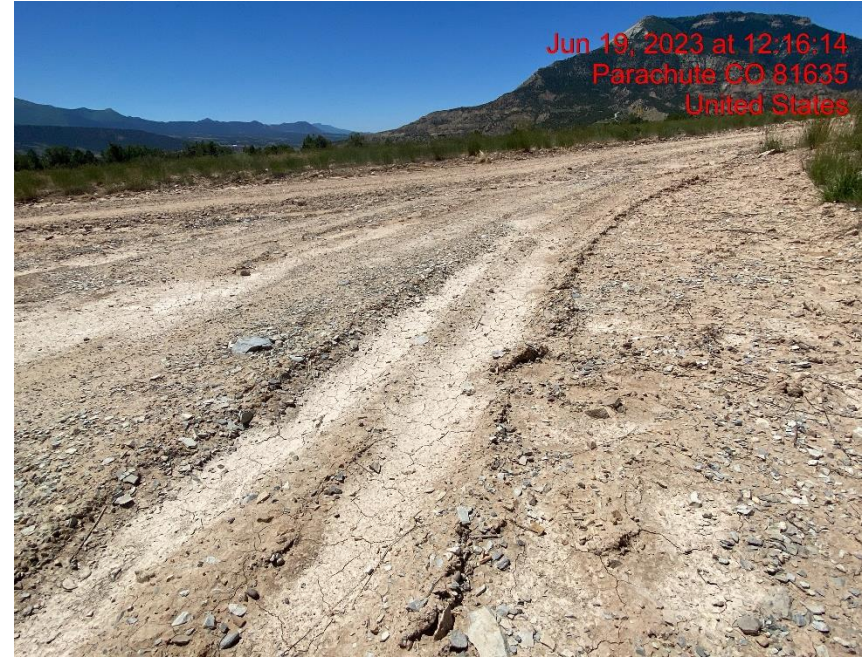
Access Road Lacks Stabilization – Photo #04575