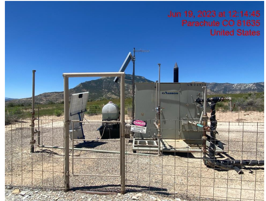
Separators – Photo #04570