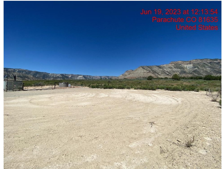
NE Corner of Location – Photo #04567

Jun 19, 2023 at 12:13:54 Parachute CO 81635 United States