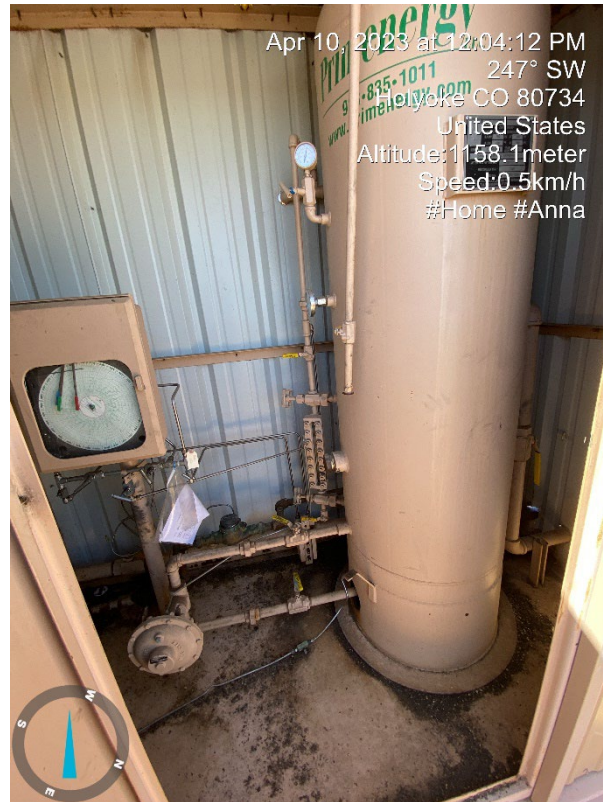
3. VGS and meter run in meter shed