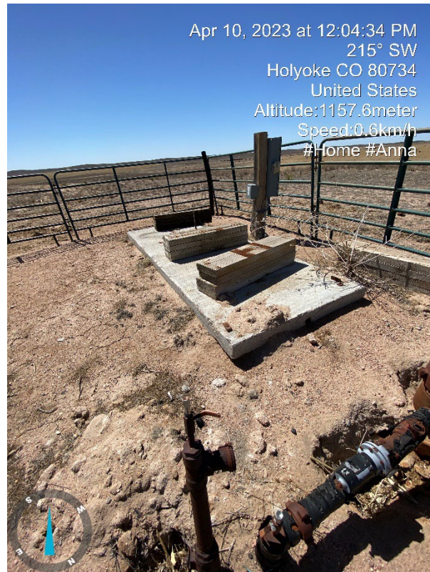
1. No Lease sign on location