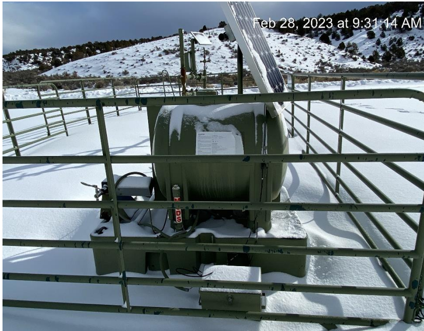
No NFPA labeling