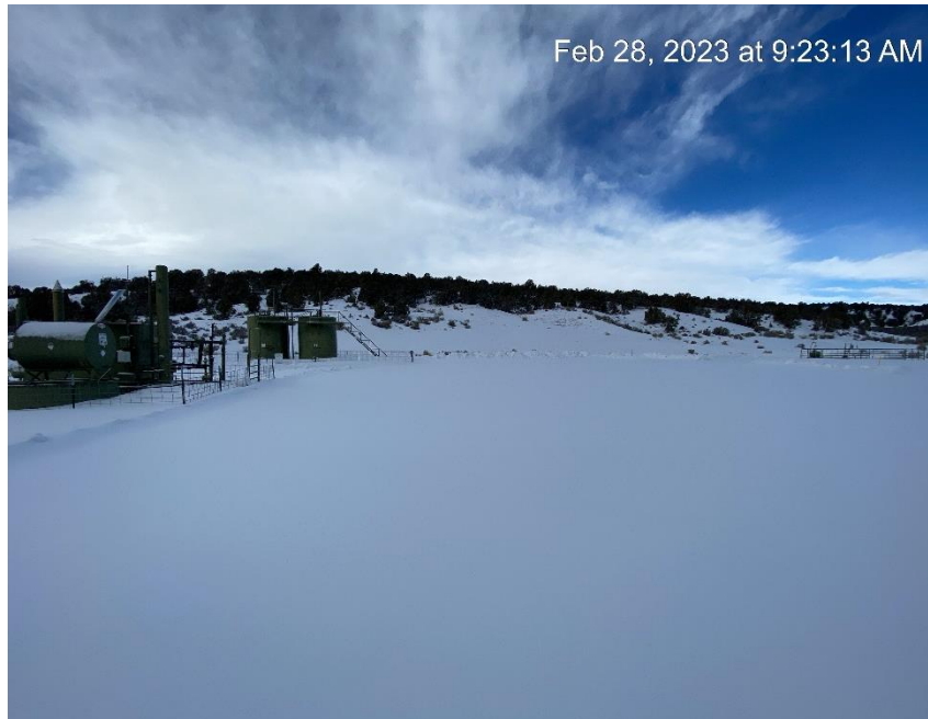
From entrance to location