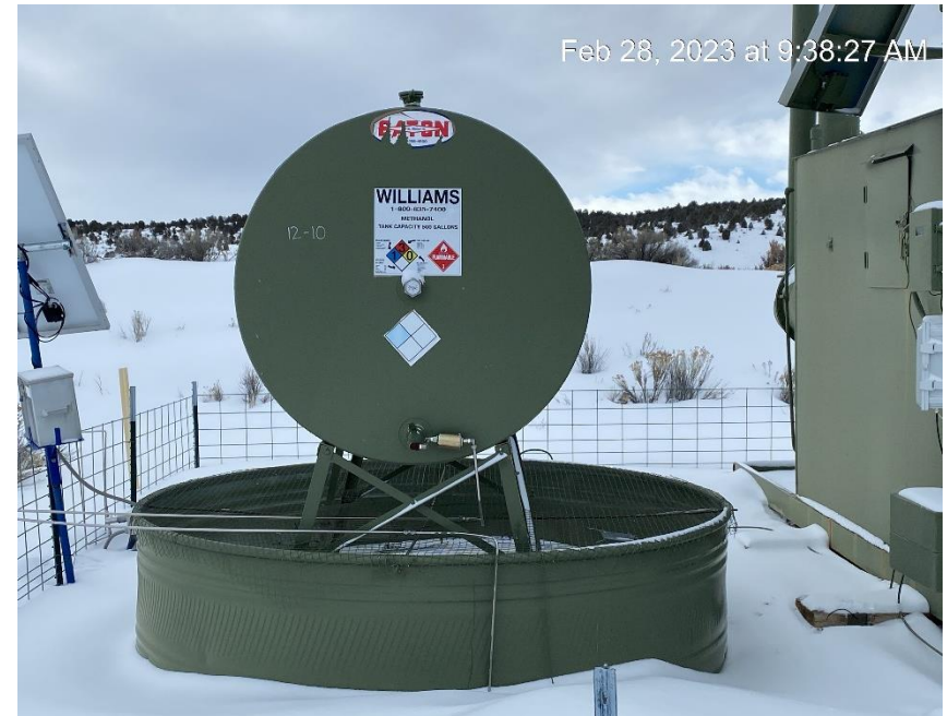
Methanol tank label needs to be updated