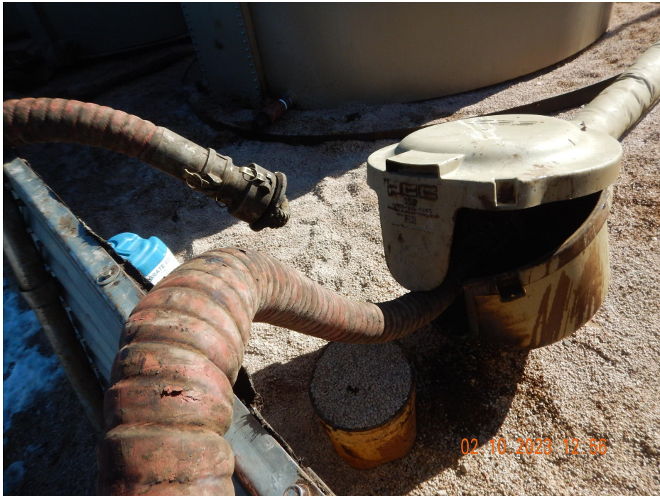
Photo 14. Photo taken from the western location. Photo illustrates a hose left hooked up which could contribute to a potential spill.