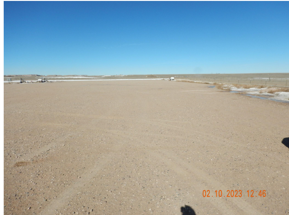
Photo 5. Photo taken from the southern location, facing North. See comments under Photo 4.