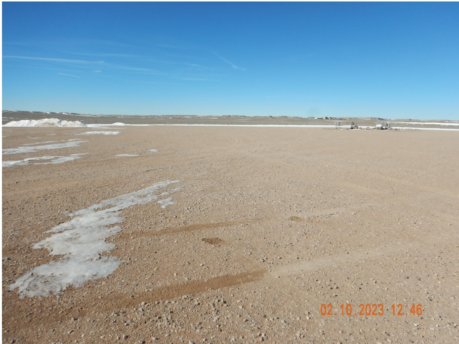
Photo 4. Photo taken from the southern location, facing West. Photo illustrates interim reclamation has not been performed.