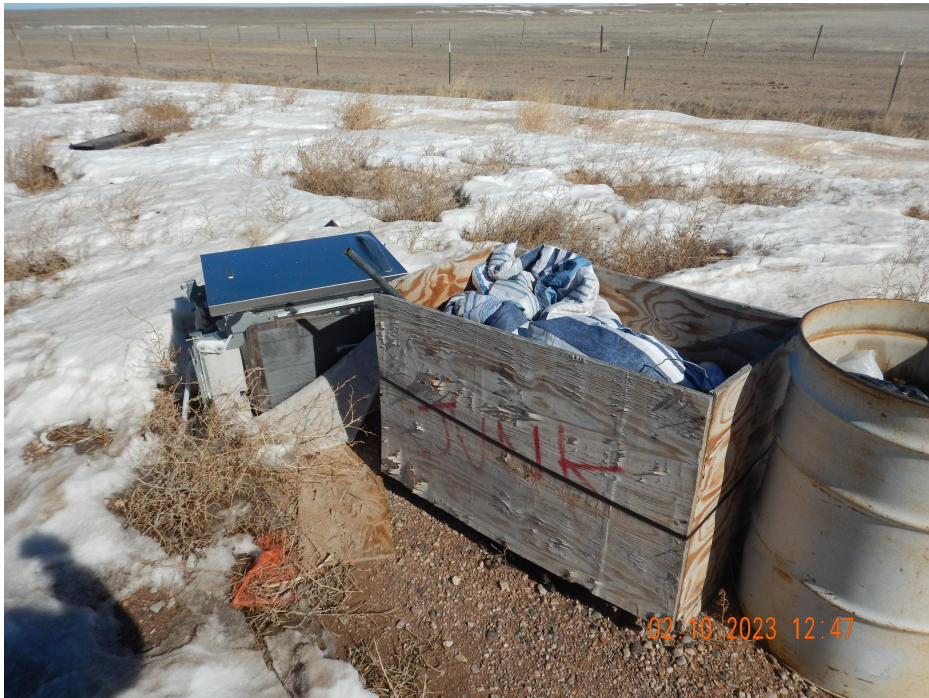
Photo 6. Photo taken from the southeastern location, facing East. Photo illustrates trash being stored on location.

Note- weeds were observed along the eastern perimeter of location.