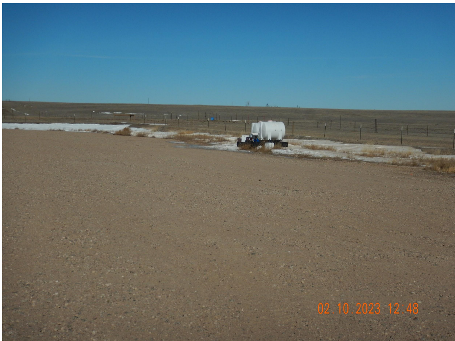
Photo 8. Photo taken from the northeastern location, facing Northeast. Photo illustrates chemicals being stored on location.