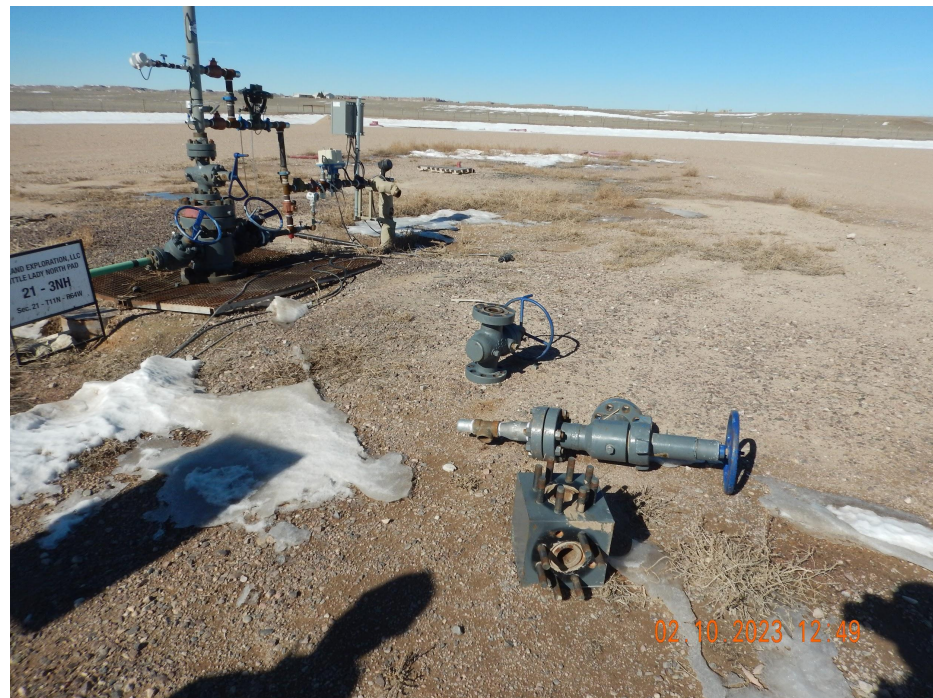
Photo 9. Photo taken from the wellheads, facing North. See comments under Photos 6 & 7.