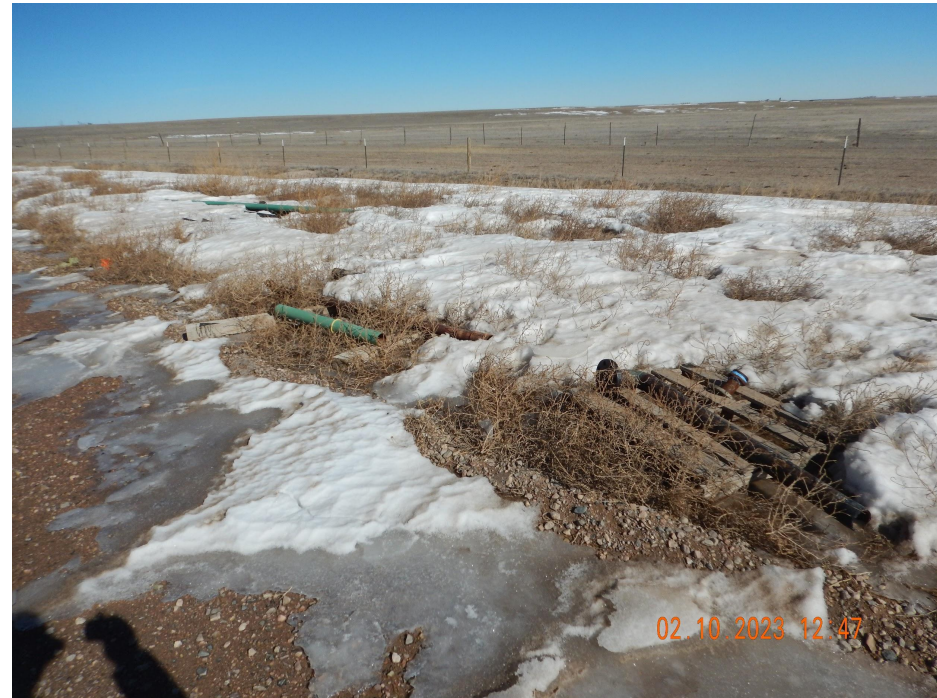
Photo 7. Photo taken from the southeastern location, facing Northeast. Photo illustrates debris and equipment being stored on location.

Note- weeds were observed along the eastern perimeter of location.