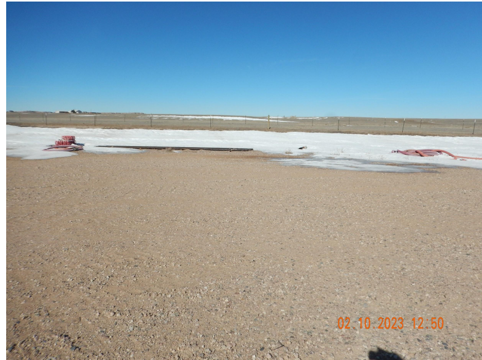
Photo 11. Photo taken from the northwestern location, facing North. See comments under Photos 6 & 7.

Note- weeds were observed around the wellhead area.