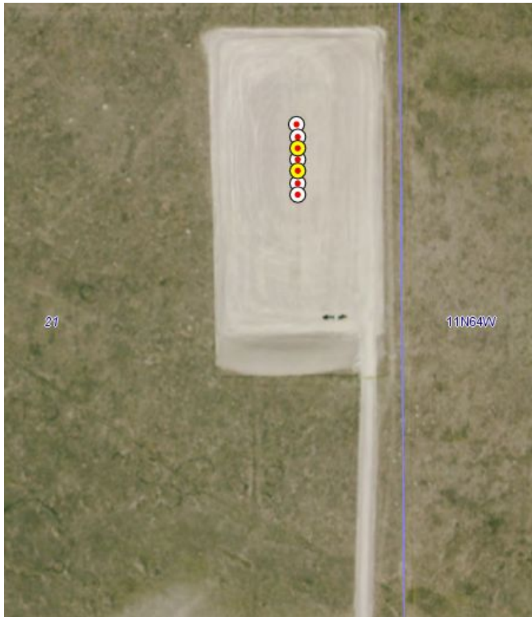
Photo 2. COGCC GISOnline aerial imagery from 2019 illustrates the location. At the time of this inspection, the location remains the same size and interim reclamation has not been performed- refer to Photos 4-5.