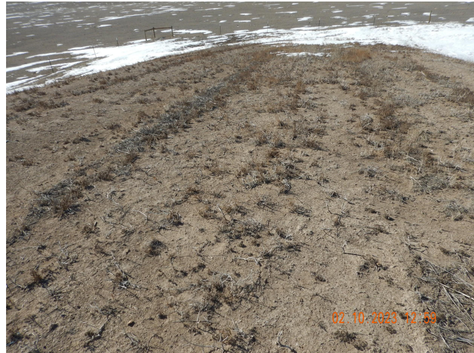
Photo 15. Photo taken from the southern location, facing West. Photo illustrates the topsoil stockpile which is primarily bare or has weedy, annual vegetation with minimal perennial vegetation that would not met the standard.