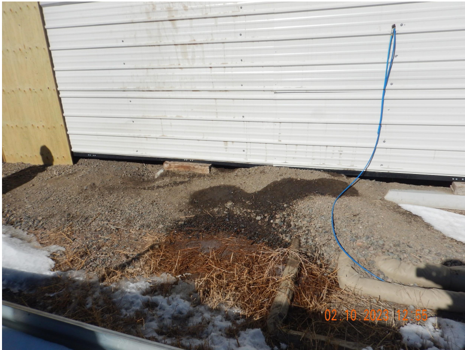
Photo 12. Photo taken from the western location. Photo illustrates stained soil/spill related to the compressor.