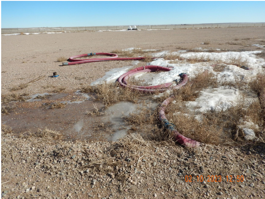
Photo 10. Photo taken from the wellheads, facing East. See comments under Photos 6 & 7.

Note- weeds were observed around the wellhead area.