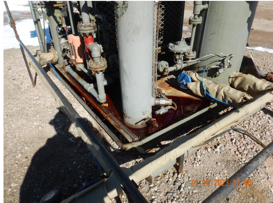
Photo 13. Photo taken from the western location. Photo illustrates spills within secondary containment. Remove and properly dispose fluids from within the secondary containment.