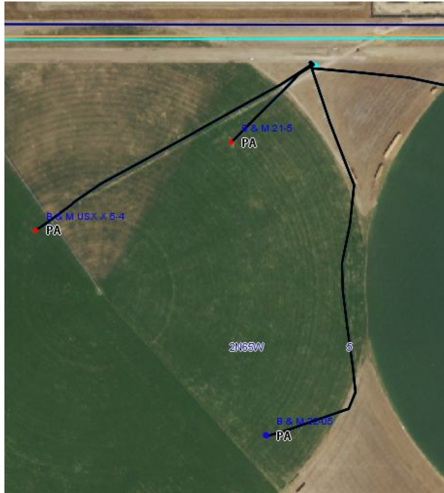
Photo 2. COGCC Online Map aerial imagery 2019 with related wells (red dots), subject well (blue dot), tank battery (near northeast corner) and flowlines (black lines).