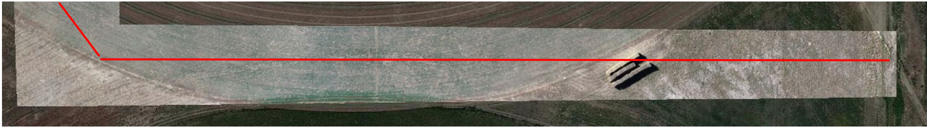
Photo 5. Zoomed in Orthomosaic taken from 200 ft (Oct. 2022). Illustrates harvested crop growth along flowline (red line). Appears similar to rest of area, however crop height cannot be fully evaluated. Another inspection is required when crop is actively growing.