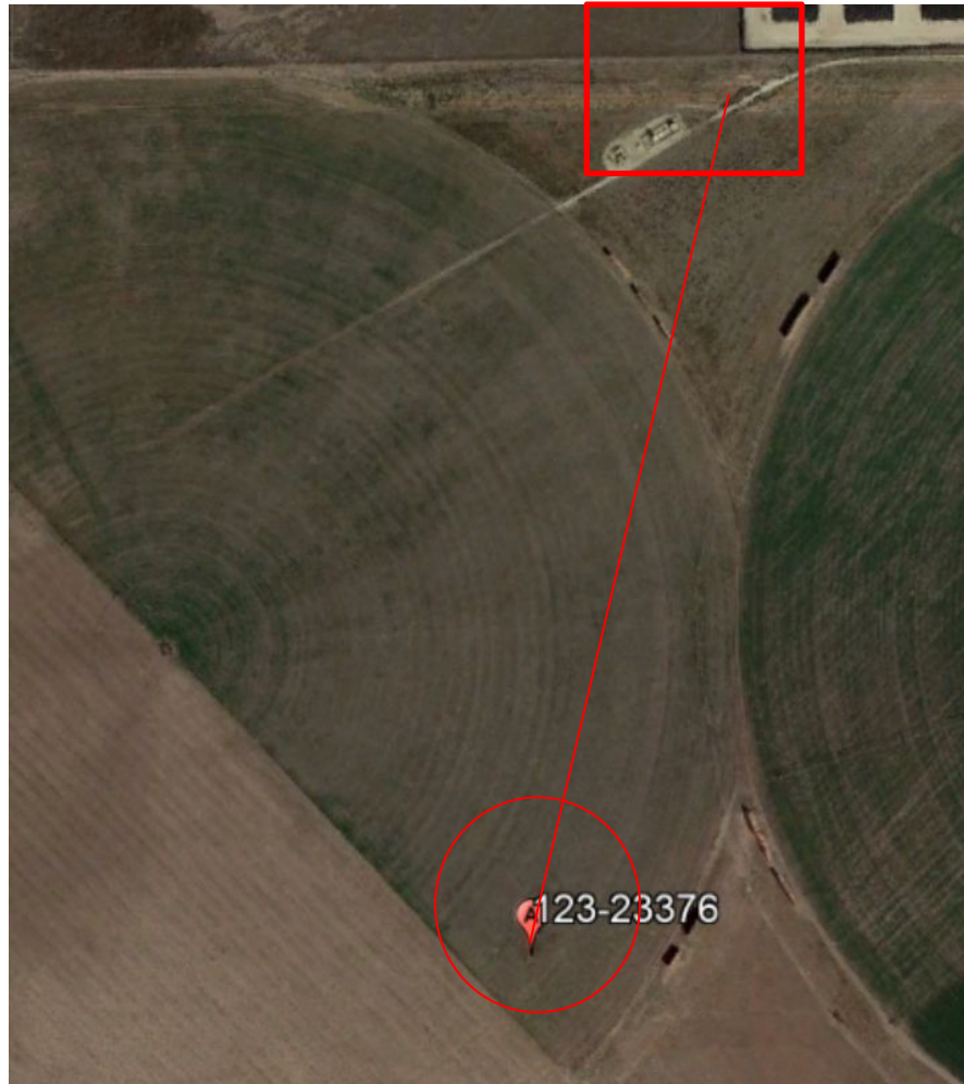
Photo 1. Google Earth aerial imagery taken 10/2015 during active operations. Photo illustrates the well location (red circle), tank battery (red square), and flowline (red line).