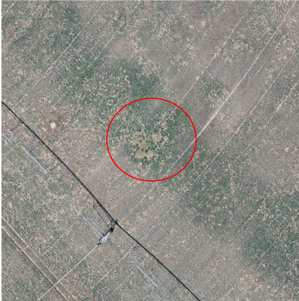
Photo 4. Zoomed in Orthomosaic taken from 200 ft (Oct. 2022). Illustrates harvested crop on and around the well location (red circle). Shows signs of sparse crop coverage and undesirable plants are more prevalent.