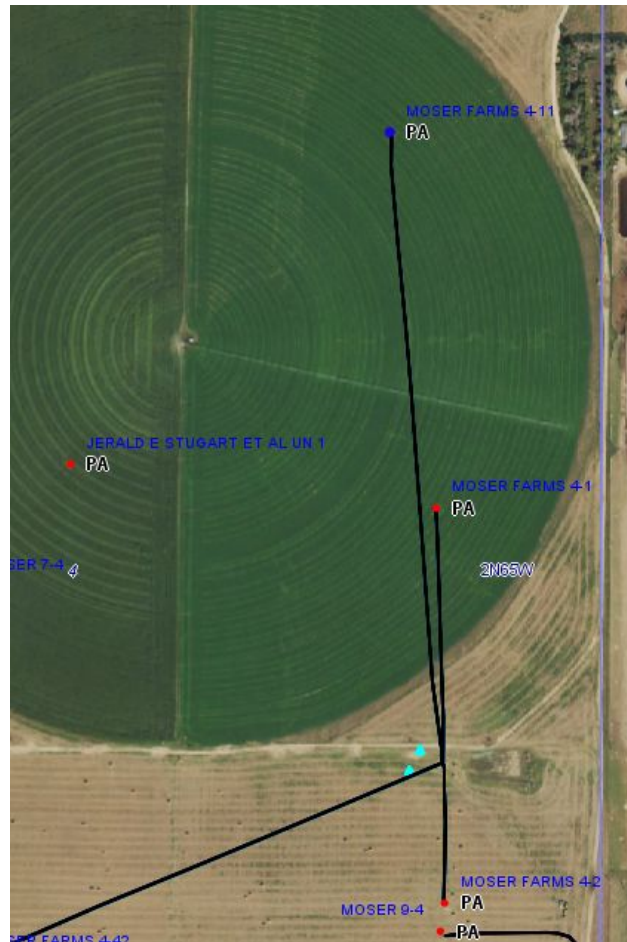
Photo 2. COGCC Online Map aerial imagery 2019 with subject well (blue dot), related wells (red dots), tank battery (southeast) and flowlines (black lines).