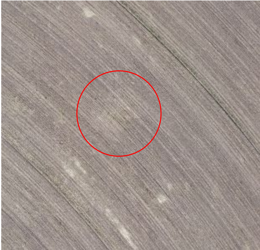
Photo 4. Zoomed in Orthomosaic taken from 200 ft (Oct. 2022). Illustrates harvested crop on and around the well location (red circle). Appears similar to rest of area, however crop height cannot be fully evaluated. Another inspection is required when crop is actively growing.