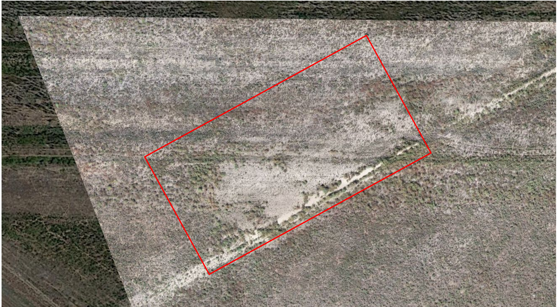
Photo 5. Zoomed in Orthomosaic taken from 200 ft (Oct. 2022). Illustrates some growth on and around the tank battery (red rectangle) but bare dirt prevalent.