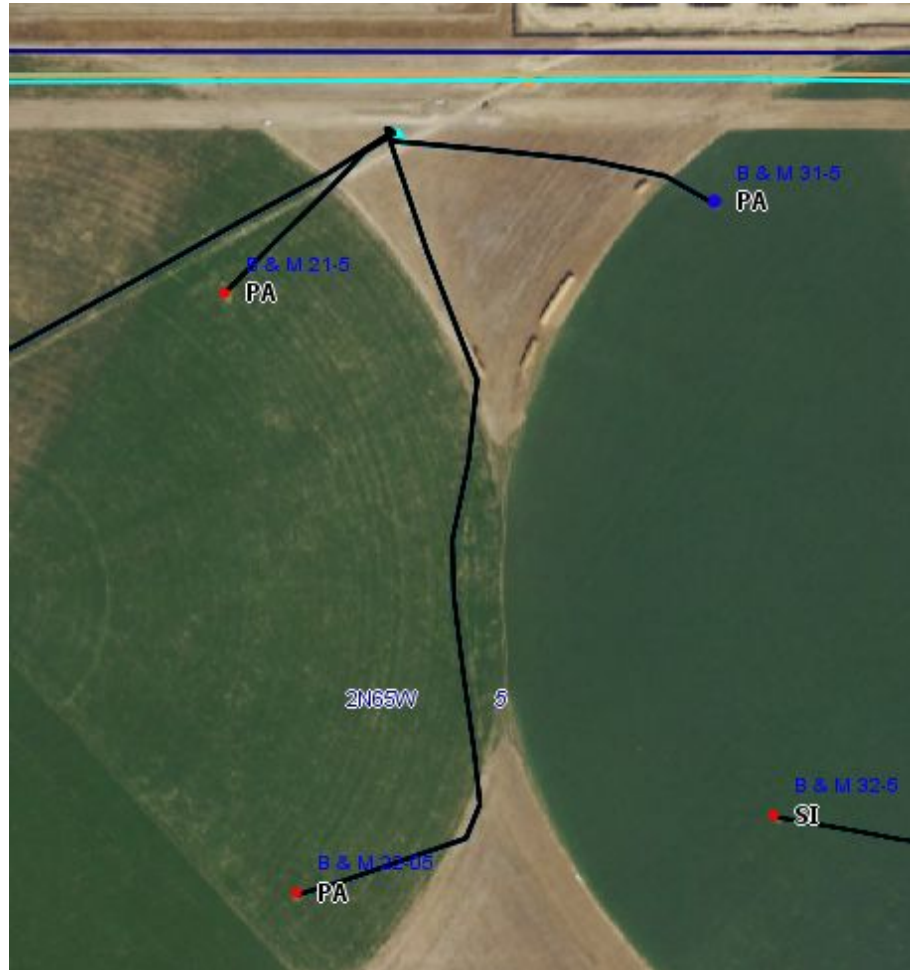
Photo 2. COGCC Online Map aerial imagery 2019 with subject well (blue dot), related wells (red dots), tank battery (north center) and flowlines (black lines).