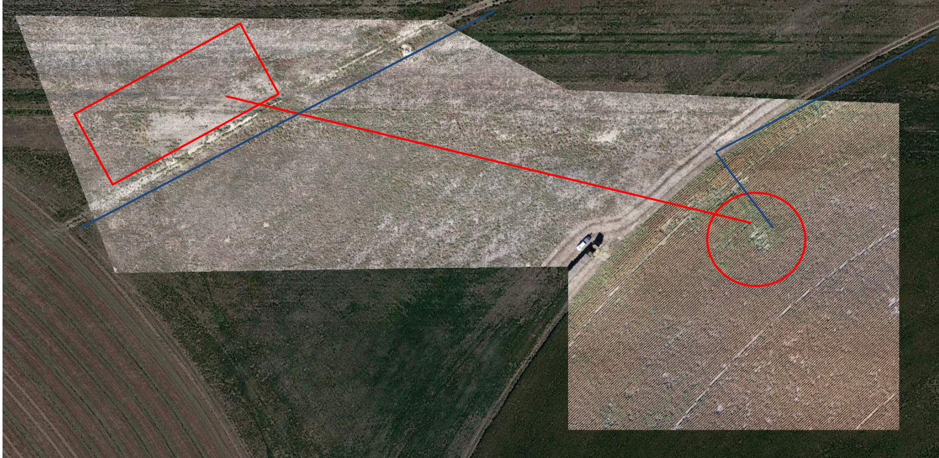
Photo 3. Orthomosaic drone aerial imagery taken from 200 ft (Oct. 2022). Illustrates mature crop (ready to harvest) on and around the well location (red circle), road (blue line) and flowline. Tank battery (red rectangle) and most of access road are between two fields in the corners, rangeland.