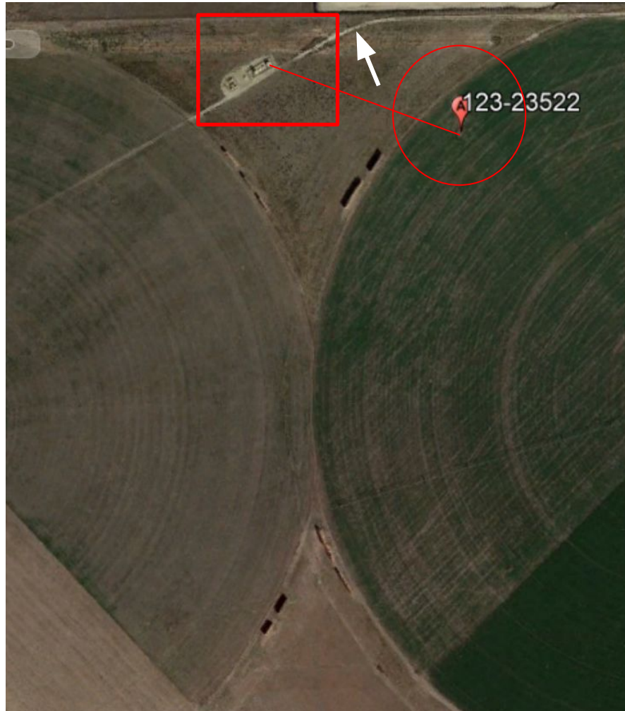
Photo 1. Google Earth aerial imagery taken 10/2015 during active operations. Photo illustrates the well location (red circle), tank battery (red square), and well location access road (white arrow).