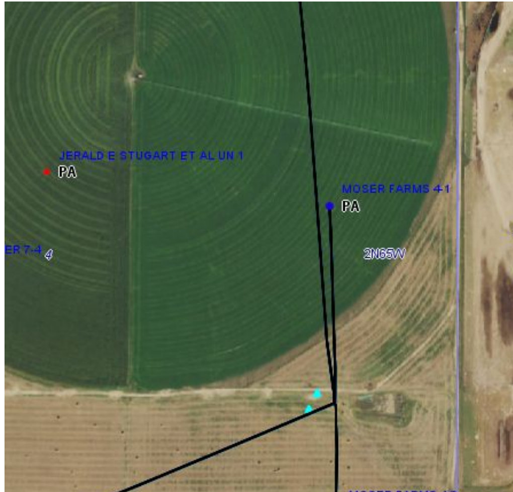
Photo 2. COGCC Online Map aerial imagery 2019 with subject wells (red rectangle), related wells (red dots outside of red rectangle), tank battery (southern center) and flowlines (black lines).