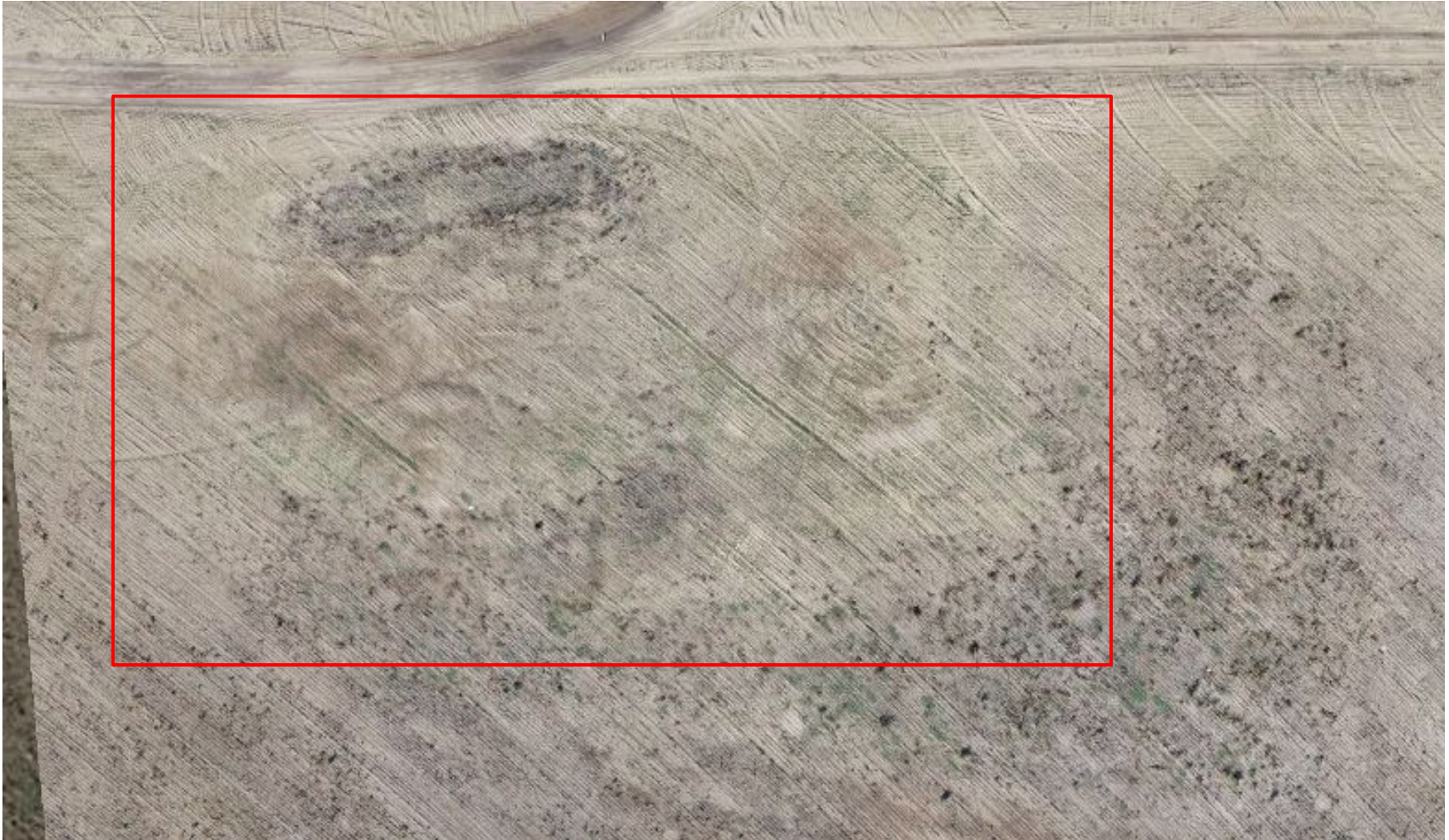
Photo 5. Zoomed in Orthomosaic taken from 200 ft (Oct. 2022). Illustrates bare ground on and around the tank battery (red rectangle).