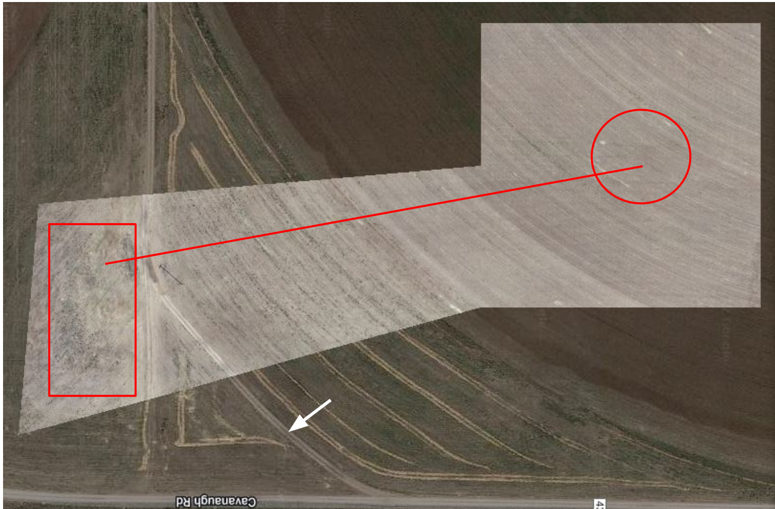
Photo 3. Orthomosaic drone aerial imagery taken from 200 ft (Oct. 2022). Illustrates growth on and around the well location (red circle), flowlines (red lines), tank battery (red rectangle) and access road (white arrow).