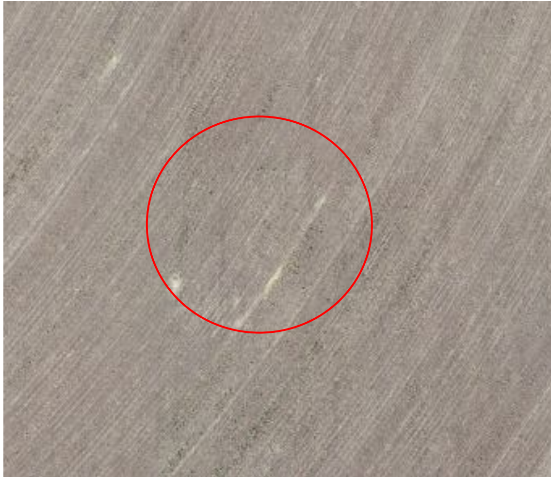
Photo 4. Zoomed in Orthomosaic taken from 200 ft (Oct. 2022). Illustrates growth on and around the well location (red circle).