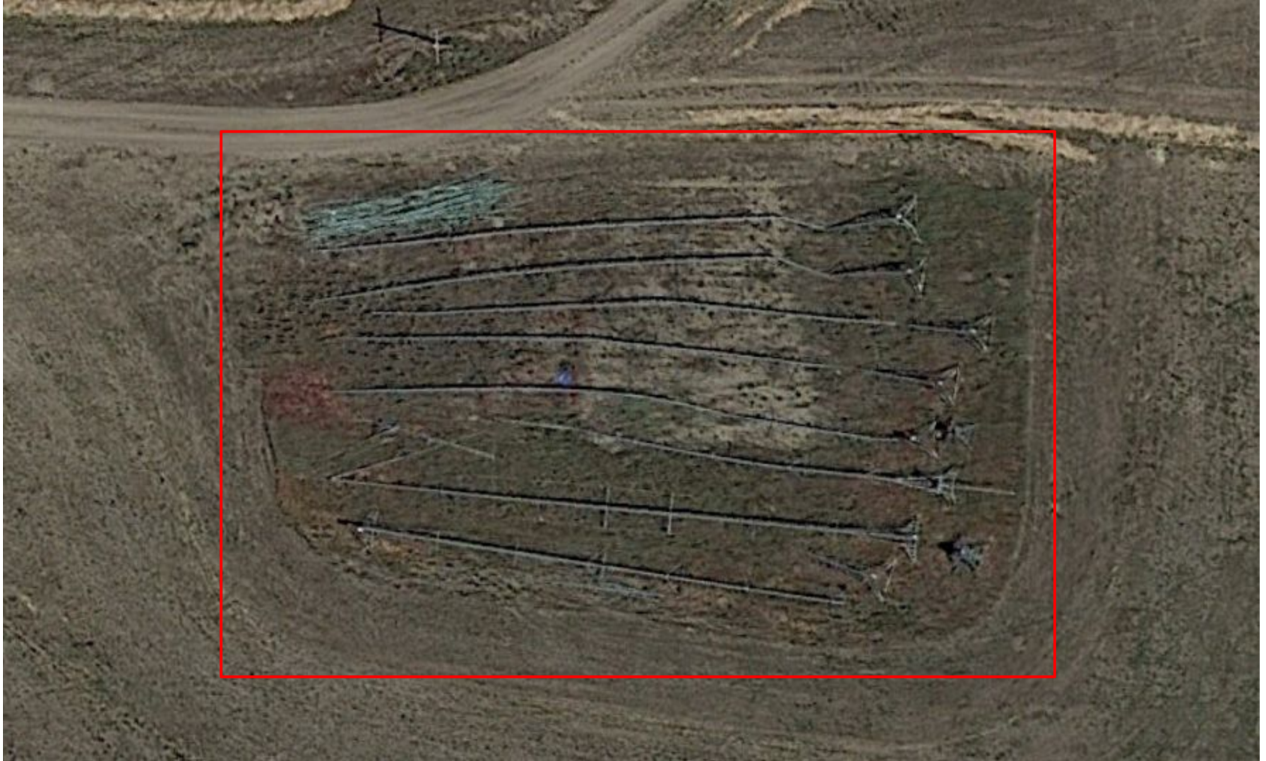
Photo 6. Google Earth imagery from 6/10/21 shows tank battery (red rectangle) was in use by land owner for agriculture storage.