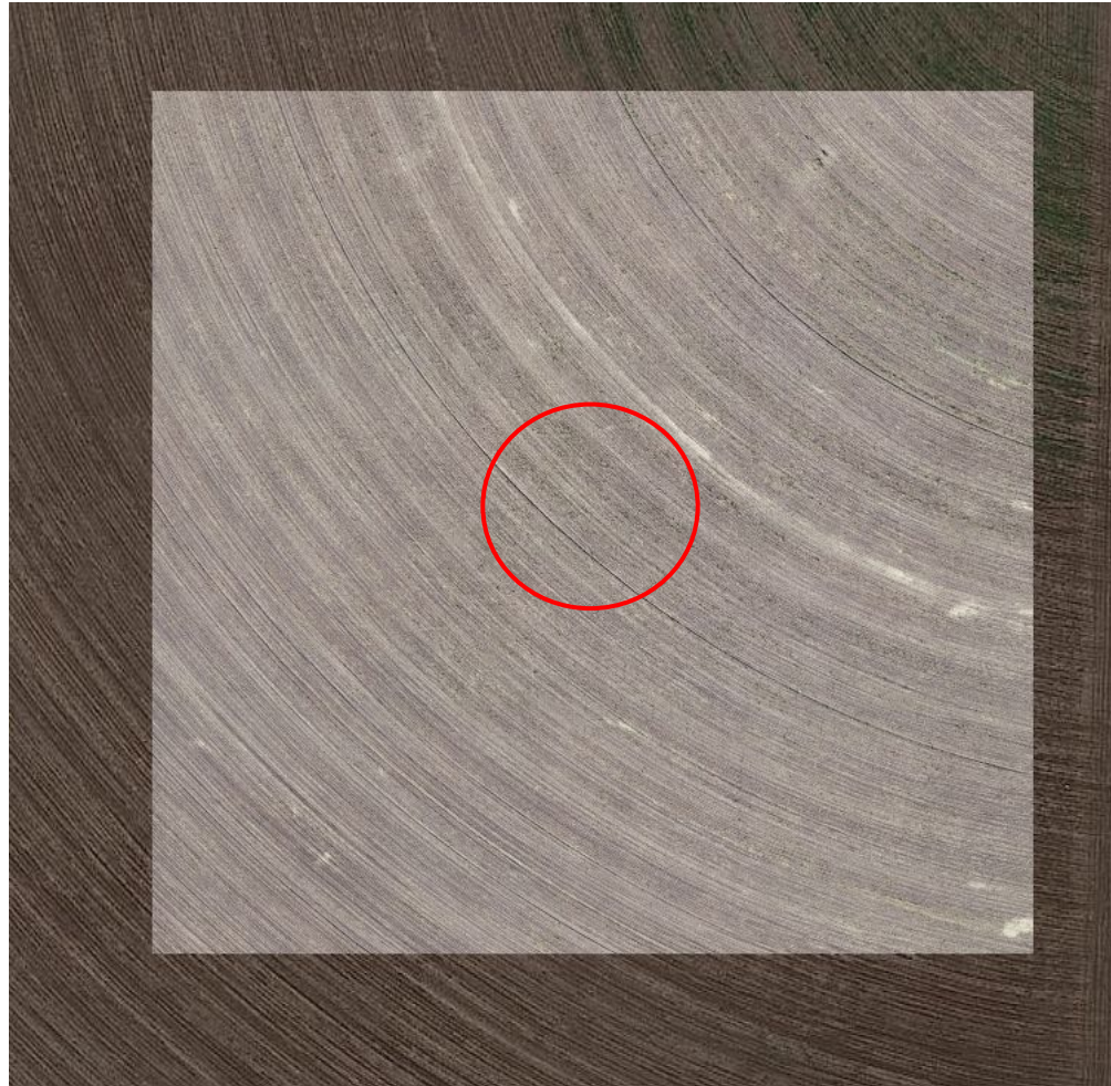
Photo 3. Orthomosaic drone aerial imagery taken from 200 ft (Oct. 2022). Illustrates growth on and around the well location (red circle). Tank Battery is addressed in Location 327566 report.