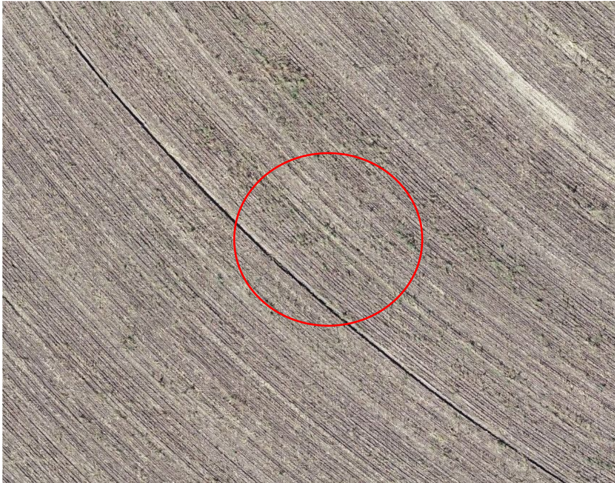
Photo 4. Zoomed in Orthomosaic taken from 200 ft (Oct. 2022). Illustrates harvested crop on and around the well location (red circle). Appears similar to rest of area, however crop height cannot be fully evaluated. Another inspection is required when crop is actively growing.