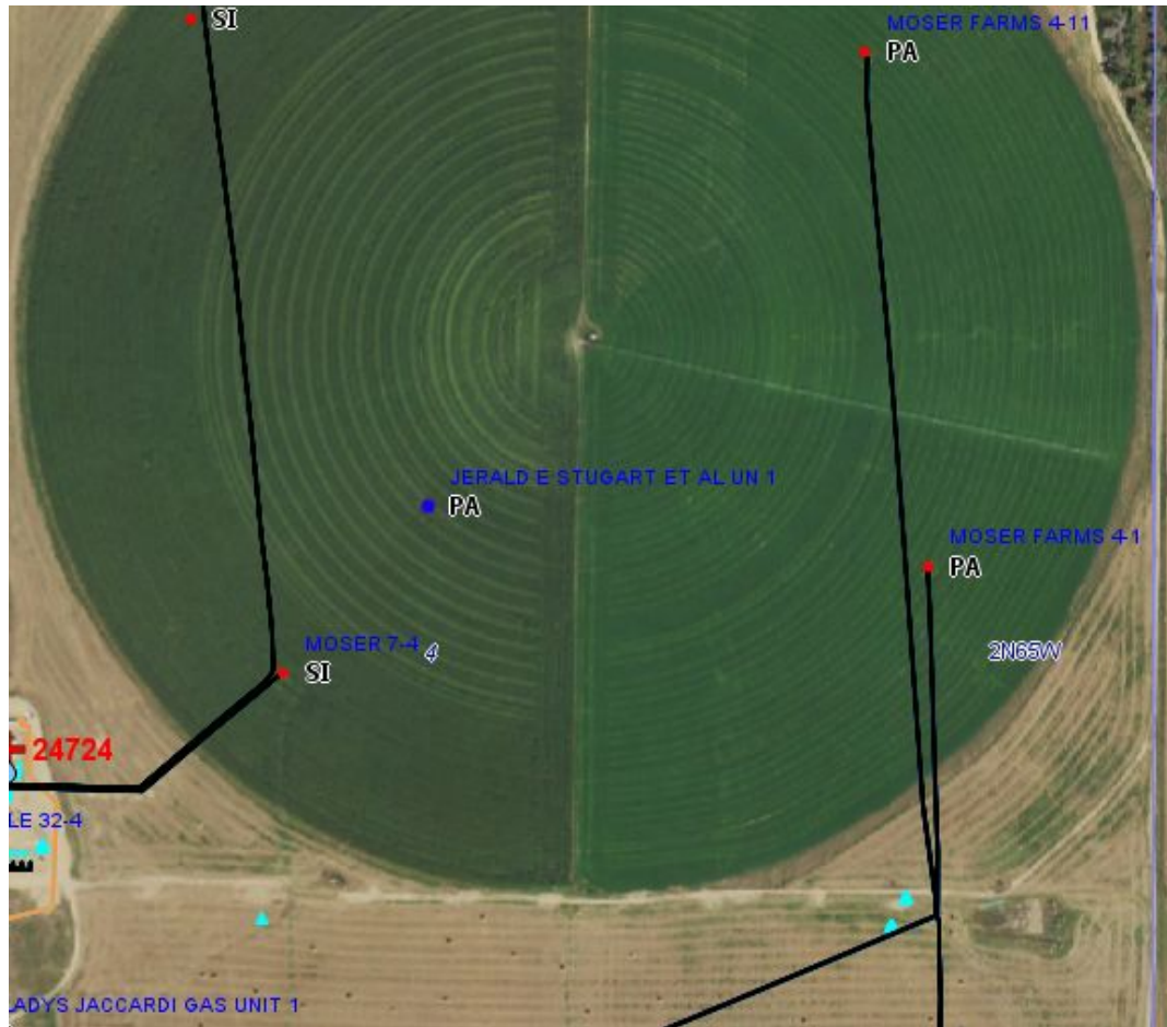
Photo 2. COGCC Online Map aerial imagery 2019 with subject wells (red rectangle), related wells (red dots outside of red rectangle), tank battery (southern center) and flowlines (black lines).