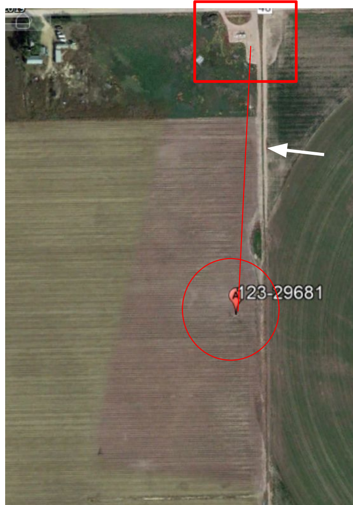
Photo 1. Google Earth aerial imagery taken 7/2019 during active operations. Photo illustrates the well location (red circle), tank battery (red rectangle), access road (white arrow), and approximate flowlines (red line).