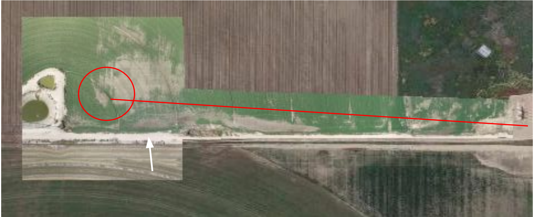
Photo 3. Orthomosaic drone aerial imagery taken from 200 ft (Oct. 2022). Illustrates harvested crop on and around the well location (red circle), flowlines (red line), and access road (white arrow). Tank Battery is addressed in Location 329596 report.