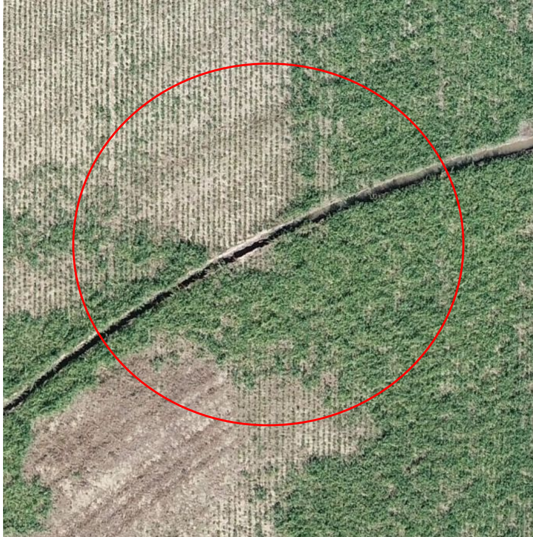
Photo 4. Zoomed in Orthomosaic taken from 200 ft (Oct. 2022). Illustrates harvested crop on and around the well location (red circle). Appears similar to rest of area, however crop height cannot be fully evaluated. Another inspection is required when crop is actively growing.