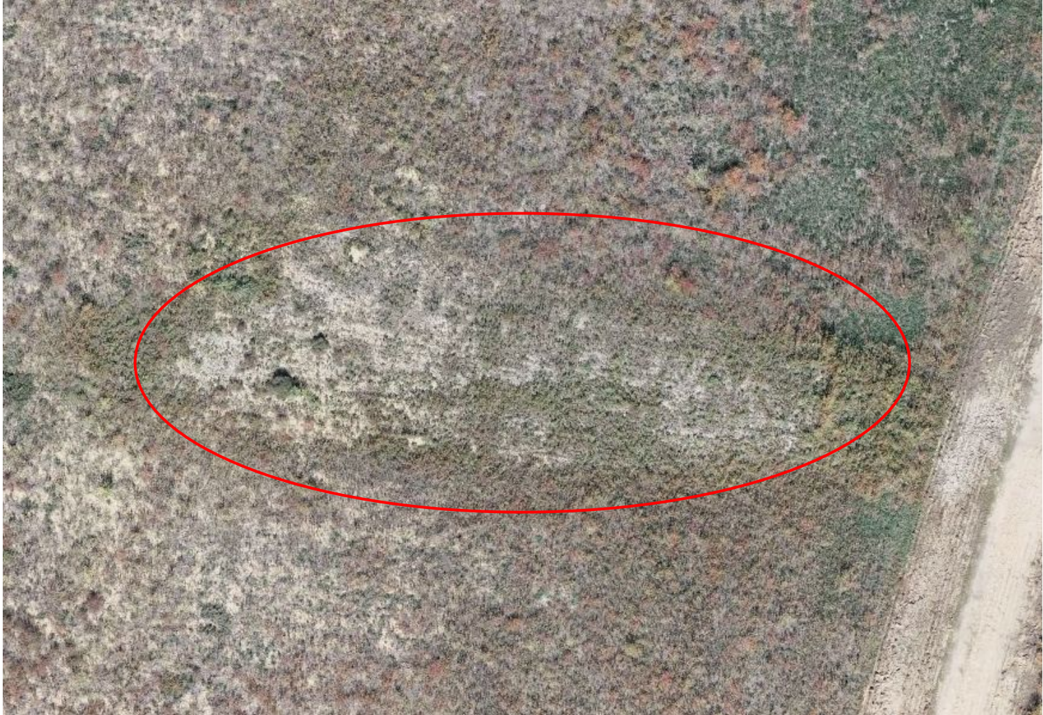
Photo 4. Zoomed in Orthomosaic taken from 200 ft (Oct. 2022). Illustrates non-agricultural growth on and around the well location (red oval). Still some bare dirt visible although minimal.