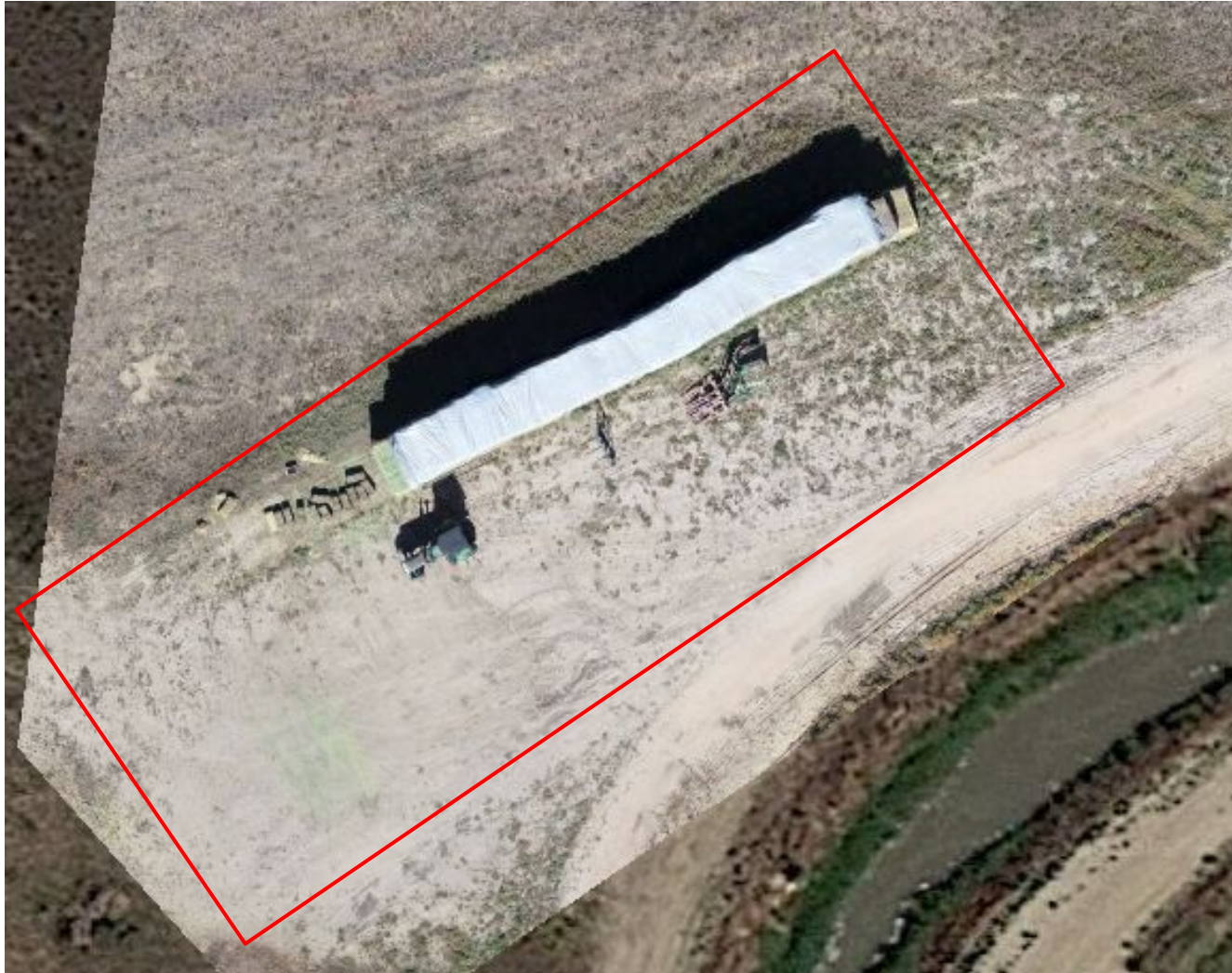
Photo 5. Zoomed in Orthomosaic taken from 200 ft (Oct. 2022). Illustrates the tank battery area (red rectangle) has not been reclaimed.