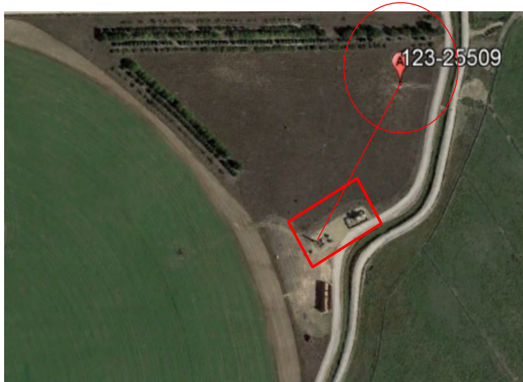
Photo 1. Google Earth aerial imagery taken 7/2019 during active operations. Photo illustrates the well location (red circle), tank battery (red rectangle), and approximate flowlines (red line).