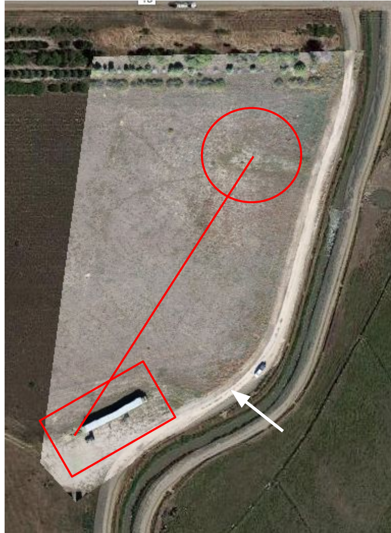
Photo 3. Orthomosaic drone aerial imagery taken from 200 ft (Oct. 2022). Illustrates non-agricultural growth on and around well location (red circle), tank battery (red rectangle), access road (white arrow), and approximate flowlines (red line).

Inspection Photos Location Name: SLEDGE C 9-28 Location ID: 309878