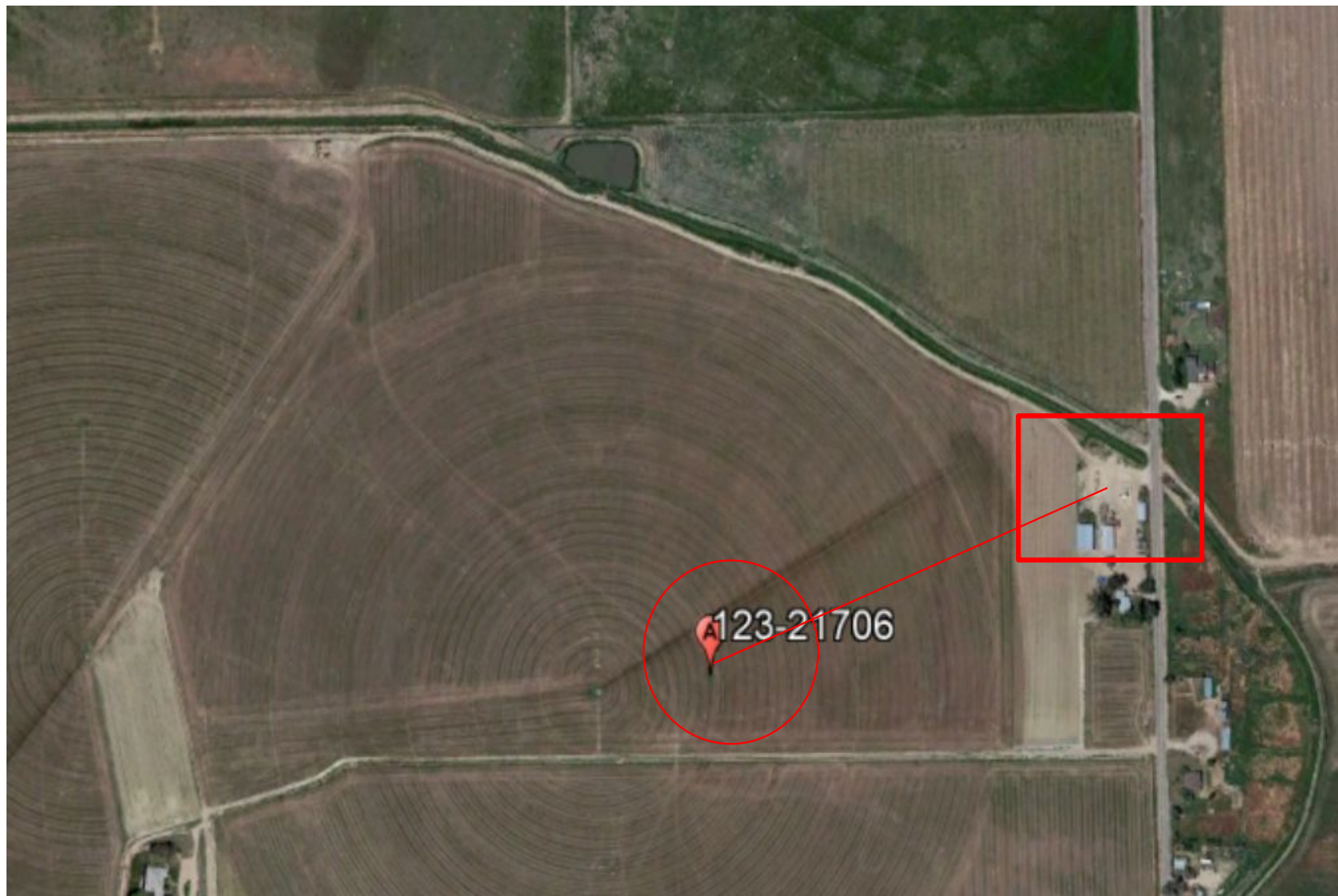
Photo 1. Google Earth aerial imagery taken 6/2016 during active operations. Photo illustrates the well location (red circle), tank battery (red square), and flowline (red line).