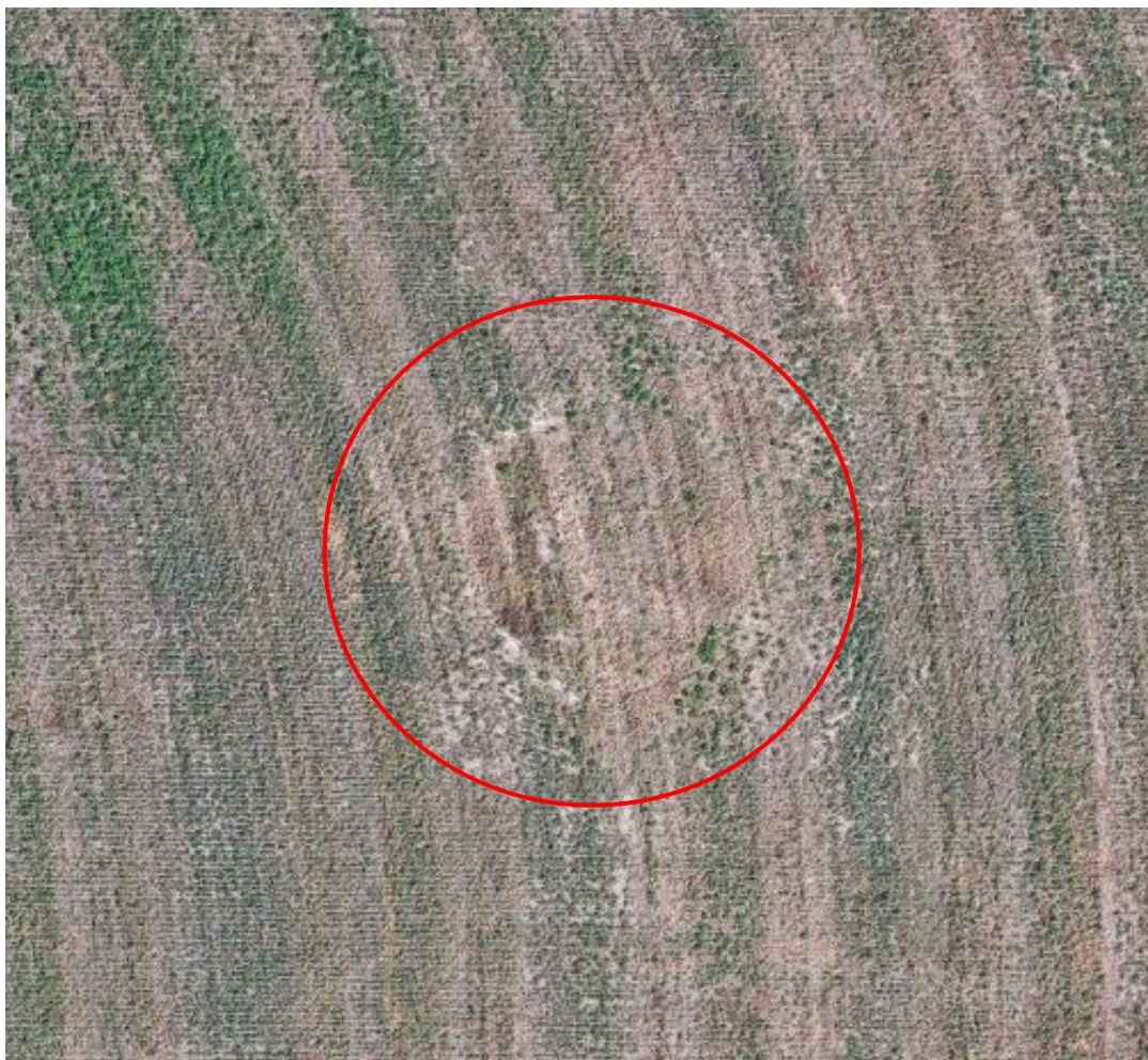
Photo 4. Zoomed in Orthomosaic taken from 200 ft (Oct. 2022). Illustrates harvested crop on and around the well location (red circle). Well scar is minimally visible; however crop height cannot be fully evaluated. Another inspection is required when crop is actively growing.