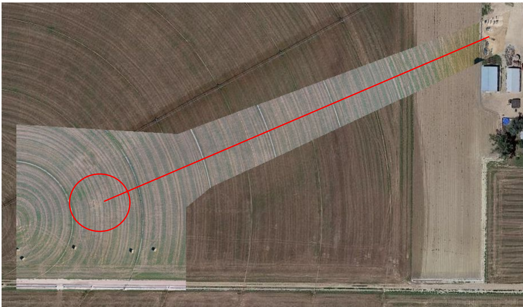
Photo 3. Orthomosaic drone aerial imagery taken from 200 ft (Oct. 2022). Illustrates harvested crop on and around the well location (red circle) and flowline (red line). No access road visible. Tank Battery is addressed in Location 329723 report.