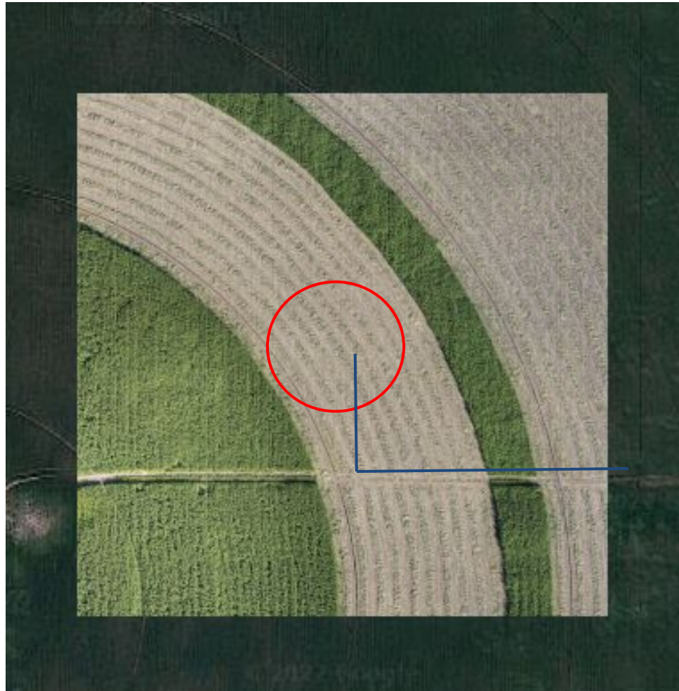
Photo 3. Orthomosaic drone aerial imagery taken from 200 ft (Oct. 2022). Illustrates harvested crop on and around the well location (red circle) and access road (blue line). Access road is shared with active agriculture. Tank Battery is addressed in Location 305601 report.