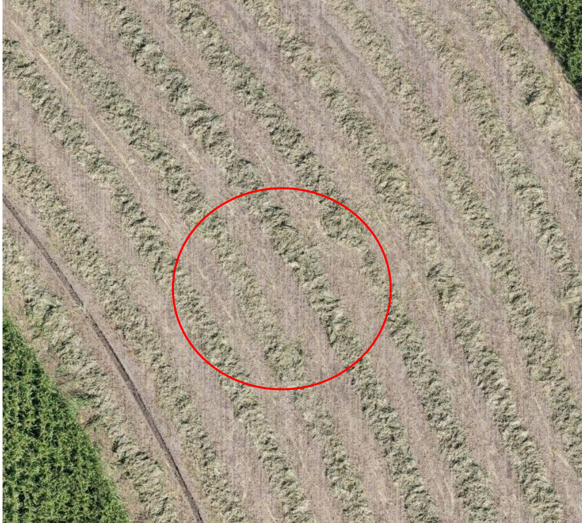
Photo 4. Zoomed in Orthomosaic taken from 200 ft (Oct. 2022). Illustrates harvested crop on and around the well location (red circle). Appears similar to rest of area, however crop height cannot be fully evaluated. Another inspection is required when crop is actively growing.