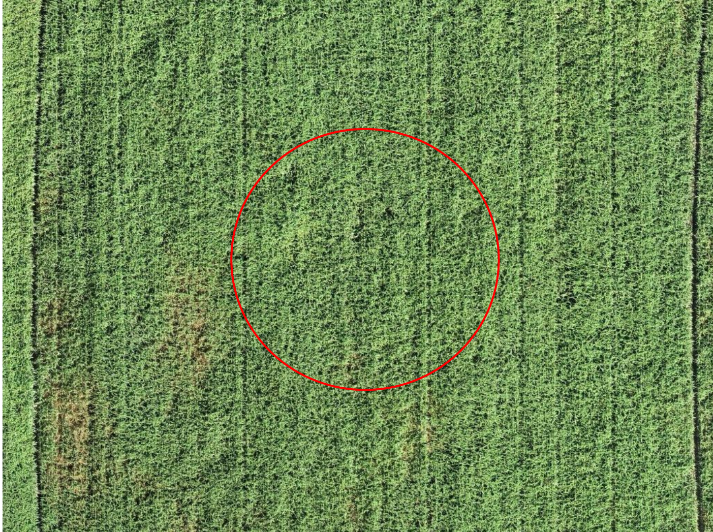
Photo 4. Zoomed in Orthomosaic taken from 200 ft (Oct. 2022). Illustrates mature crop growth on and around the well location (red circle).