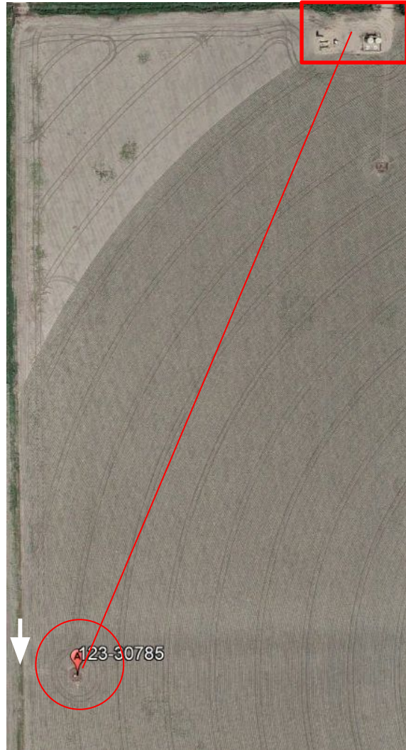
Photo 1. Google Earth aerial imagery taken 7/2019 during active operations. Photo illustrates the well location (red circle), tank battery (red square), flowline (red line), and well location access road (white arrow).