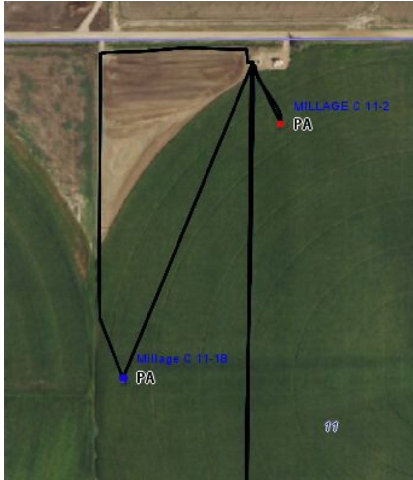
Photo 2. COGCC Online Map aerial imagery 2019 with subject well (blue dot), related wells (red dots), tank battery (north center) and flowlines (black lines).