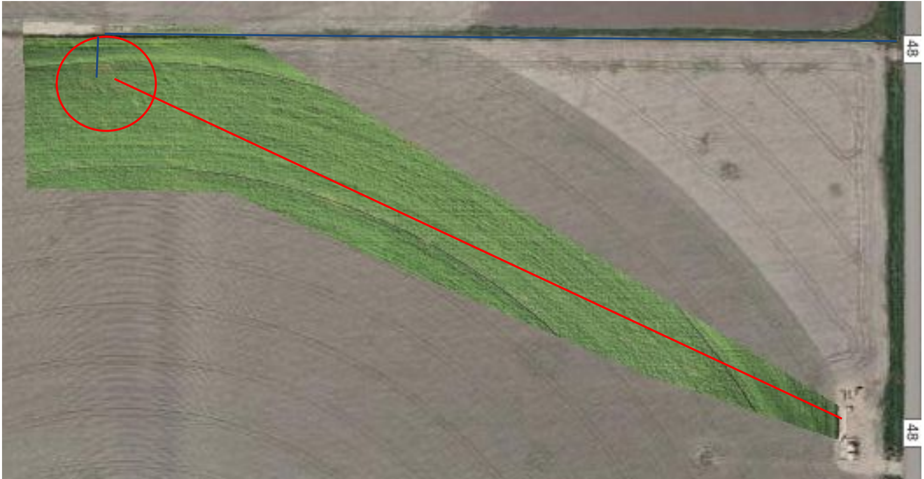
Photo 3. Orthomosaic drone aerial imagery taken from 200 ft (Oct. 2022). Illustrates mature crop growth on and around the well location (red circle) and flowline (red line) through the field. Access road (blue line) is on edge on field/property line. Tank Battery is addressed in Location 305093 report.