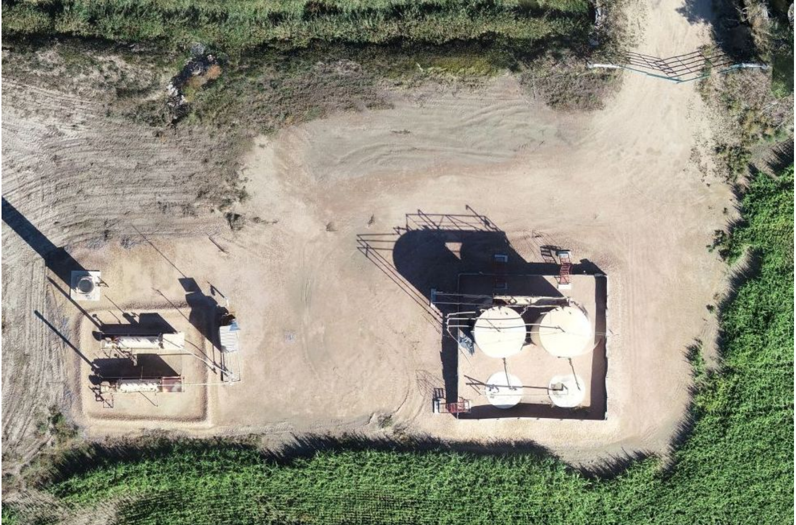
Photo 5. Zoomed in Orthomosaic taken from 200 ft (Oct. 2022). Illustrates the tank battery is still present.