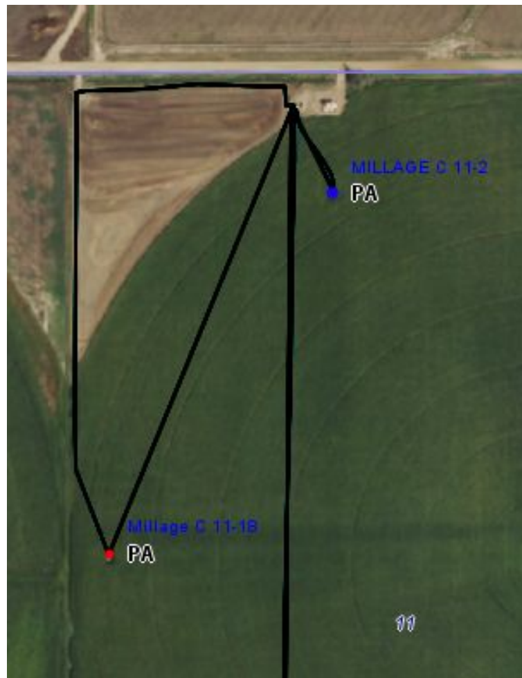
Photo 2. COGCC Online Map aerial imagery 2019 with subject well (blue dot), related wells (red dots), tank battery (north center) and flowlines (black lines). Flowline abandonment form has not been submitted.