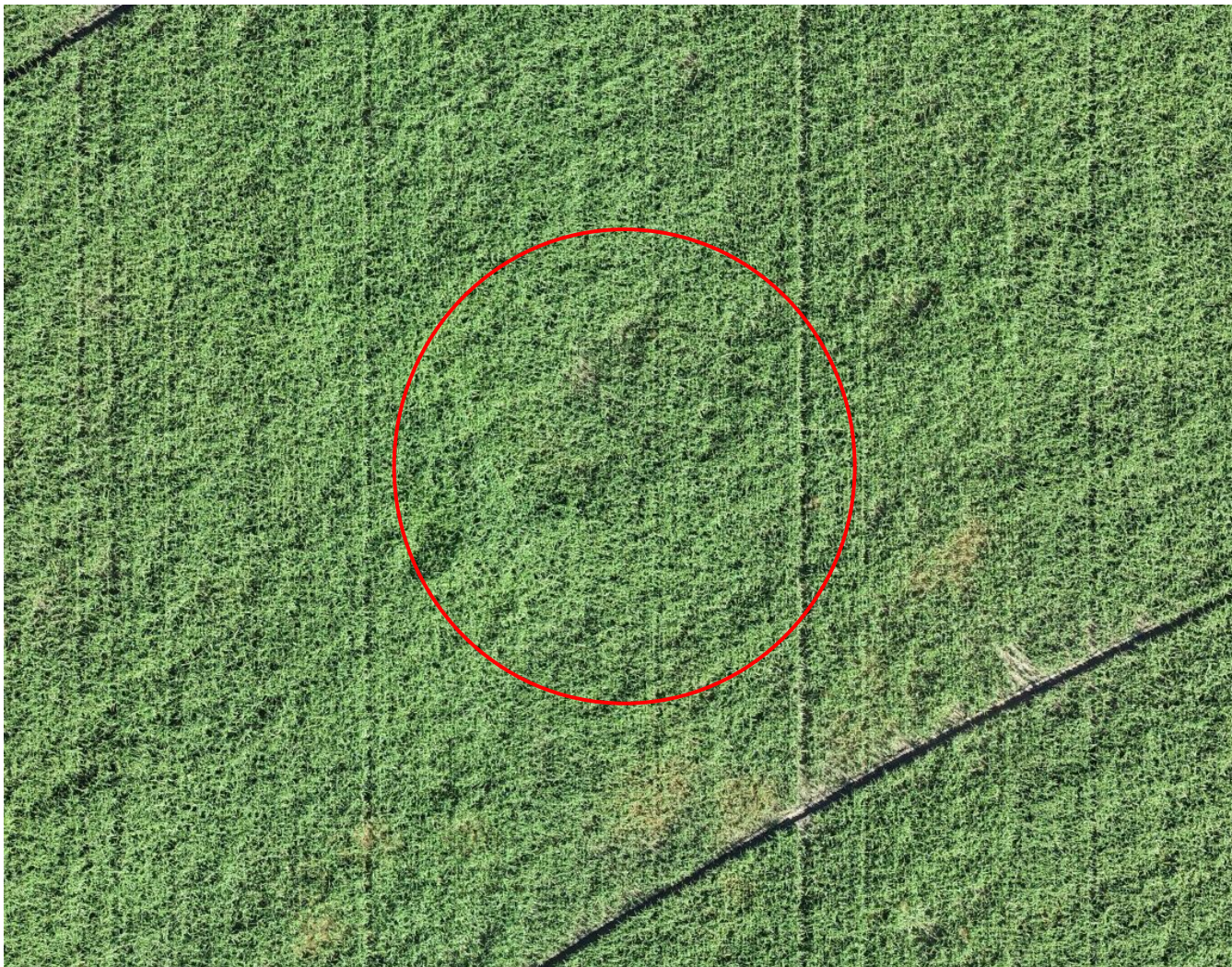
Photo 4. Zoomed in Orthomosaic taken from 200 ft (Oct. 2022). Illustrates mature crop growth on and around the well location (red circle) that is similar or better than surrounding crop.