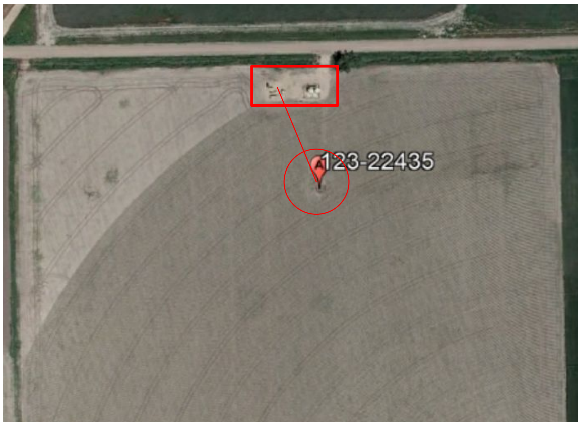
Photo 1. Google Earth aerial imagery taken 7/2019 during active operations. Photo illustrates the well location (red circle), tank battery (red rectangle), and approximate flowlines (red line).