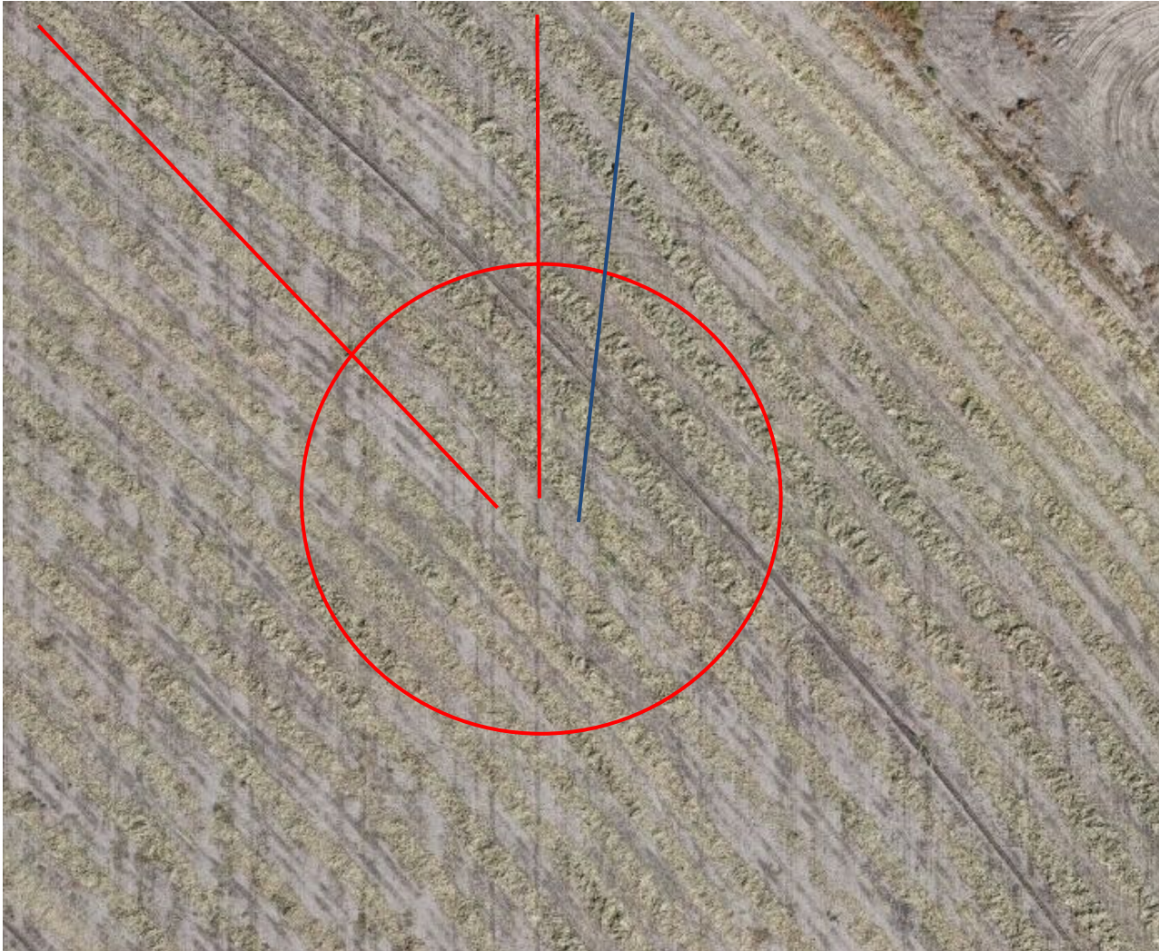
Photo 4. Zoomed in Orthomosaic taken from 200 ft (Oct. 2022). Illustrates harvested crop on and around the well location (red circle), flowlines (red lines), and access road (blue lines). Appears similar to rest of area, however crop height cannot be fully evaluated. Another inspection is required when crop is actively growing.