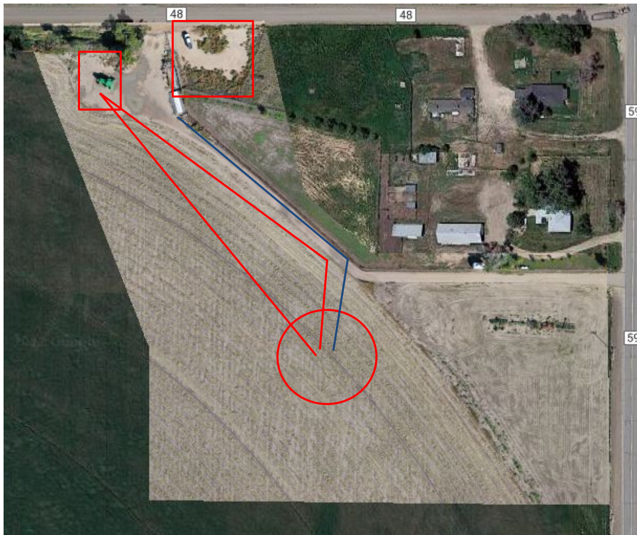
Photo 3. Orthomosaic drone aerial imagery taken from 200 ft (Oct. 2022). Illustrates harvested crop on and around the well location (red circle), flowlines (red lines), tank battery (red rectangle) and access road (in field).