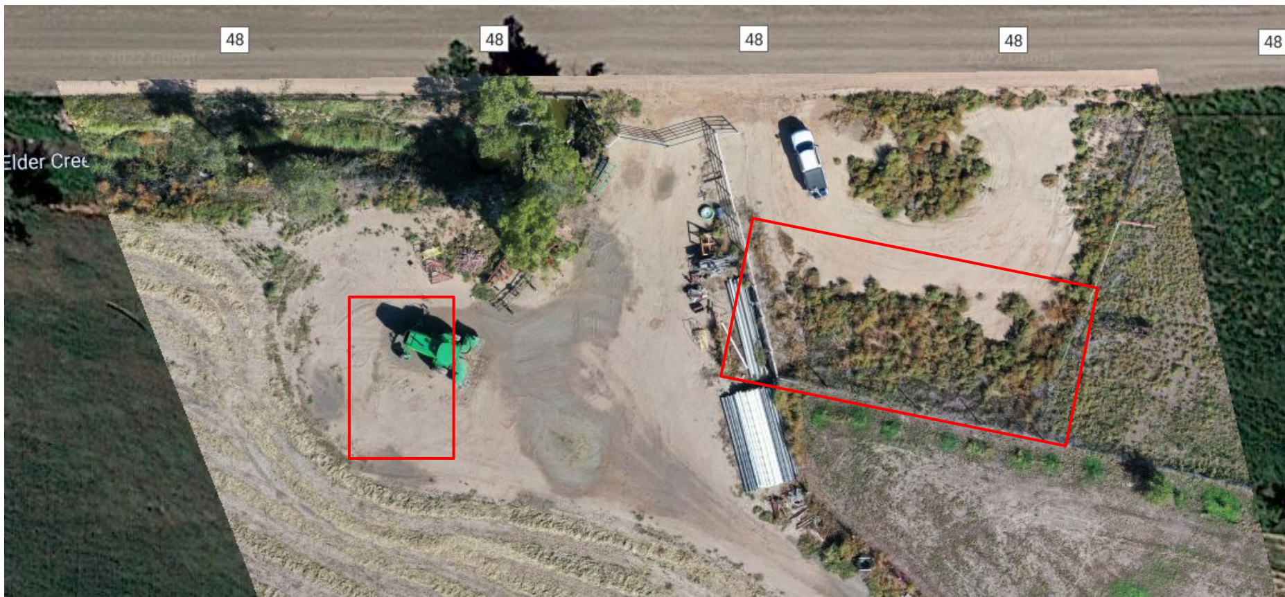
Photo 5. Zoomed in Orthomosaic taken from 200 ft (Oct. 2022). Illustrates native growth on and around where the tank (red rectangle) was. The area around the compressor has no growth.