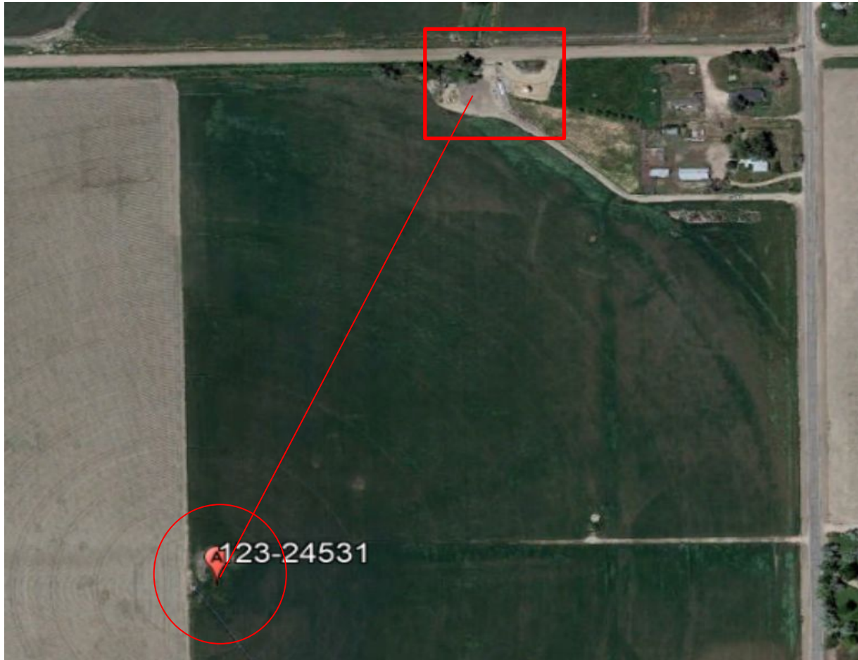
Photo 1. Google Earth aerial imagery taken 6/2016 during active operations. Photo illustrates the well location (red circle), tank battery (red rectangle), and approximate flowlines (red line).