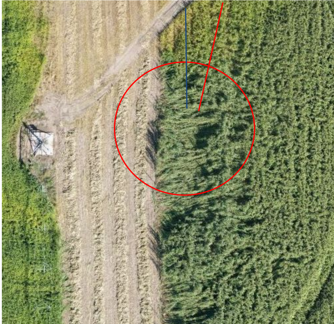
Photo 4. Zoomed in Orthomosaic taken from 200 ft (Oct. 2022). Illustrates mature crop growth on and around the well location (red circle).