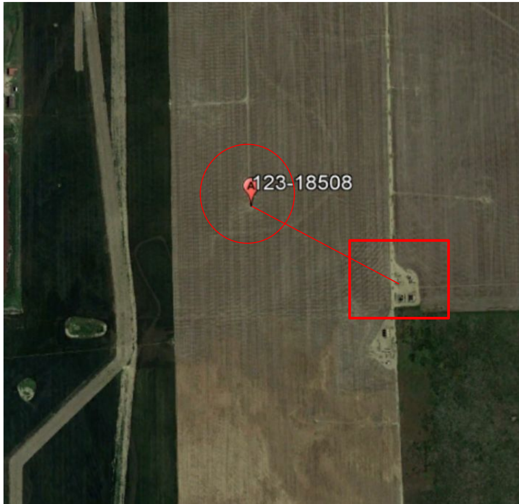
Photo 1. Google Earth aerial imagery taken 8/2018 during active operations. Photo illustrates the well location (red circle), tank battery (red rectangle), and approximate flowlines (red line).