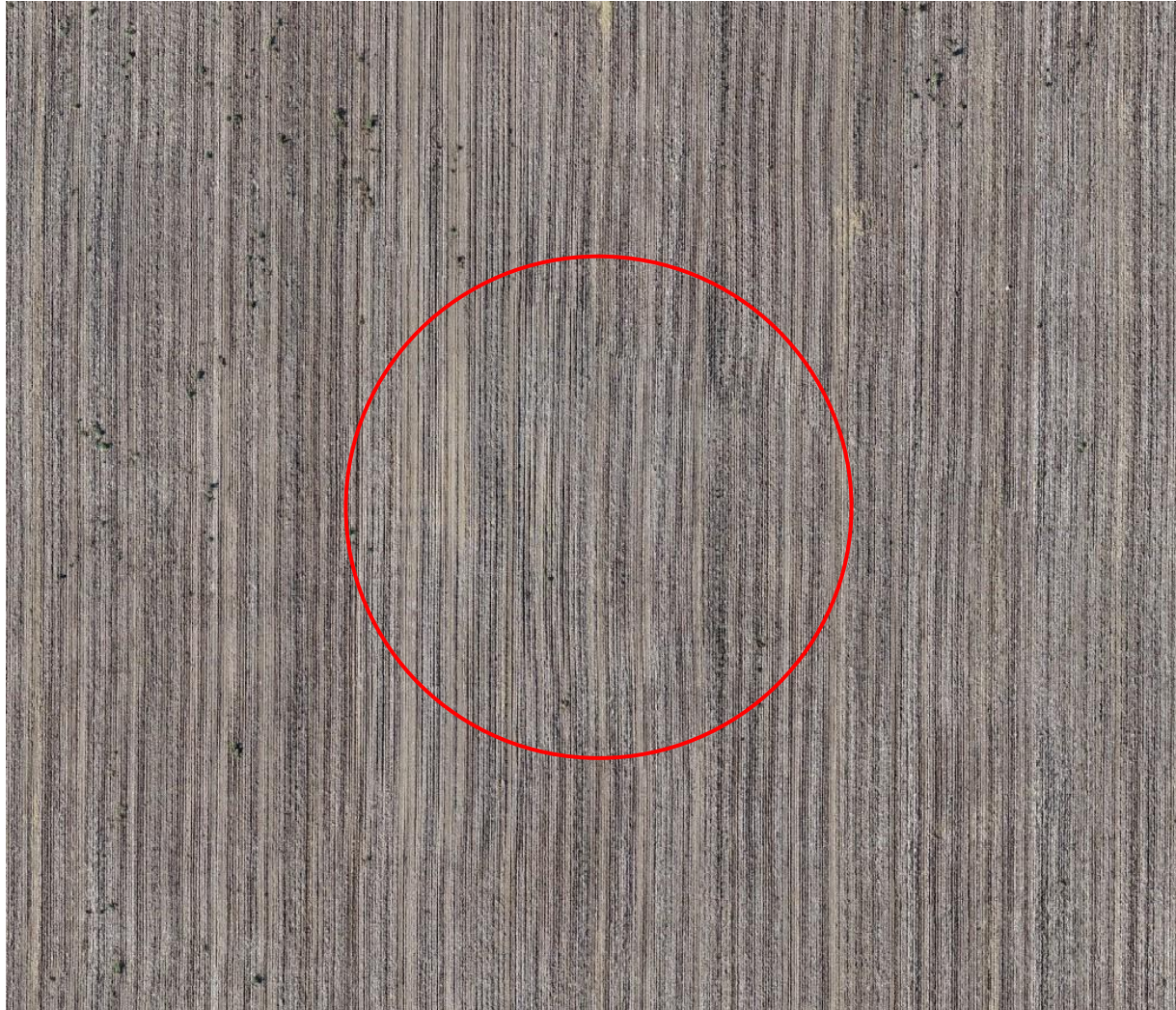
Photo 4. Zoomed in Orthomosaic drone aerial imagery taken from 200 ft (Sept. 2022). Photo illustrates growth on and around the well location (red circle). Appears similar to rest of area, however crop height cannot be fully evaluated. Another inspection is required when crop is actively growing.