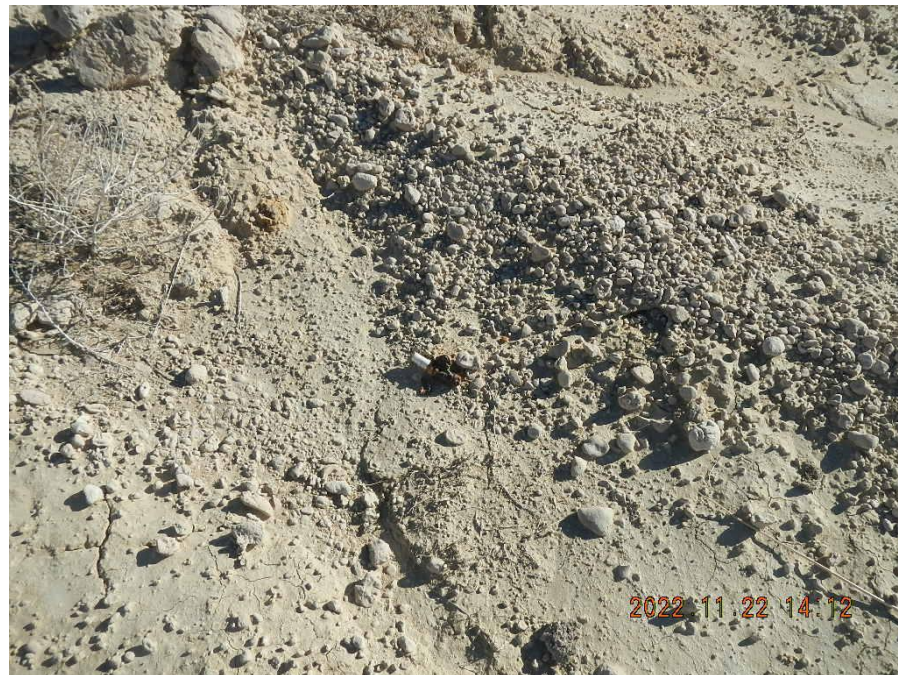
Photo 24. Trash/debris inside the pit.