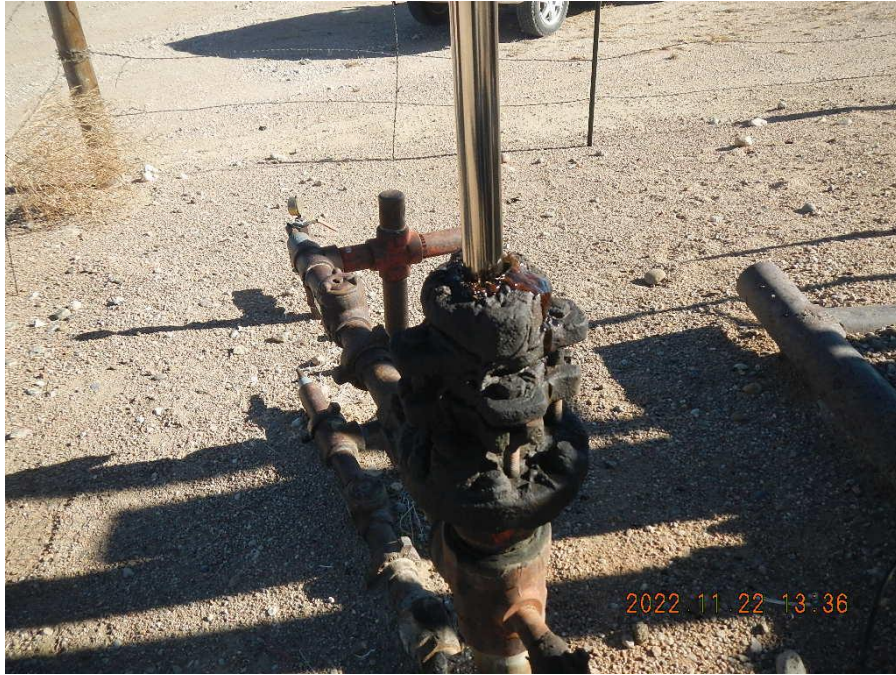
Photo 19. Paraffin and oil build up at stuffing box.