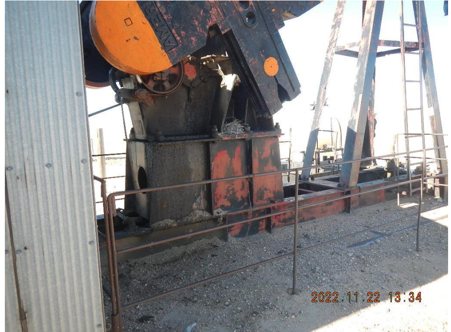
Photo 18. Bird nest on pumping unit.