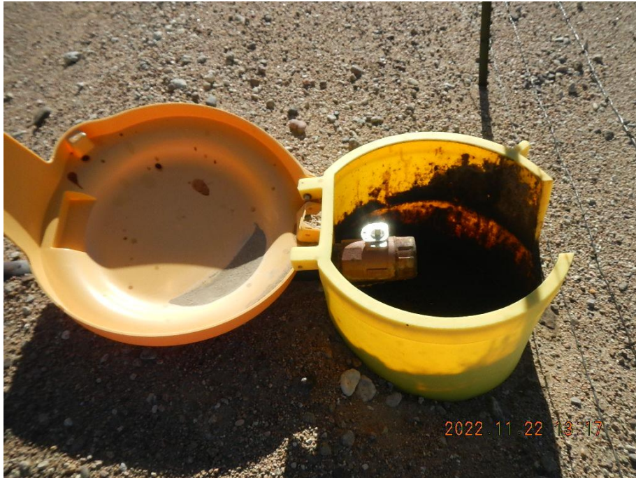
Photo 3. Loadout containment basin found open.