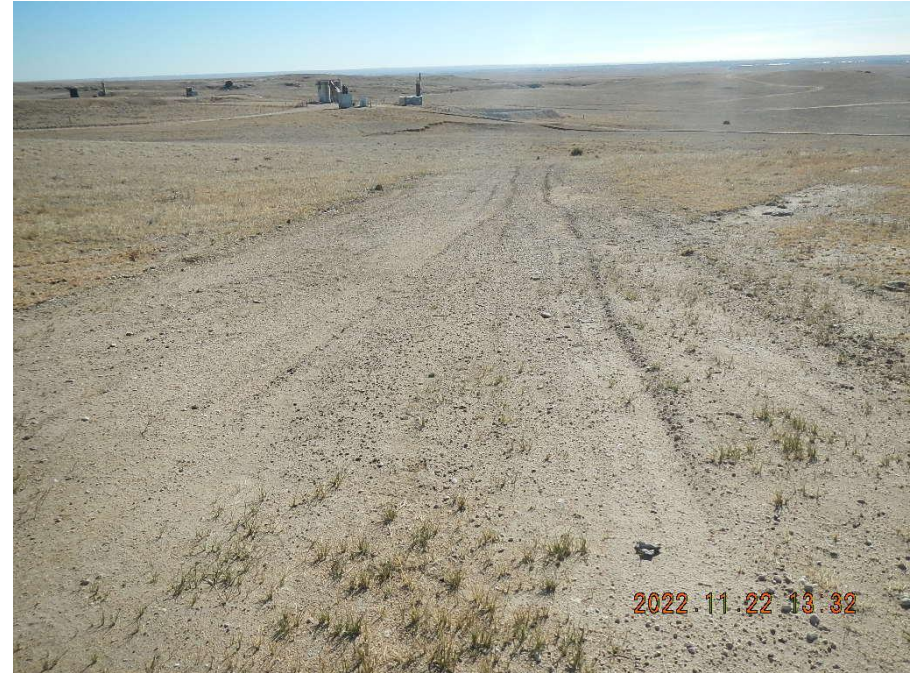
Photo 14. Surface disturbance south of separator approximately 150+ feet in length by 20 feet in width.