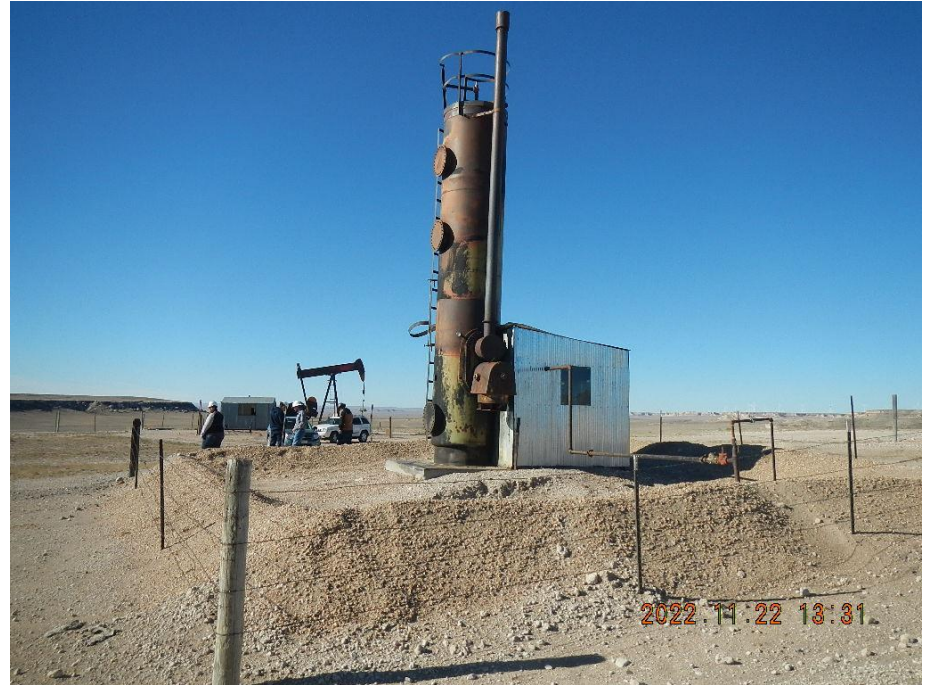
Photo 12. Vertical separator with apparent material removed on south side of concrete pad.