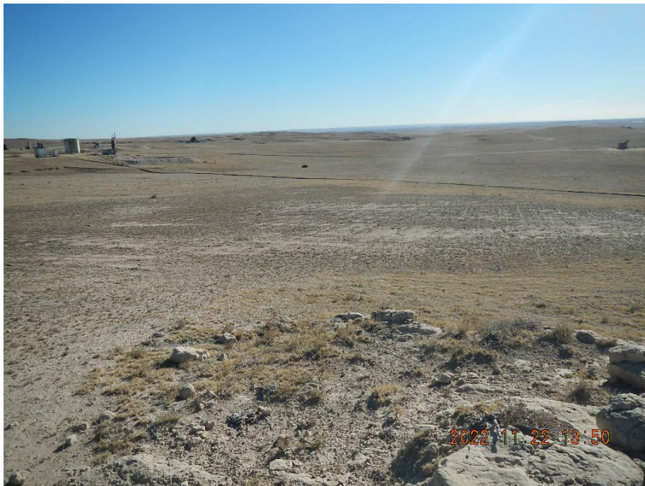
Photo 31. Stressed vegetation in center of photo.