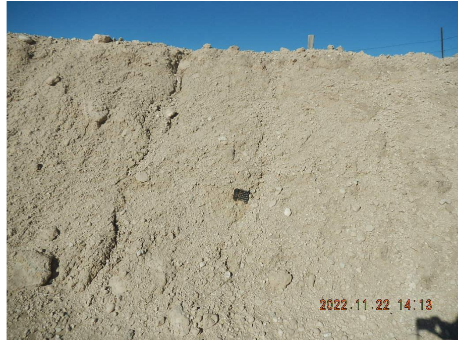
Photo 26. Trash/debris inside the pit along with stormwater run on into the pit.