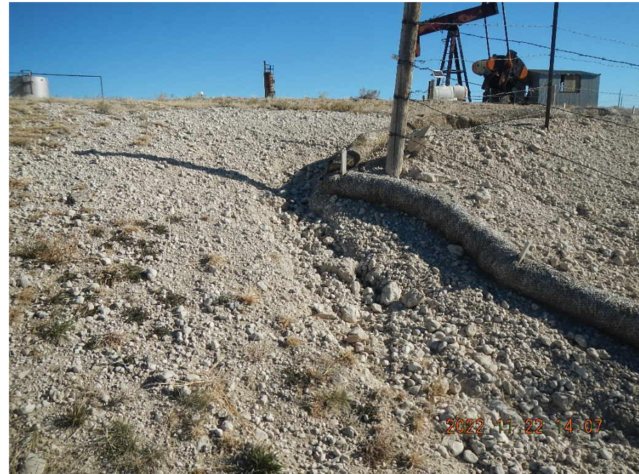
Photo 30. Erosion along the north side of the pit.