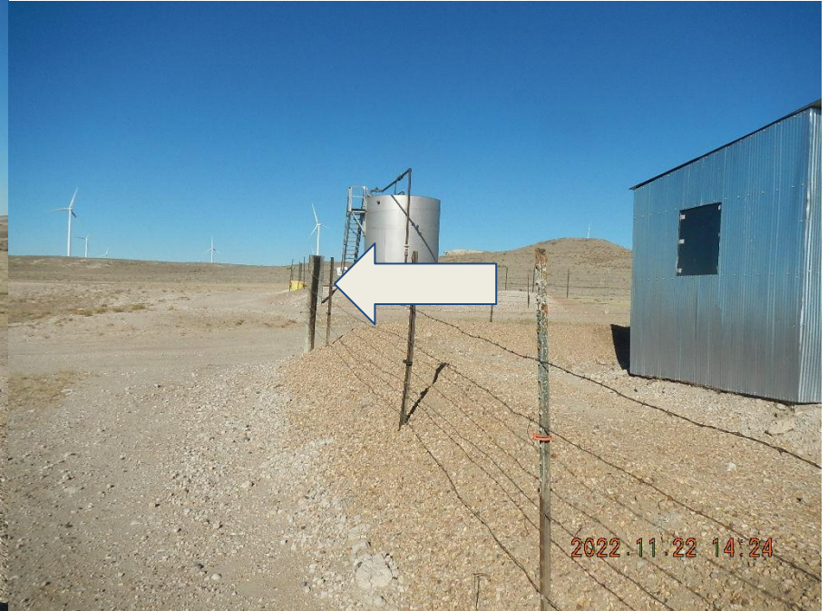
Photo 16. Charred fence posts from November 2019 fire (Insp Doc #680305948 ).