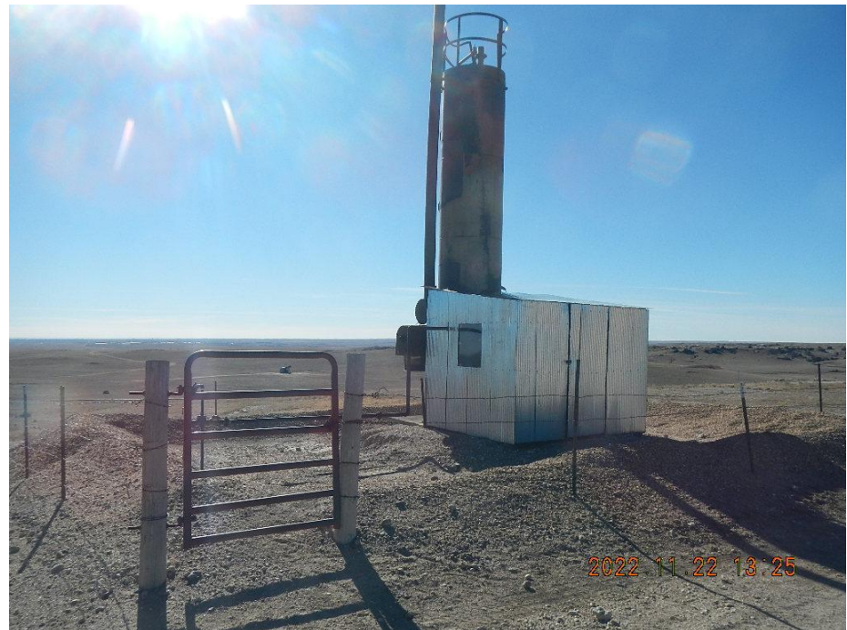
Photo 10. Vertical separator.