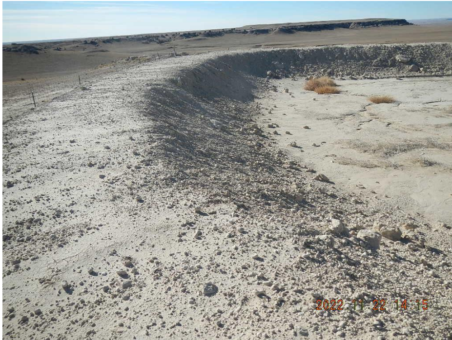
Photo 27. South side of pit looking west.