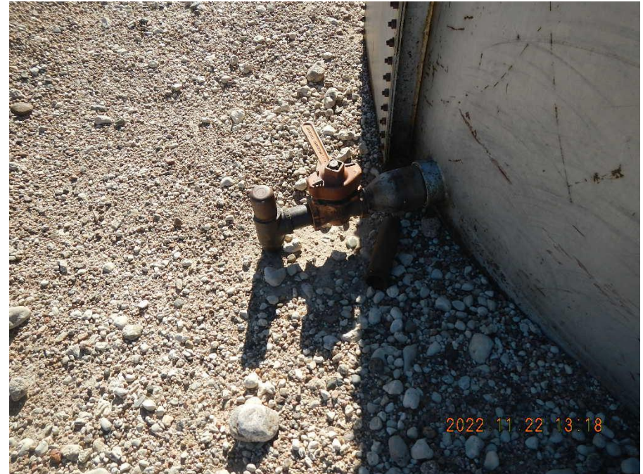
Photo 4. Valve in closed position with handle on valve. Note: evidence of livestock was observed in tank tank battery.