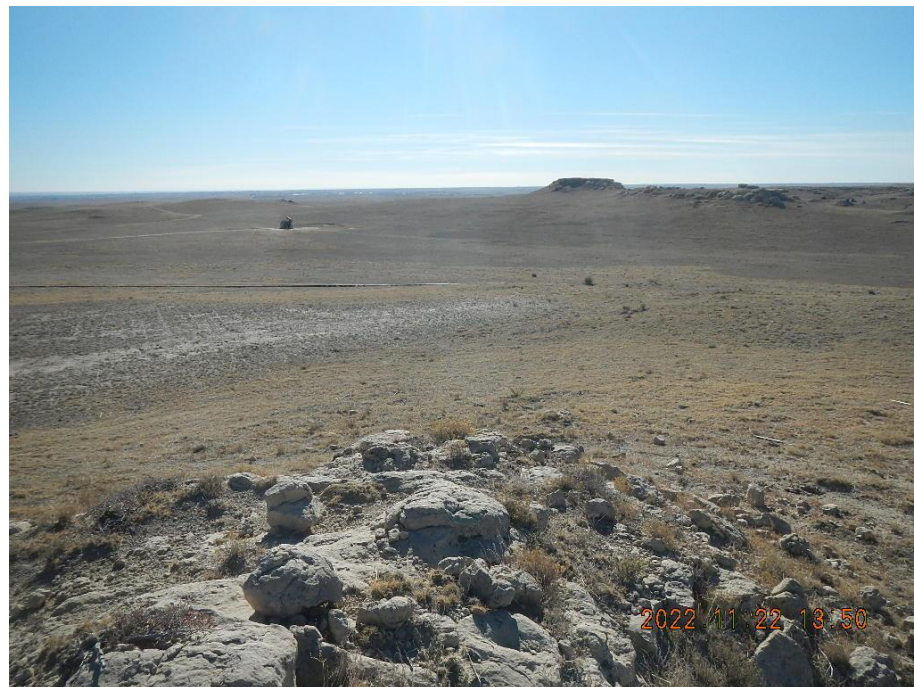
Photo 32. Stressed vegetation.