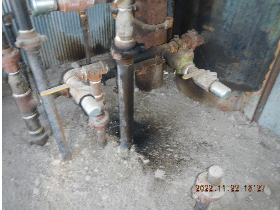
Photo 11. Hammer union weeping oil and oil staining on ground.