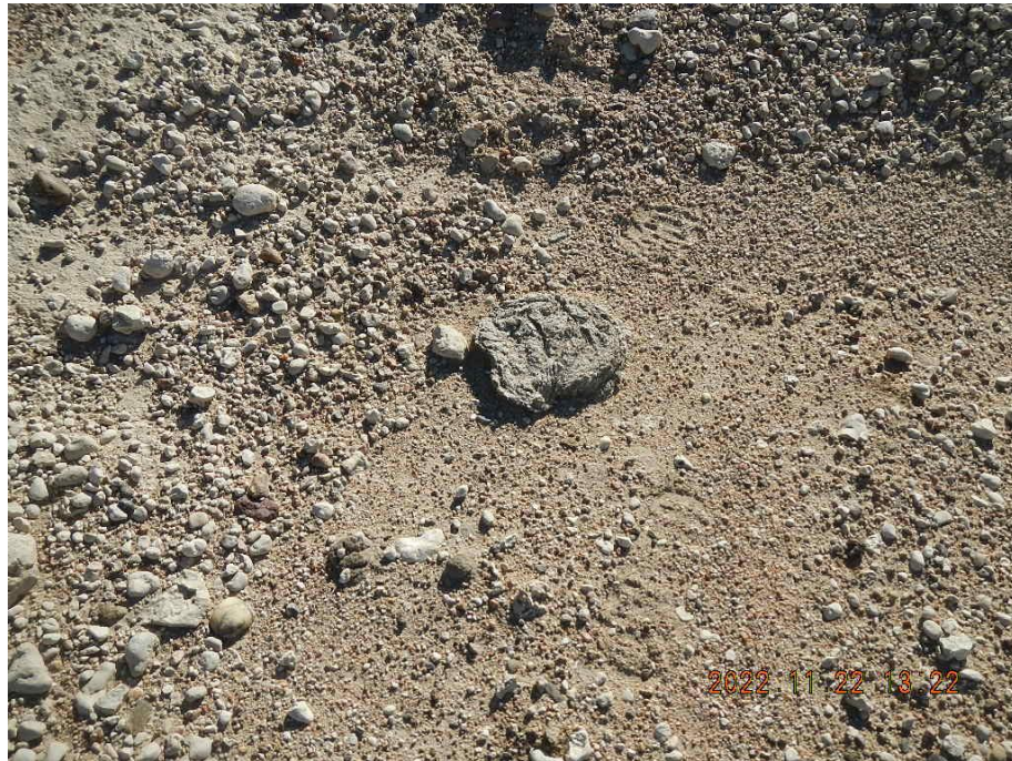
Photo 5. Evidence of livestock.