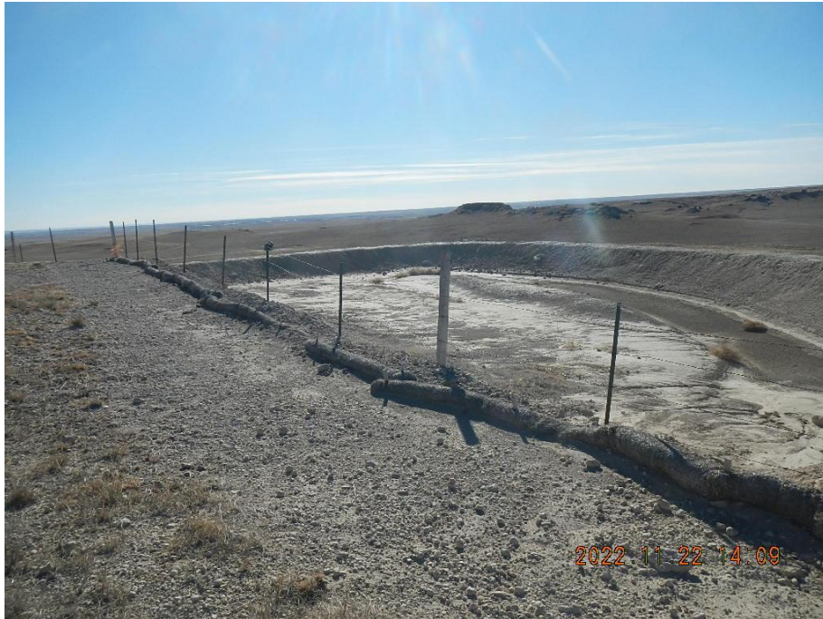
Photo 29. East side of pit looking south. Signs of run on into the pit with inadequate BMPs.