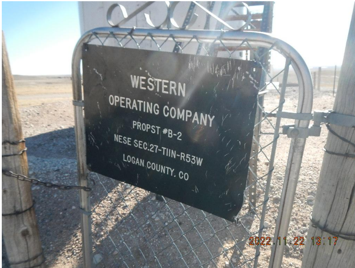
Photo 2. Sign at tank battery.