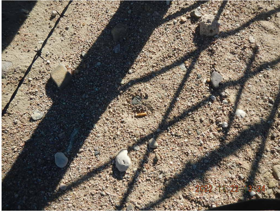
Photo 17. Trash/debris (cigarette butt) within well fence enclosure.