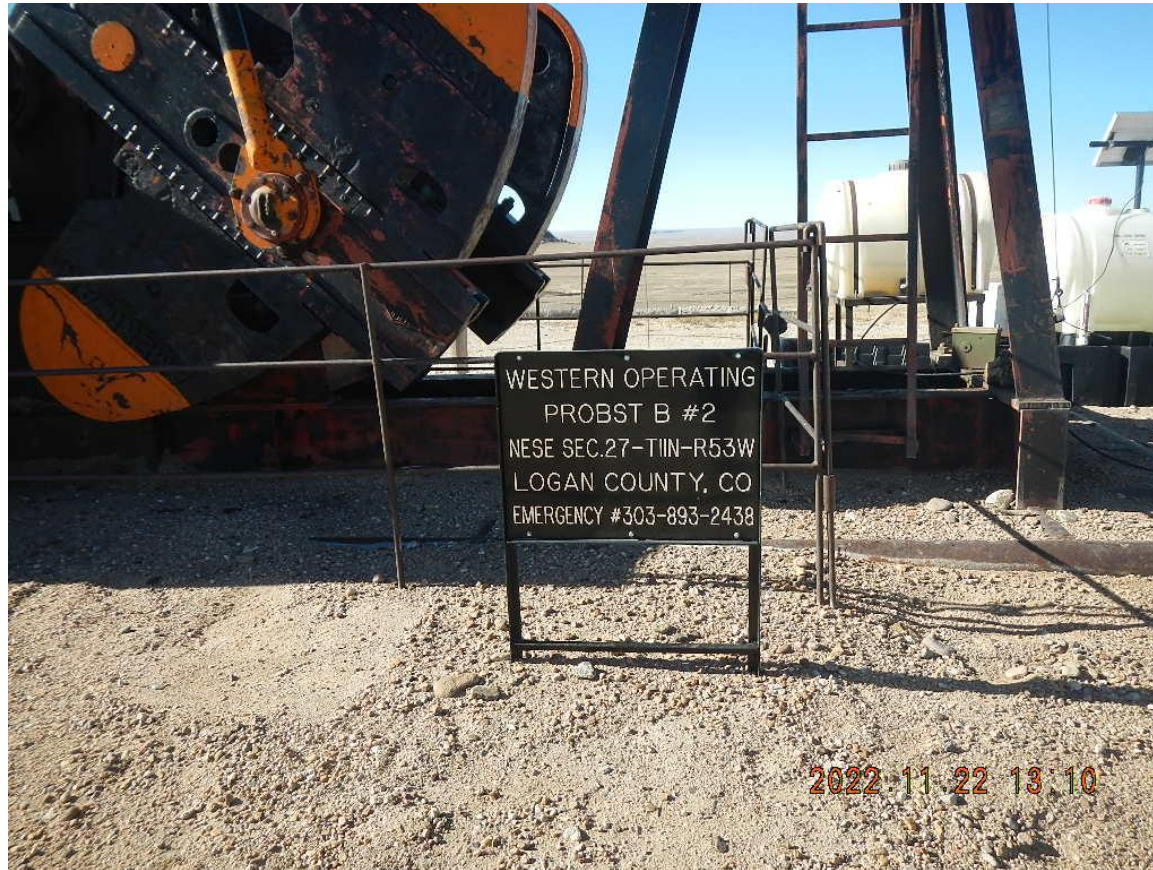
Photo 1. Sign at pumping unit.