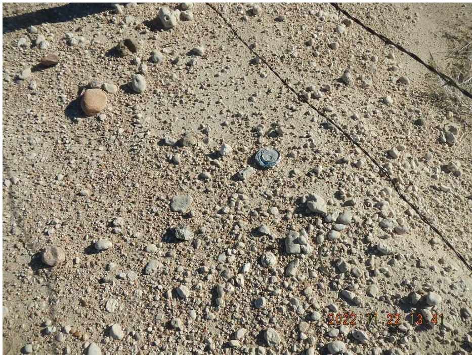
Photo 21. Trash near pit.