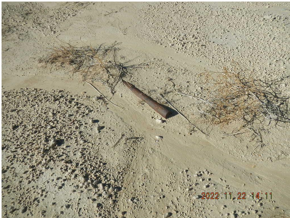
Photo 23. Trash/debris inside the pit.