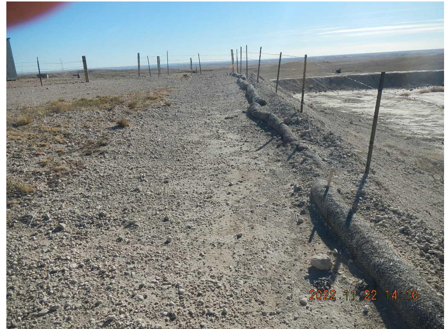
Photo 28. East side of pit looking south. Signs of run on into the pit with inadequate BMPs.