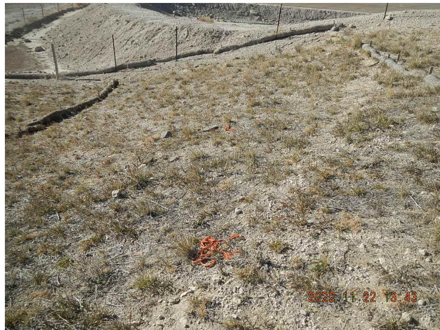
Photo 22. Trash near pit.