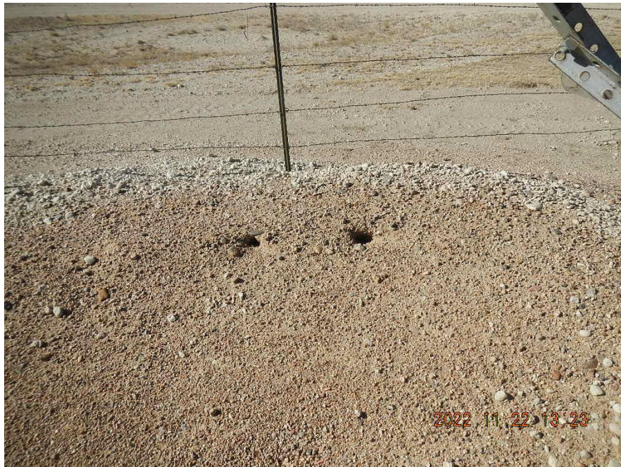
Photo 9. Burrows compromising secondary containment berm.