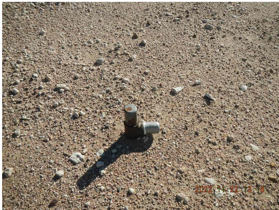
Photo 7. Un-marked riser at tank battery.