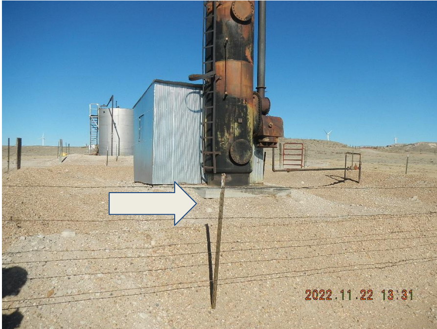
Photo 13. Vertical separator with apparent material removed on south side of concrete pad.