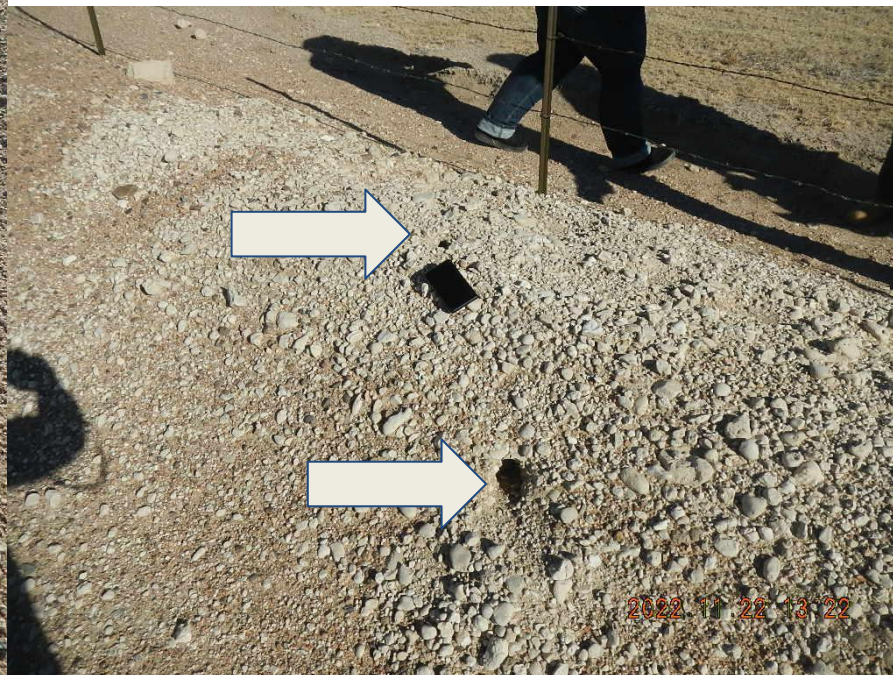
Photo 8. Burrows compromising secondary containment berm.