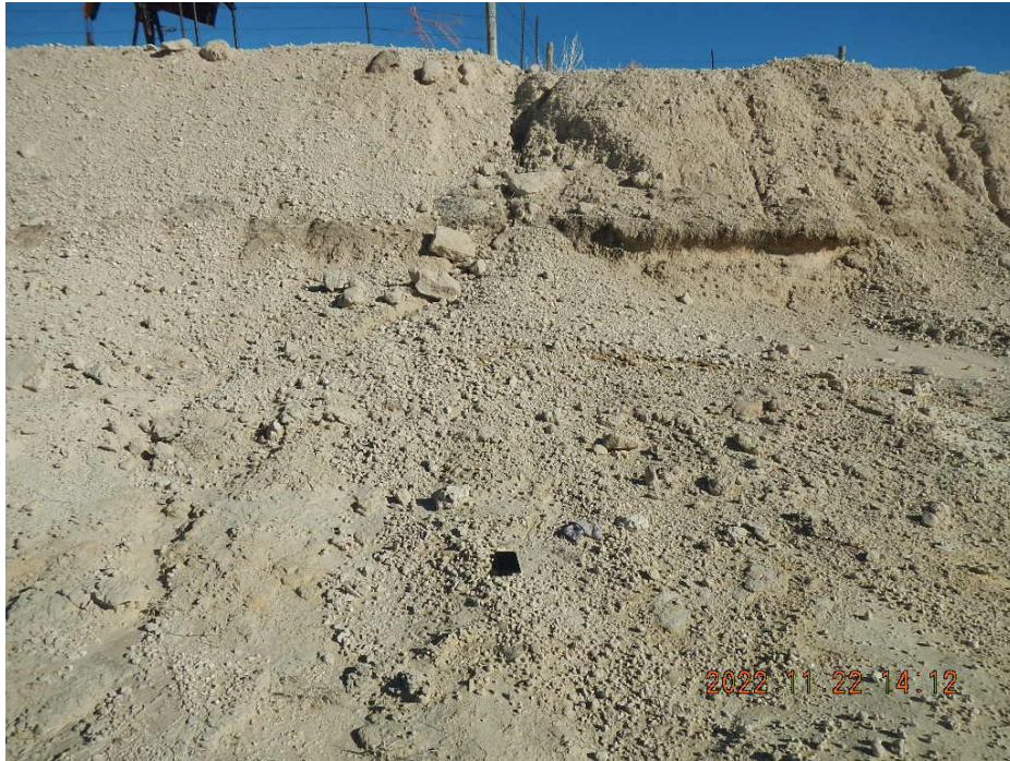
Photo 25. Signs of stormwater run on into the pit.