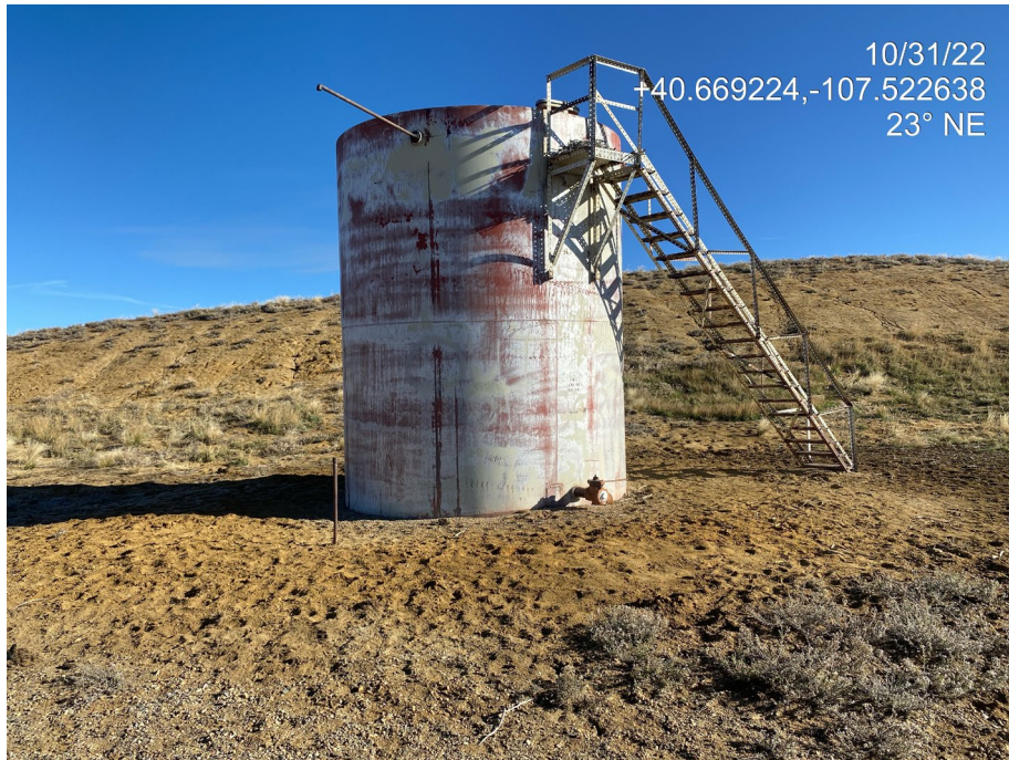
Photo 2. Photo shows a tank with no label and no secondary containment. Tank battery signage is absent. Tank is unused equipment.