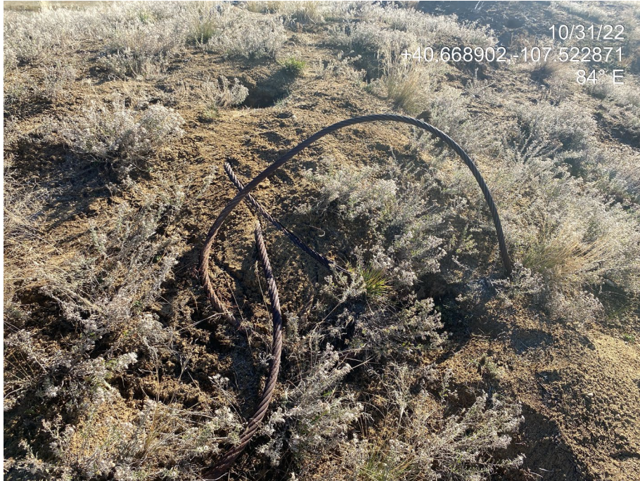
Photo 6. Photo shows trash (metal cable) present in the fill slope.