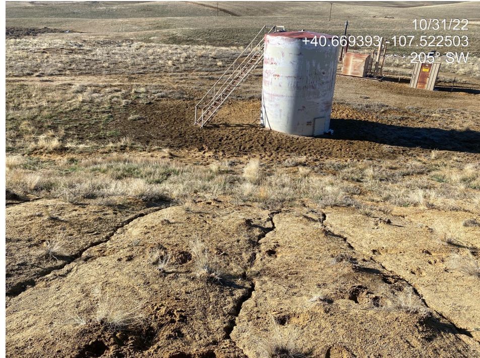
Photo 10. Photo shows rill erosion on the cut slope at the north of the Location. Erosion is occurring in areas which are largely unvegetated.