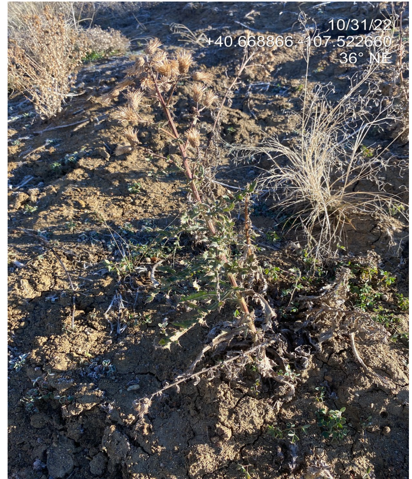
Photo 12. Photo shows Canada thistle (List B Noxious) on the pad surface. Canada thistle was also common on the fill slope.