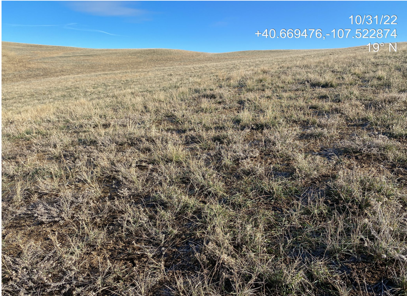
Photo 13. Photo shows reference areas to the north of the Location are densely vegetated and stabilized with perennial grasses.