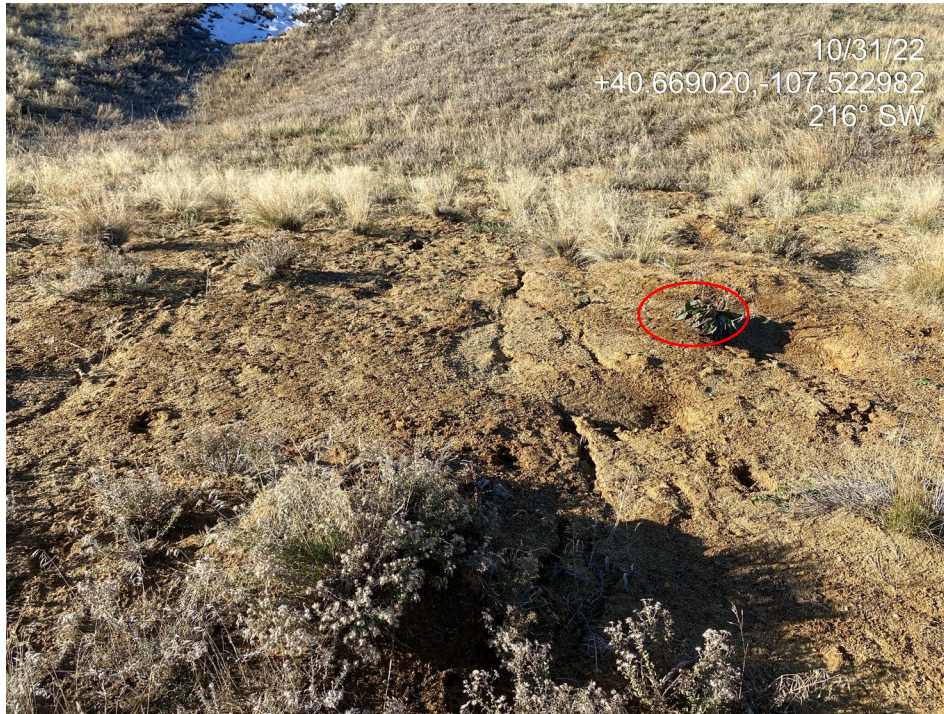
Photo 11. Photo shows rill erosion occurring on bare areas of the cut slope. Red circle indicates houndstongue (List B Noxious).