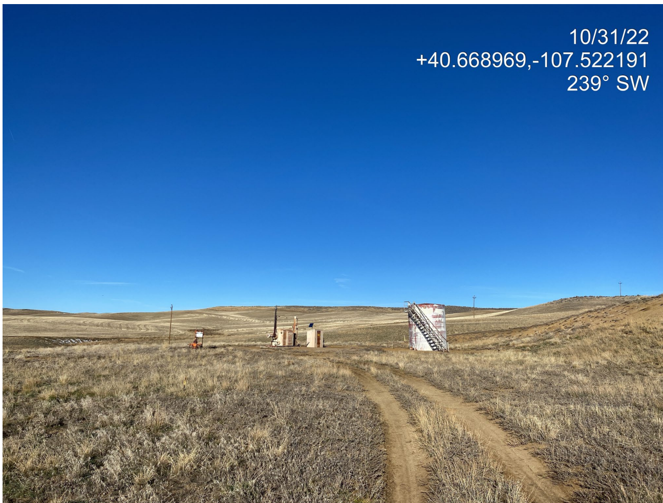
Photo 1. Photo taken from the east shows an overview of the Location.