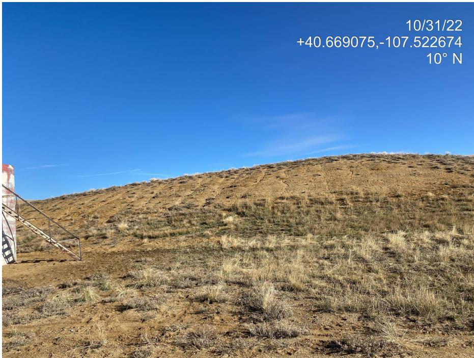
Photo 9. Photo shows an overview of the eroding cut slope at the north of the Location. Note, the base of the cut slope is vegetated and stable. Erosion is occurring in largely unvegetated areas.