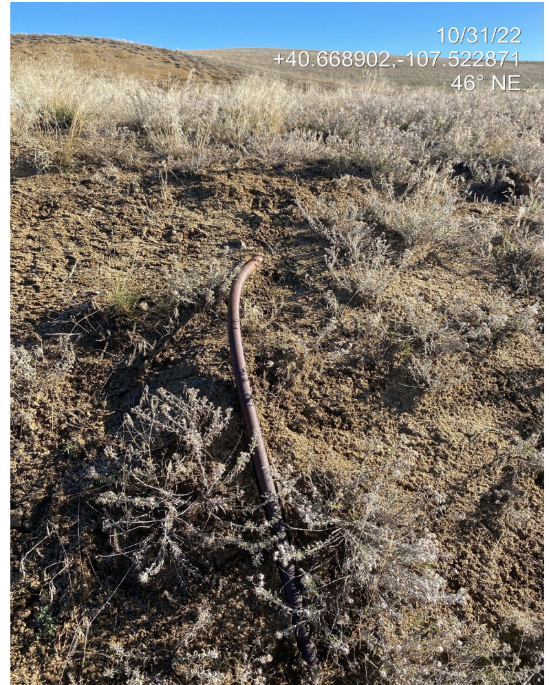
Photo 7. Photo shows trash (metal pipe) present in the fill slope.