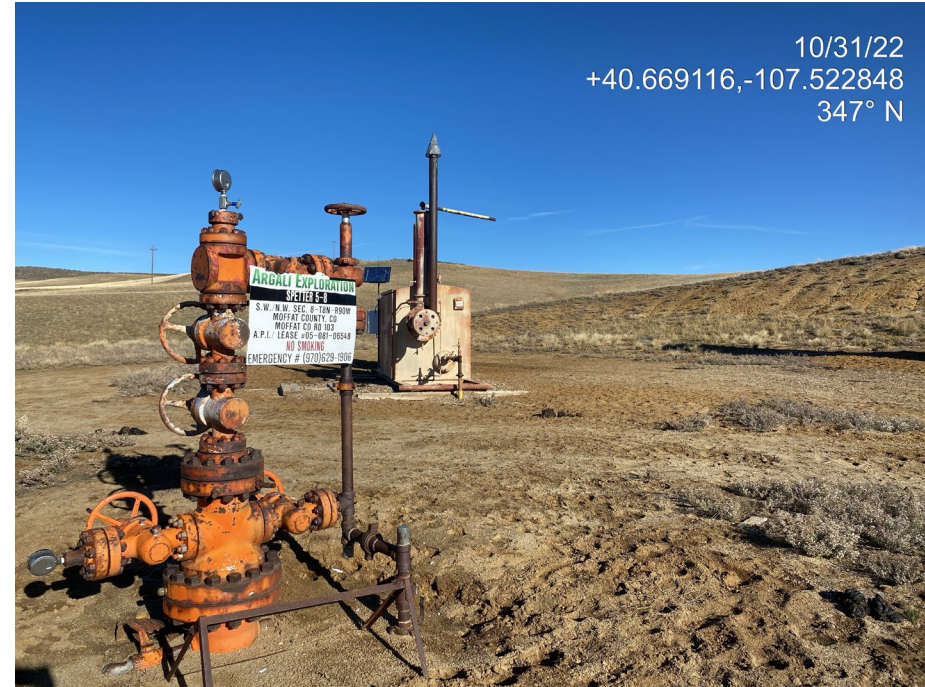
Photo 3. Photo shows production equipment. The wellhead sign does not comply with Rule 605.d(2).