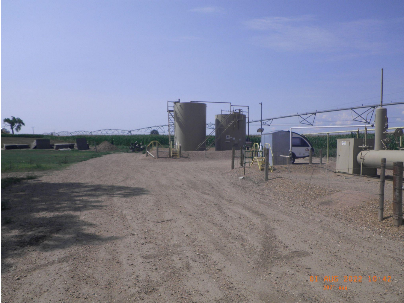
Photo 3. Overview photo of the tank battery that remains for the shut in Brown McCarty 30-43 well. No signs of erosion or stormwater issues observed.