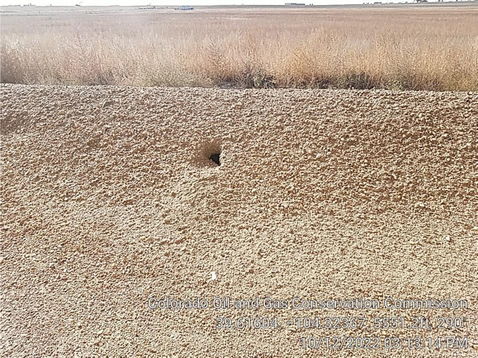
Animal hole in crude oil tank berms.

Colorado Oil and Gas Conservation Commission 39.61604, -104.32367, 5551.2ft, 290° 10/12/2022 03:13:14 PM