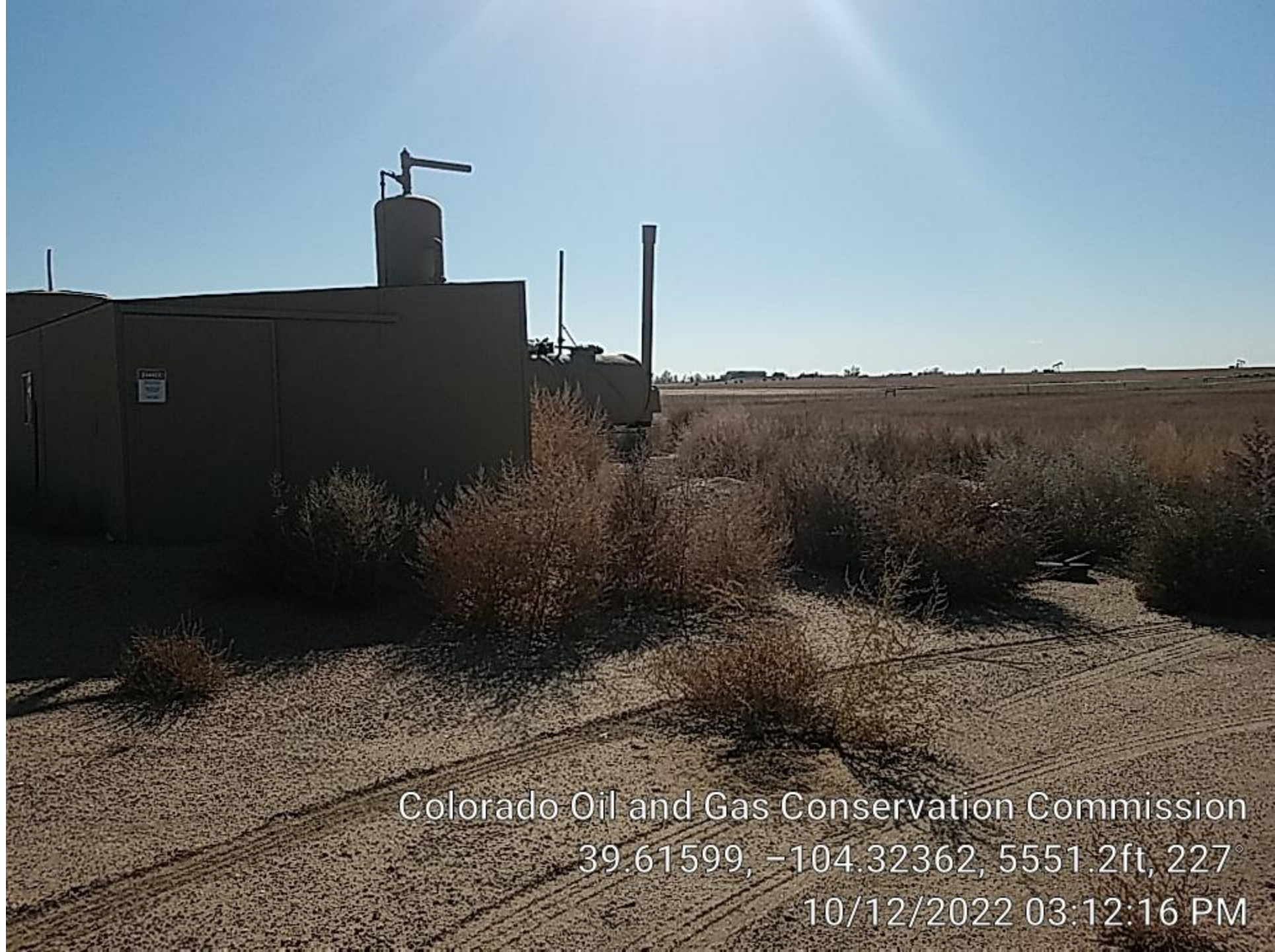
Separator and shed control weeds.

Colorado Oil and Gas Conservation Commission 39.61599, -104.32362, 5551.2ft, 227° 10/12/2022 03:12:16 PM