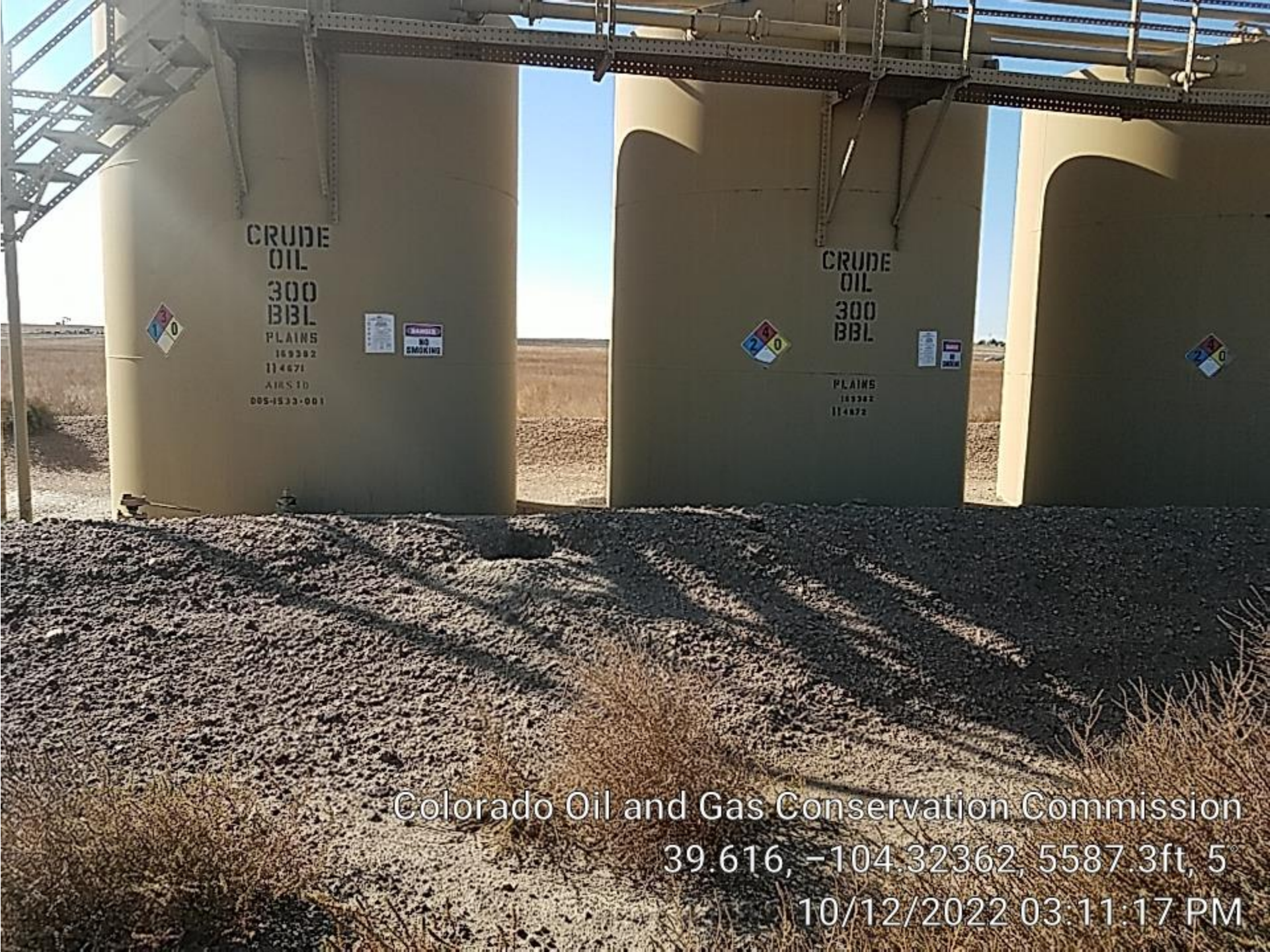
Animal hole in tank berms.

Colorado Oil and Gas Conservation Commission 39.616, -104.32362, 5587.3ft, 5° 10/12/2022 03:11:17 PM