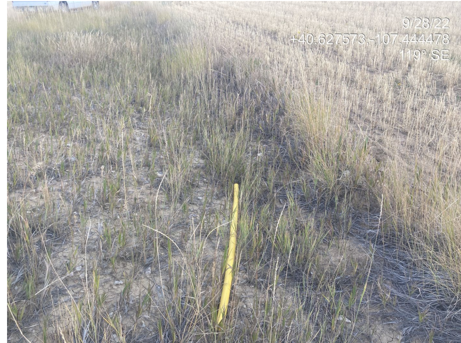
Photo 5. Photo shows an anchor marker in disrepair at the south of the Location.