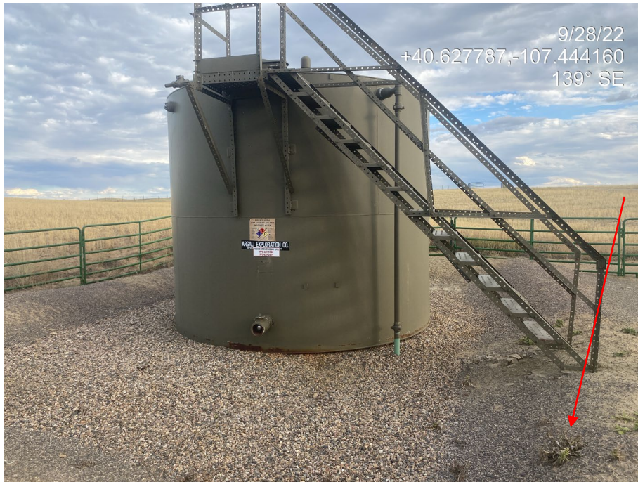
Photo 4. Photo shows production equipment. The plants at the right of the photo are Canada thistle (List B Noxious).