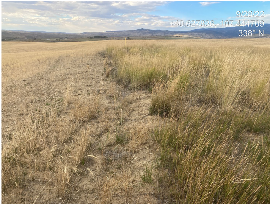
Photo 6. Photo taken from the northwest of the Location shows areas seeded with perennial grasses and adjacent cultivated cropland.