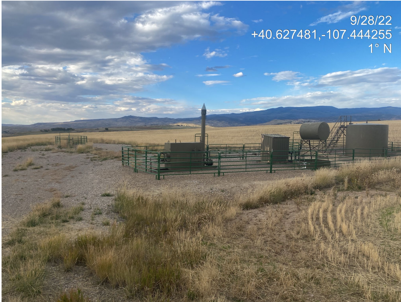
Photo 1. Photo taken from the south shows an overview of the Location.