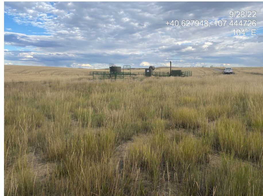
Photo 7. Photo shows areas at the north of the Location seeded with perennial grasses.