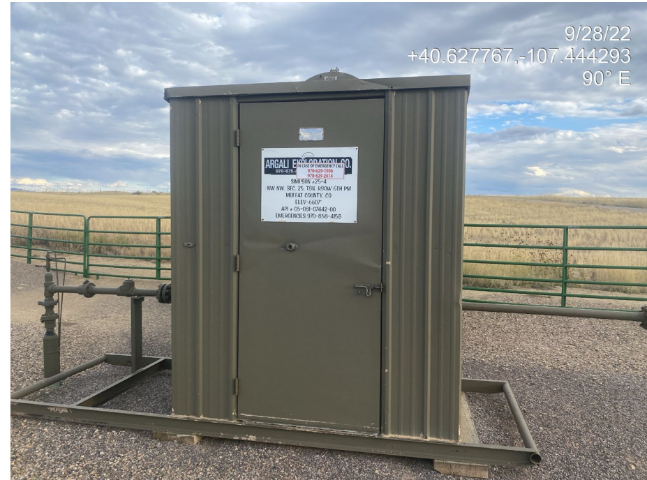
Photo 3. Photo shows production equipment.