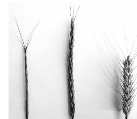
Jointed goatgrass (left), hybrid (middle), winter wheat (right)