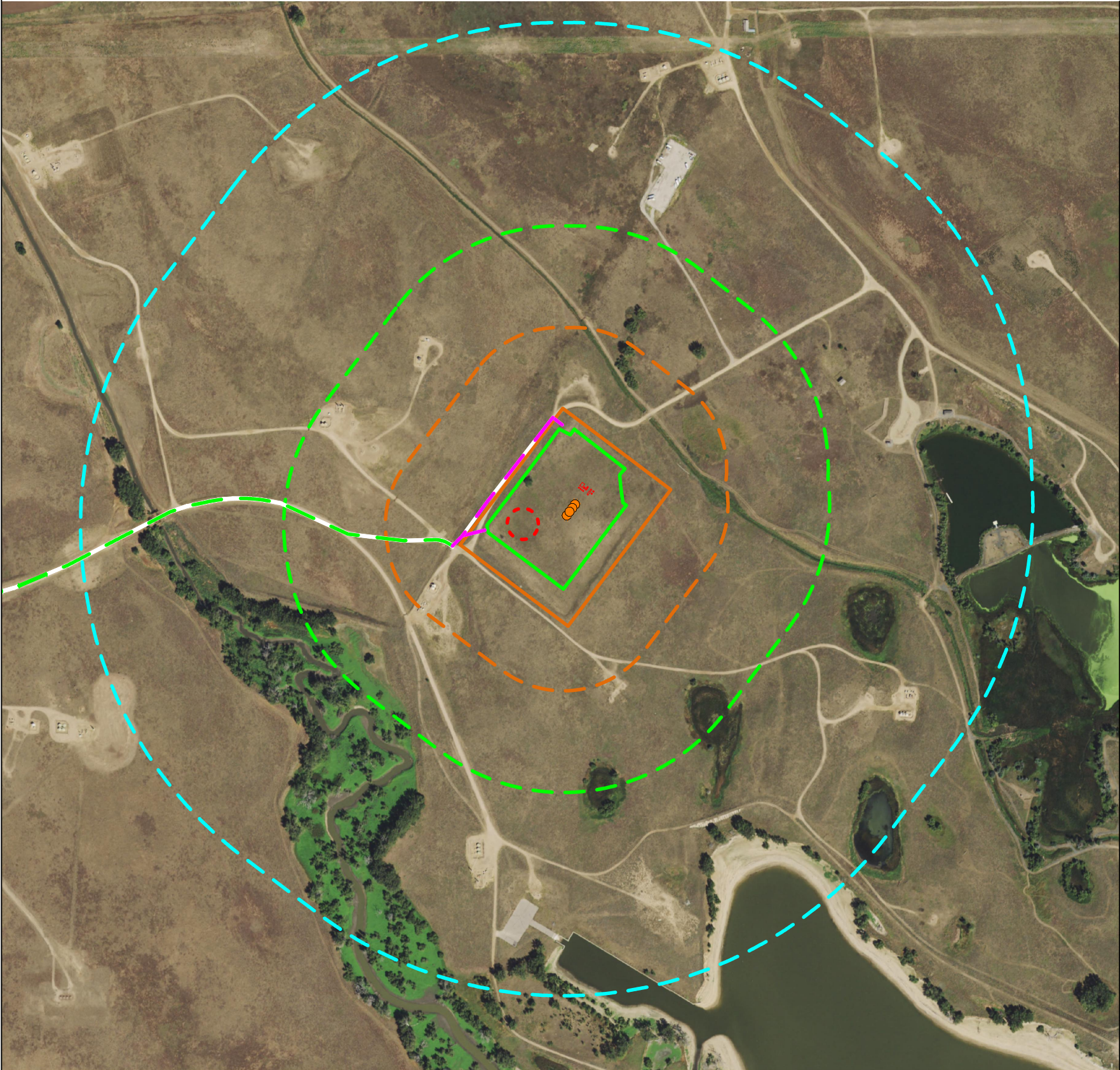
CULTURAL TABLE: (NUMBER OF FEATURES FOUND WITHIN EACH RADIUS AS MEASURED FROM THE WORKING PAD SURFACE)