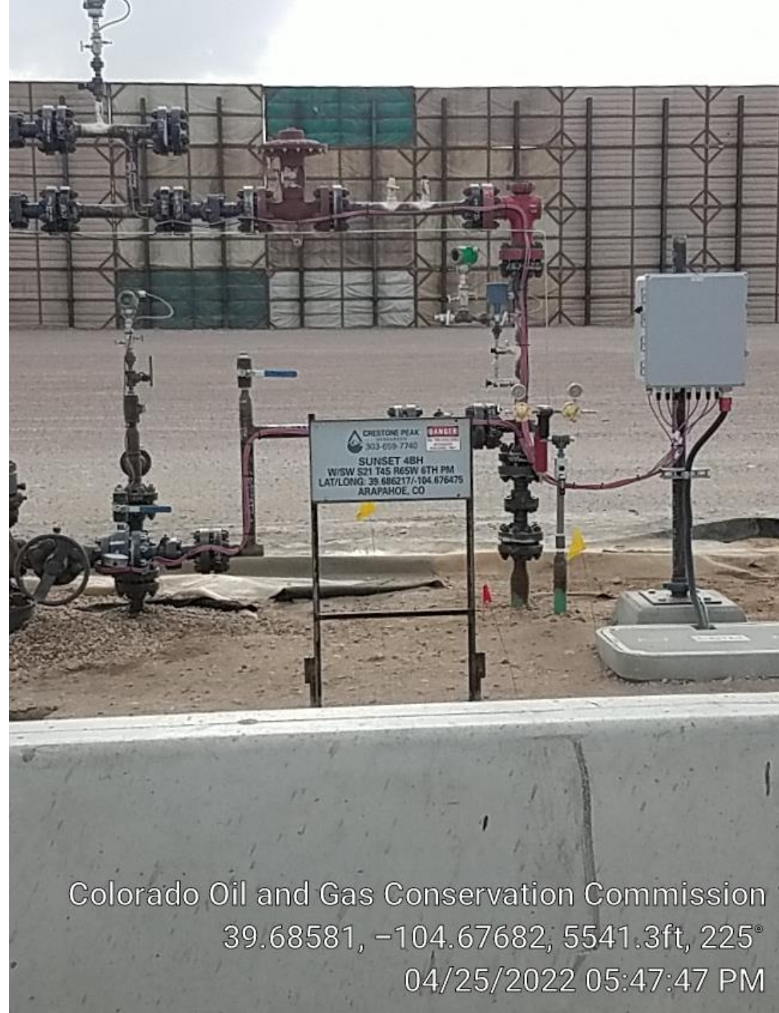
Colorado Oil and Gas Conservation Commission 39.68581, -104.67682, 5541.3ft, 225° 04/25/2022 05:47:47 PM