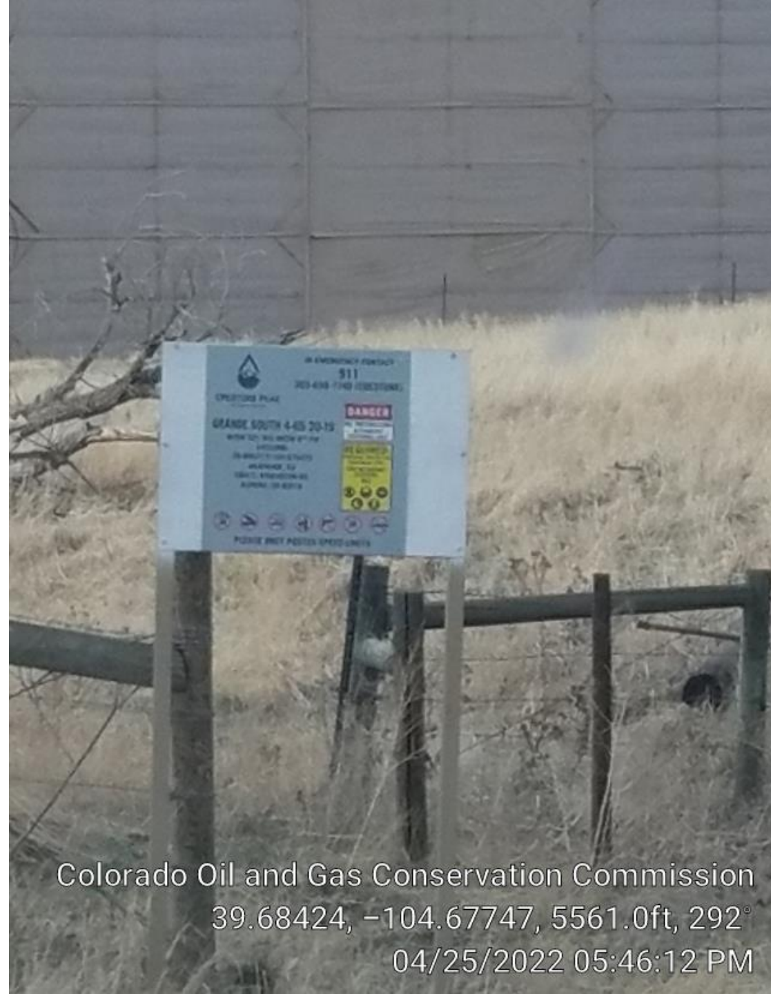
Colorado Oil and Gas Conservation Commission 39.68424, -104.67747, 5561.0ft, 292° 04/25/2022 05:46:12 PM