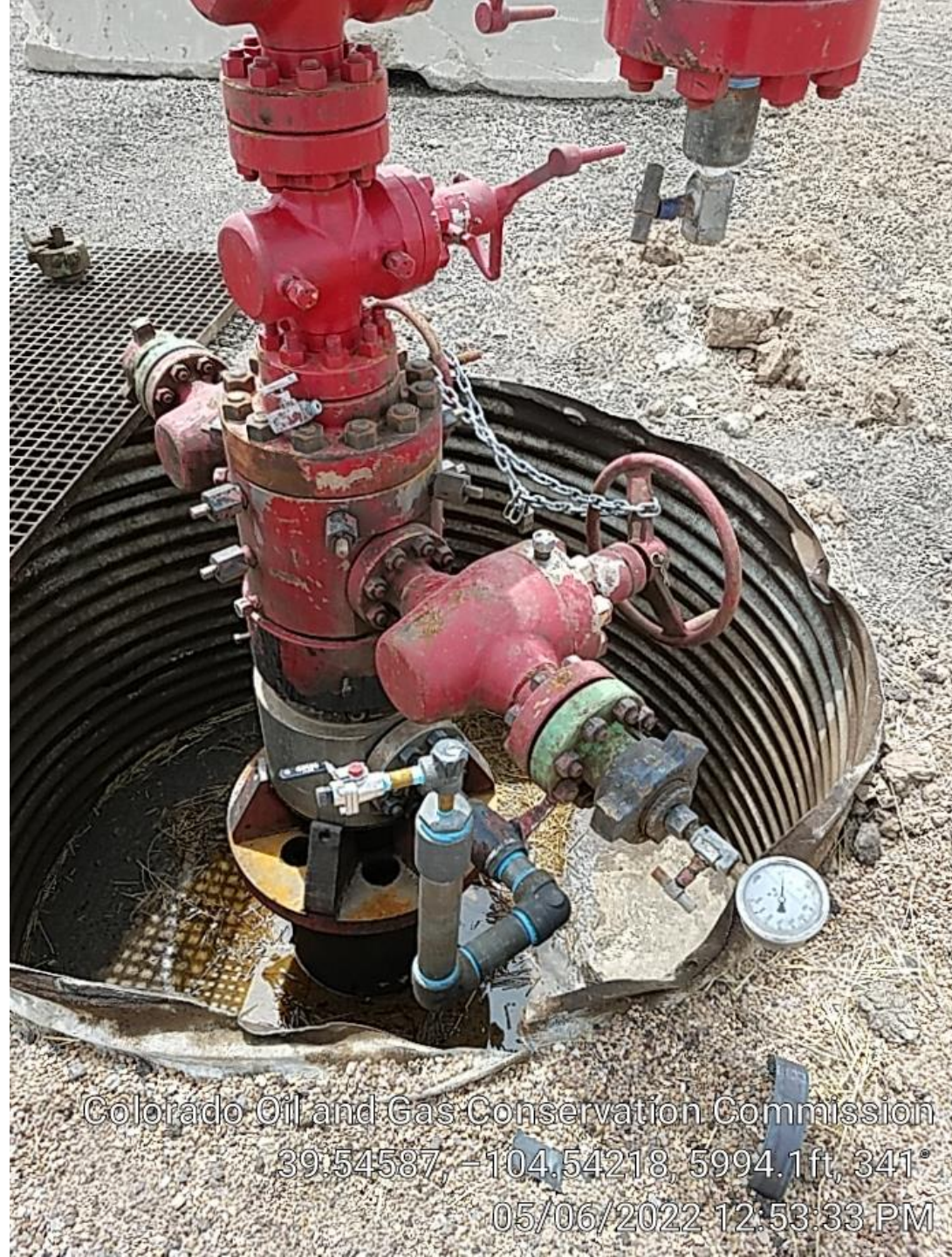
Bradenhead valve plumbed to surface.

Colorado Oil and Gas Conservation Commission 39.54587, -104.54218, 5994.1 ft, 341° 05/06/2022 12:53:33 PM