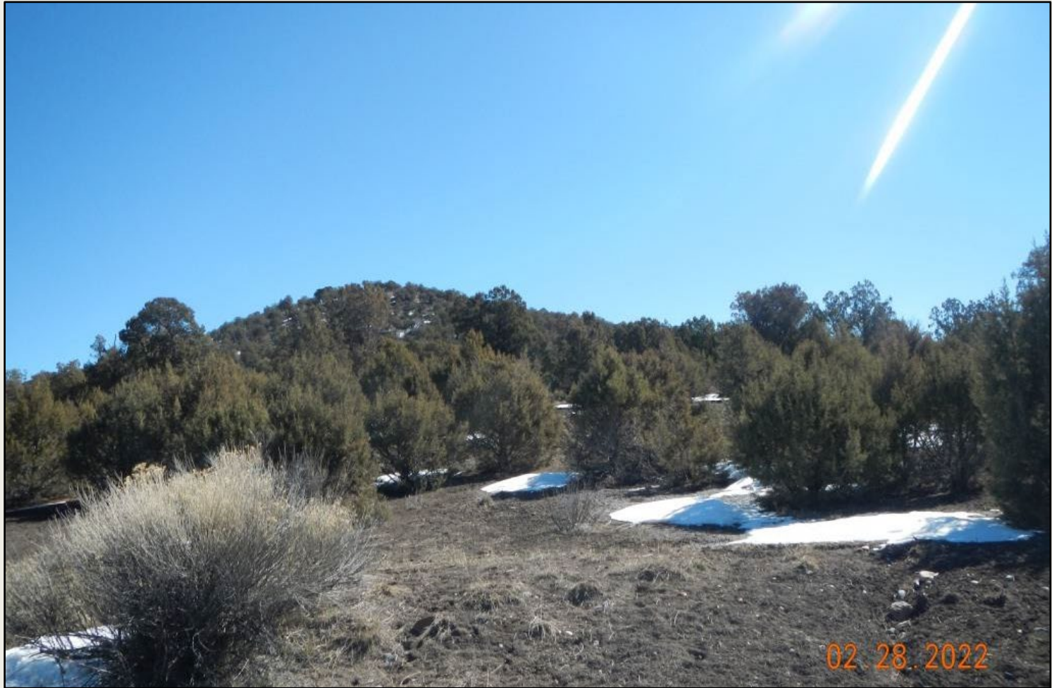
Photo 6. View of reference area comprised of pinyon and juniper woodland with sagebrush, blue grama, prickly pear, and snakeweed in the understory.