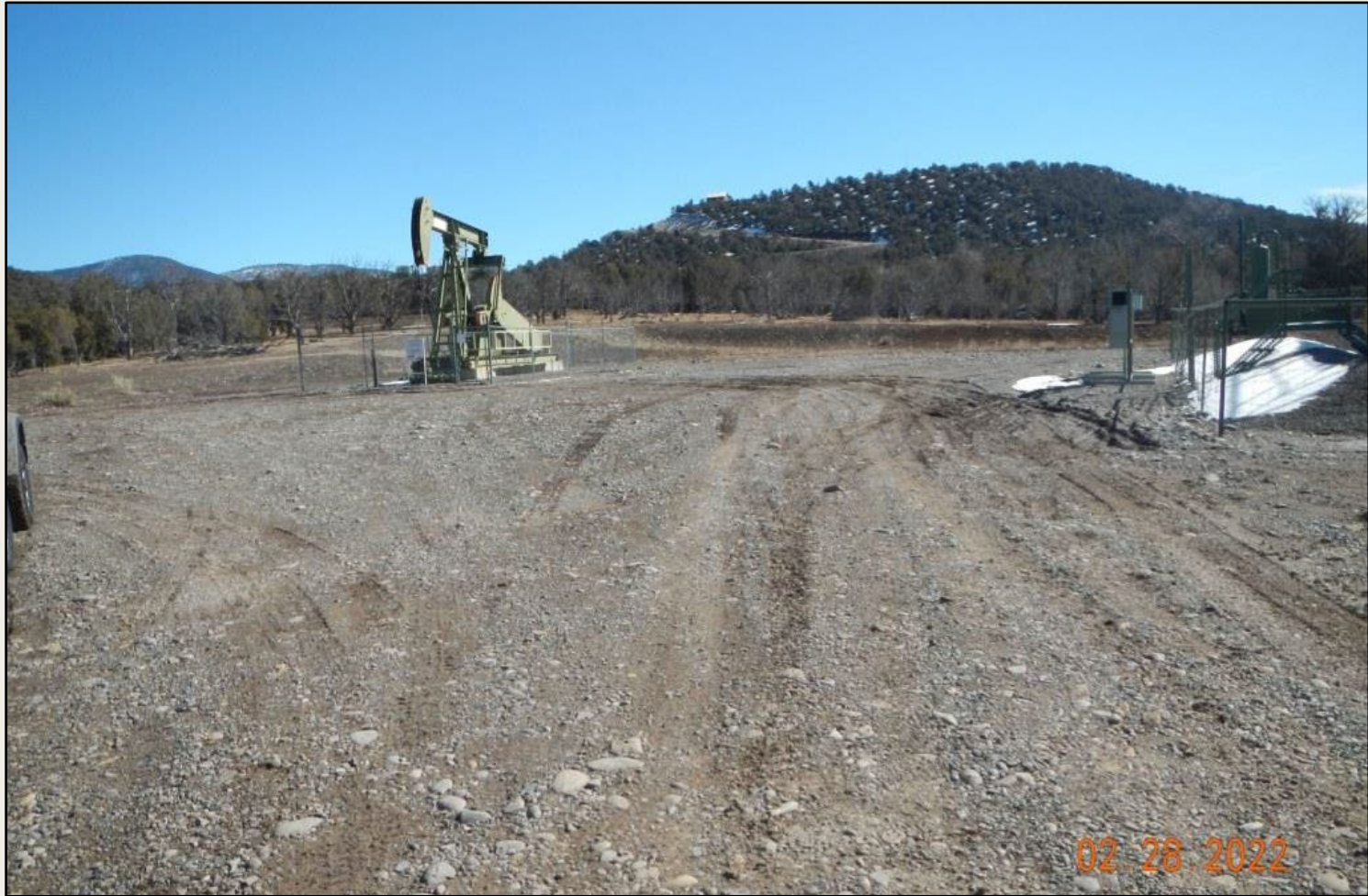
Photo 1. View of project area from the well pad entrance facing center.