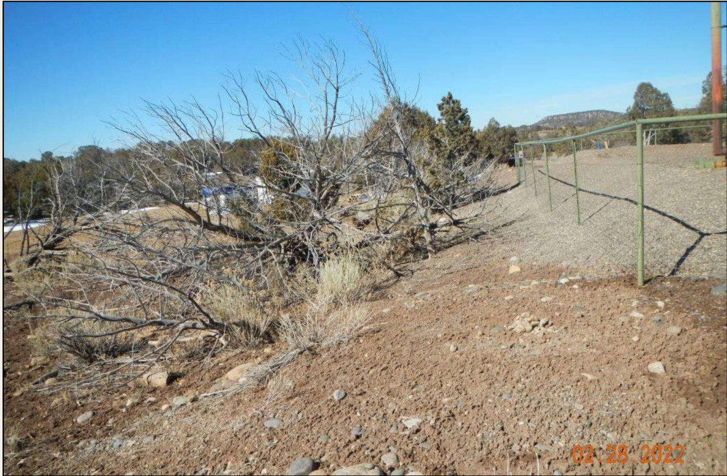
Photo 2. View of the southern project area from the southeastern corner facing westward. Revegetation such as rubber rabbitbrush, sand dropseed, and western wheatgrass observed.