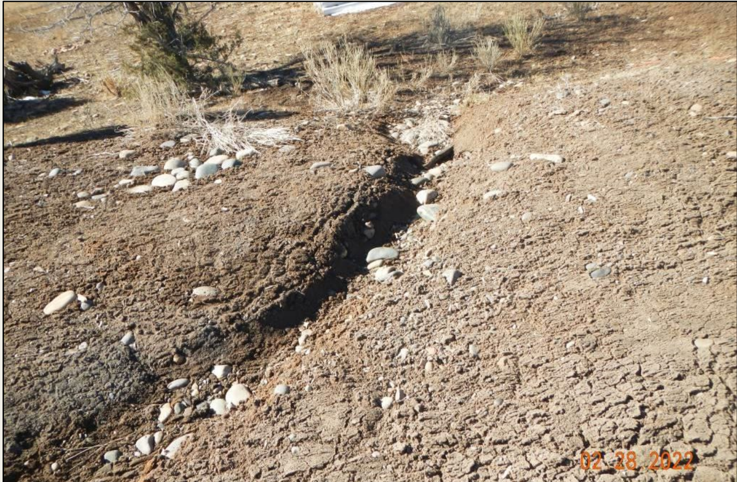
Photo 4. View of erosional channeling observed near the well pad entrance, approx. 12 inches wide and deep.