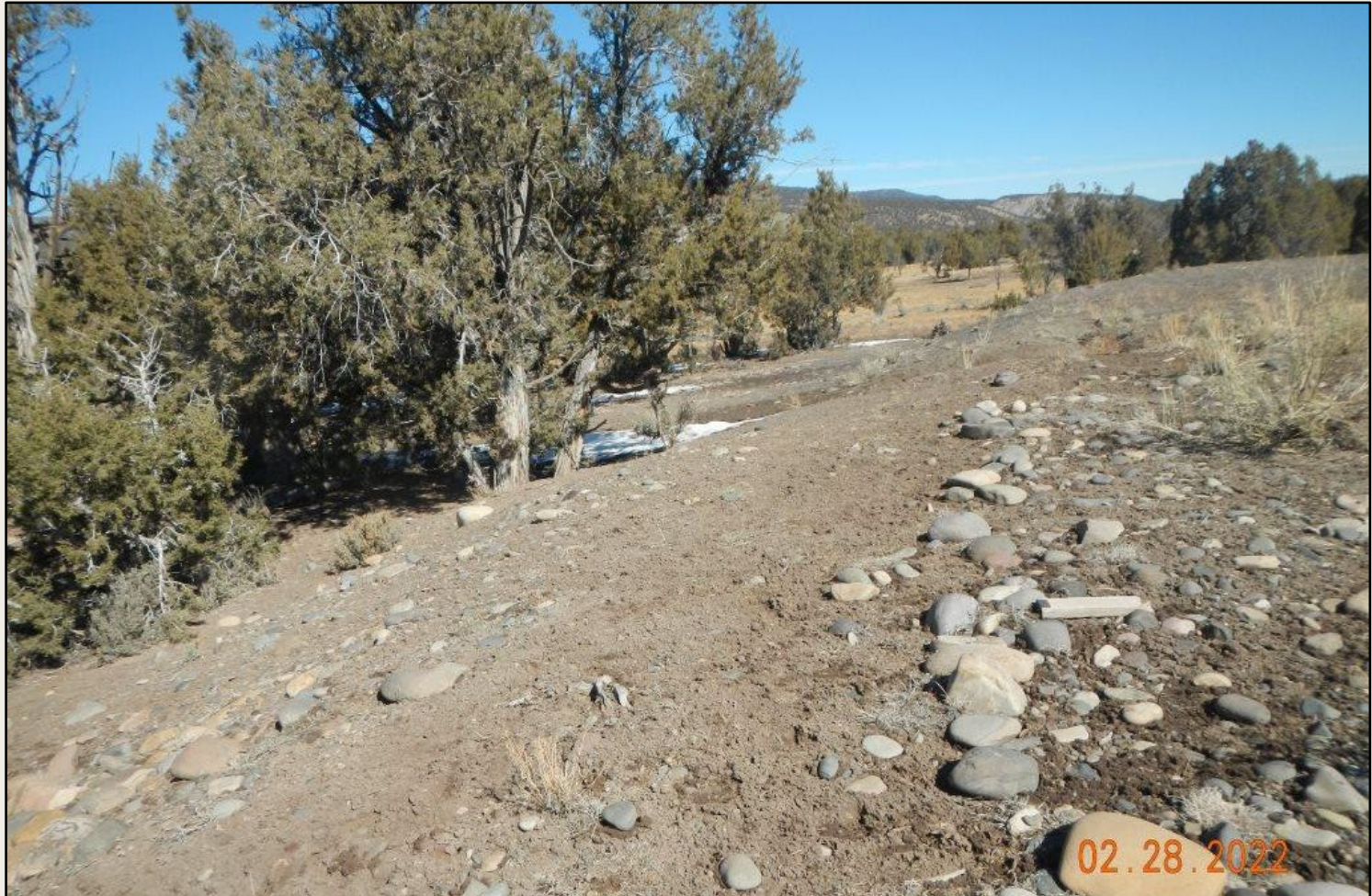
Photo 3. View of the western project area from the southwestern corner facing northward.