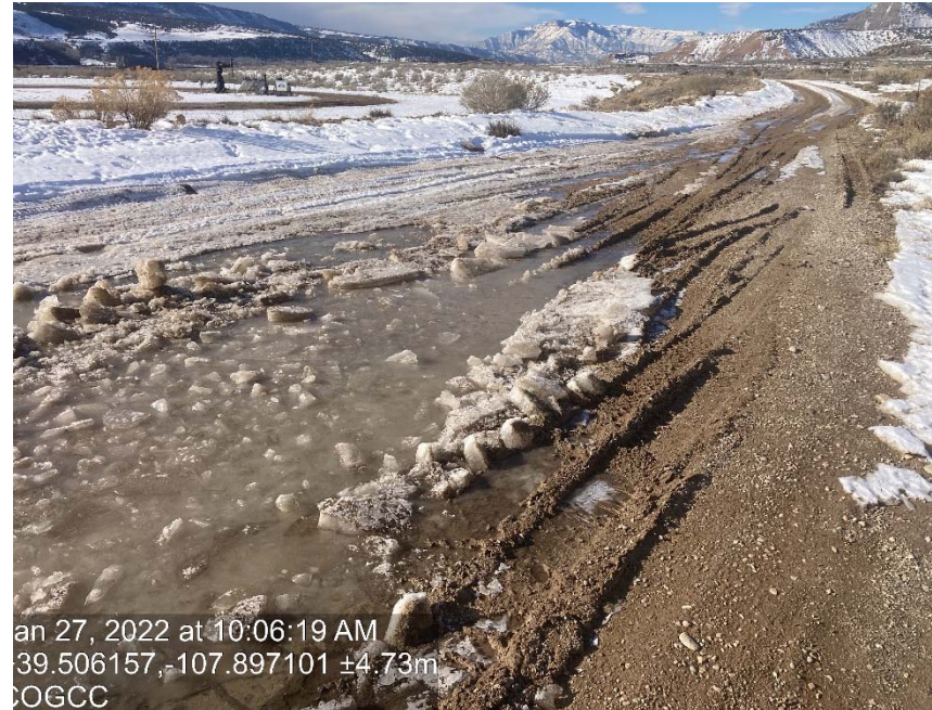
Lack of stabilization/ compaction/ degradation