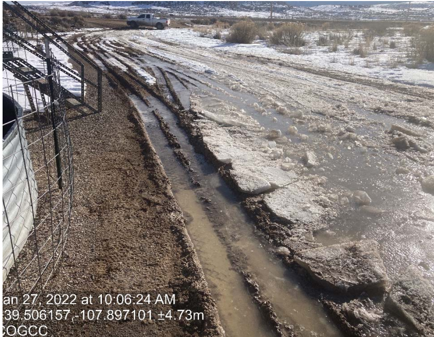
Lack of stabilization/ compaction/ degradation