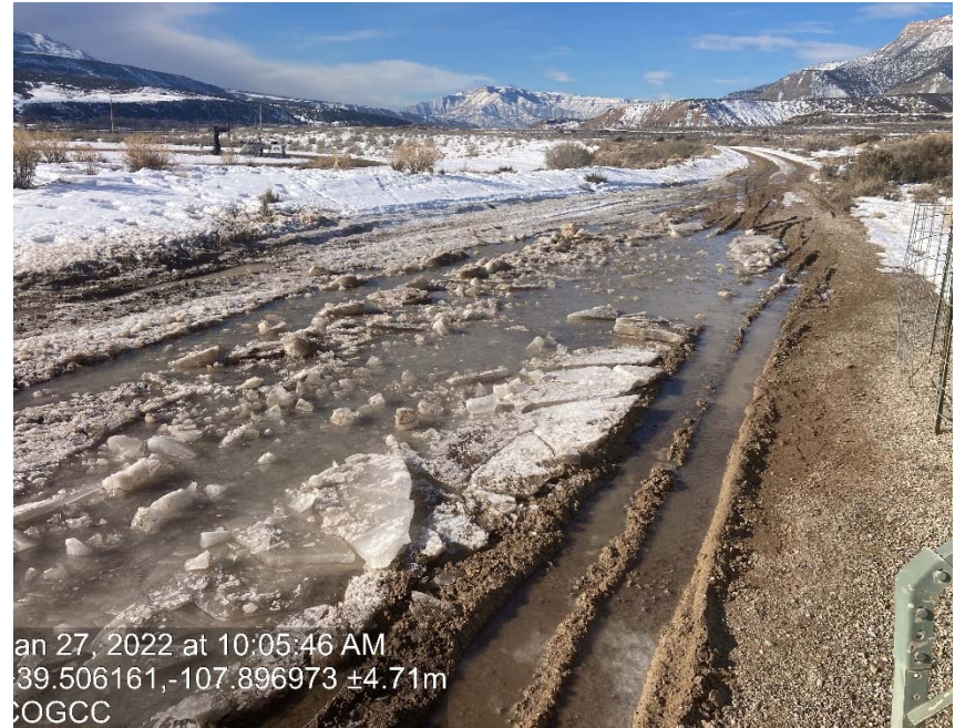
Lack of stabilization/ compaction/ degradation