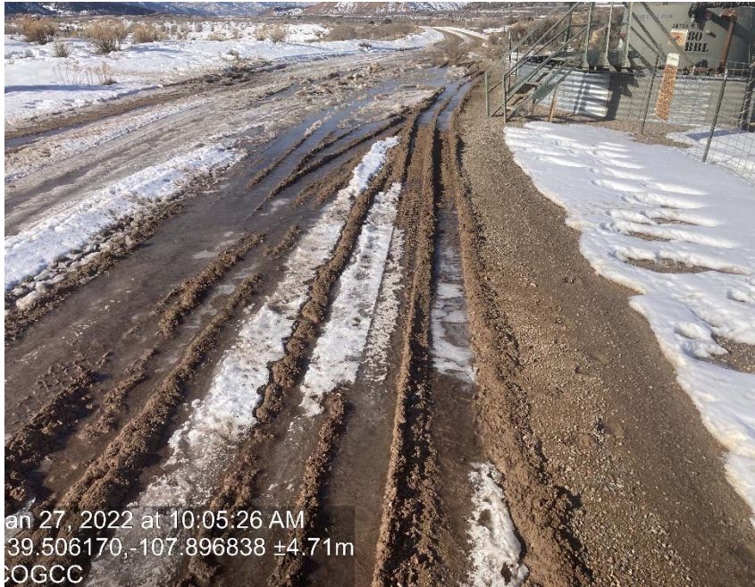
Lack of stabilization/ compaction/ degradation