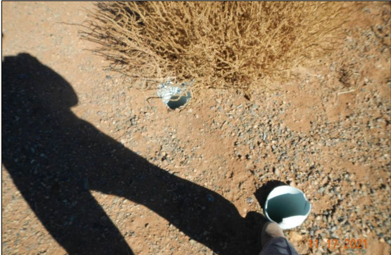
Photo 4. View of open pipes within the eastern project area, need to be filled/covered.