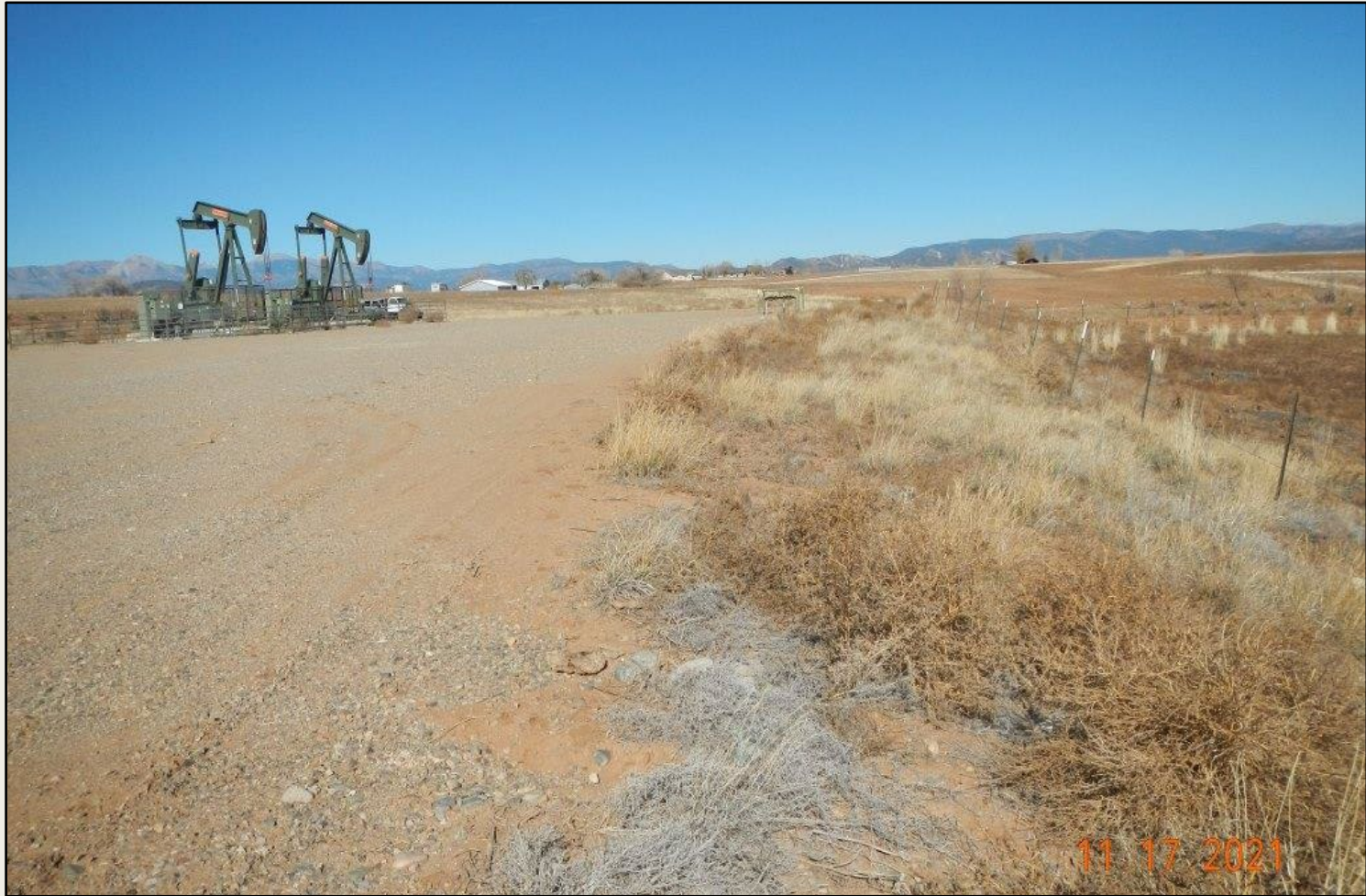
Photo 3. View of the eastern project area from the southeastern corner facing northward. Revegetation is progressing in portions with western wheatgrass, sand dropseed, and crested wheatgrass.