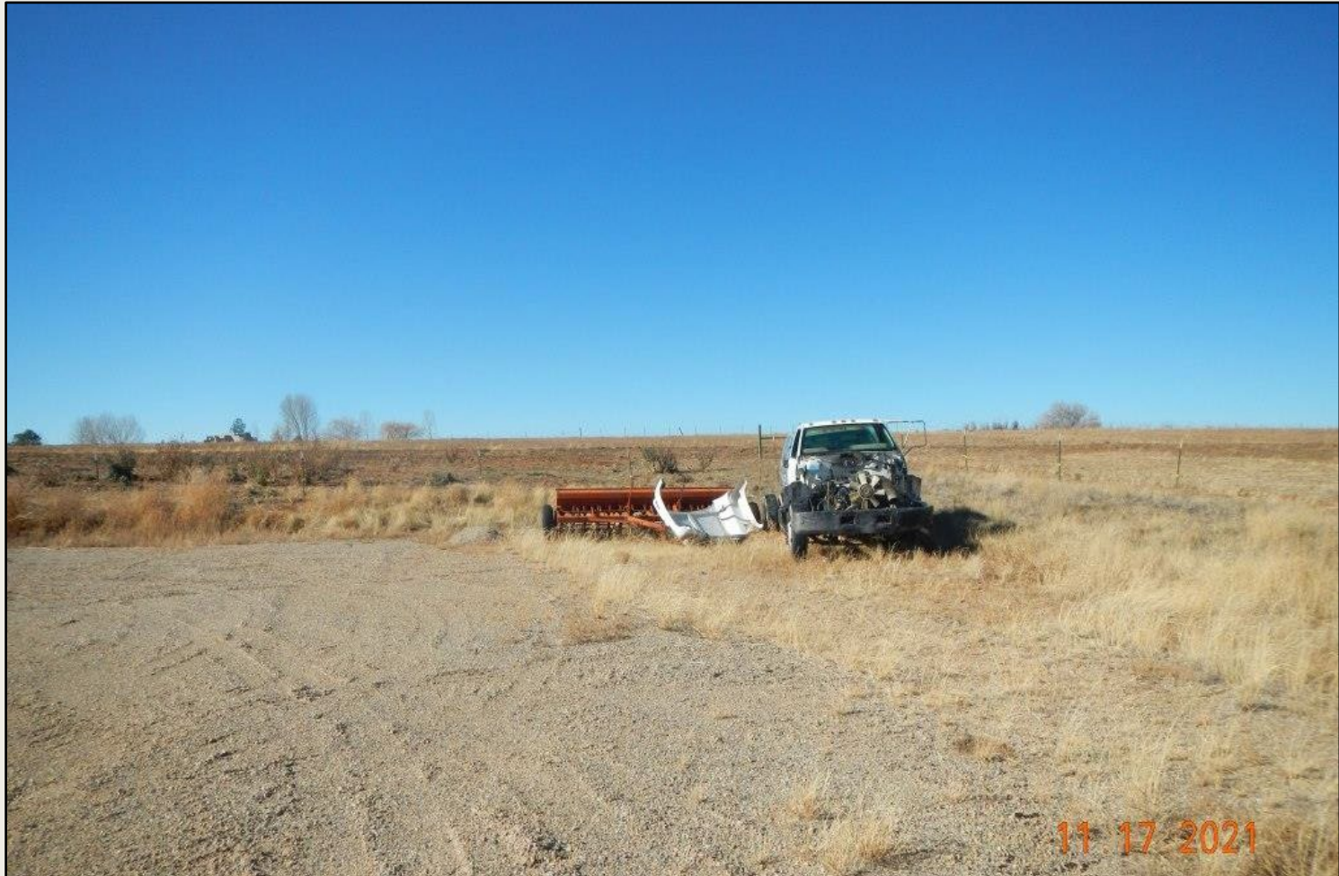
Photo 5. View of what appears to be landowner equipment and debris stored within the northwestern corner of the well pad.