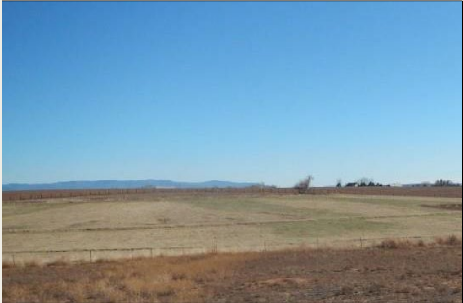
Photo 6. View of reference area comprised of irrigated grass and alfalafa field, as well as non-irrigated field, largely fallow at this time.