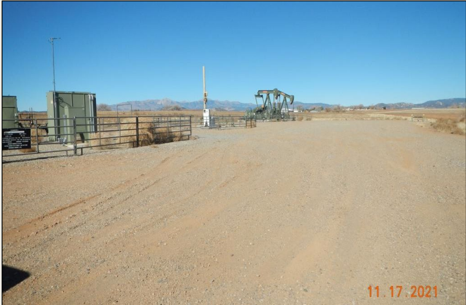
Photo 1. View of the project area from the well pad entrance facing center.