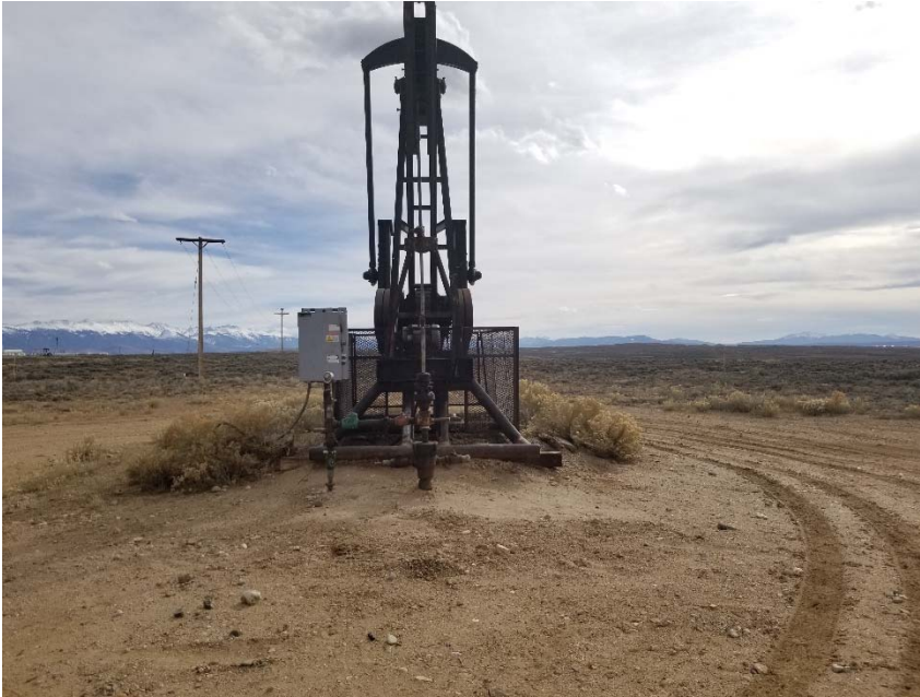
Photo 1. Overview of location taken facing south.