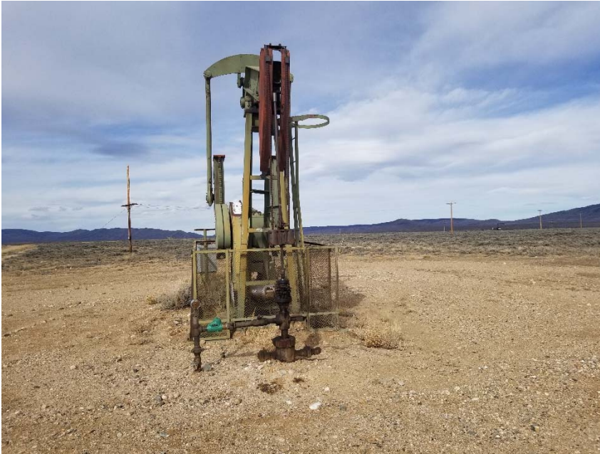
Photo 1. Overview of location taken facing north.