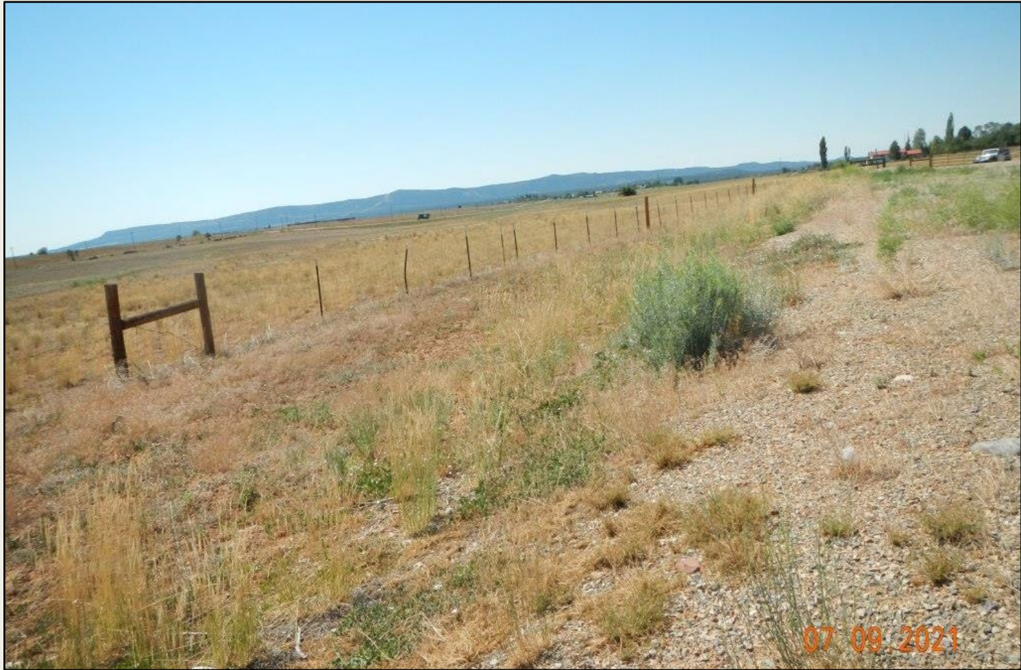
Photo 2. View of the eastern project area from the northeastern corner facing southward. Revegetation is progressing with crested wheatgrass, smooth brome, and sand dropseed.