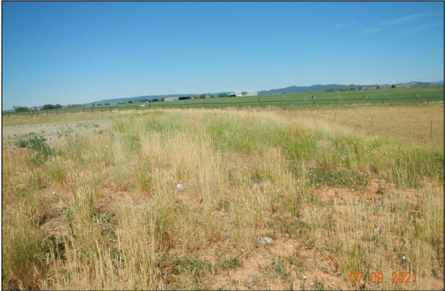
Photo 3. View the northern project area from the northeastern corner facing westward.