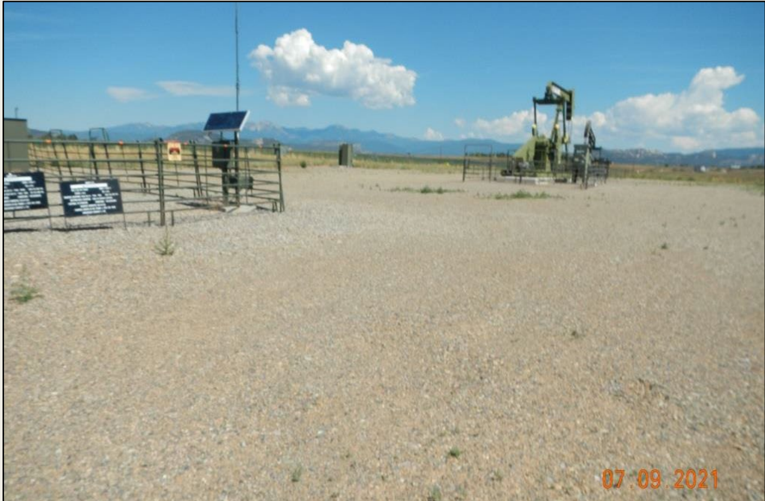
Photo 1. View the project area from the well pad entrance facing center.