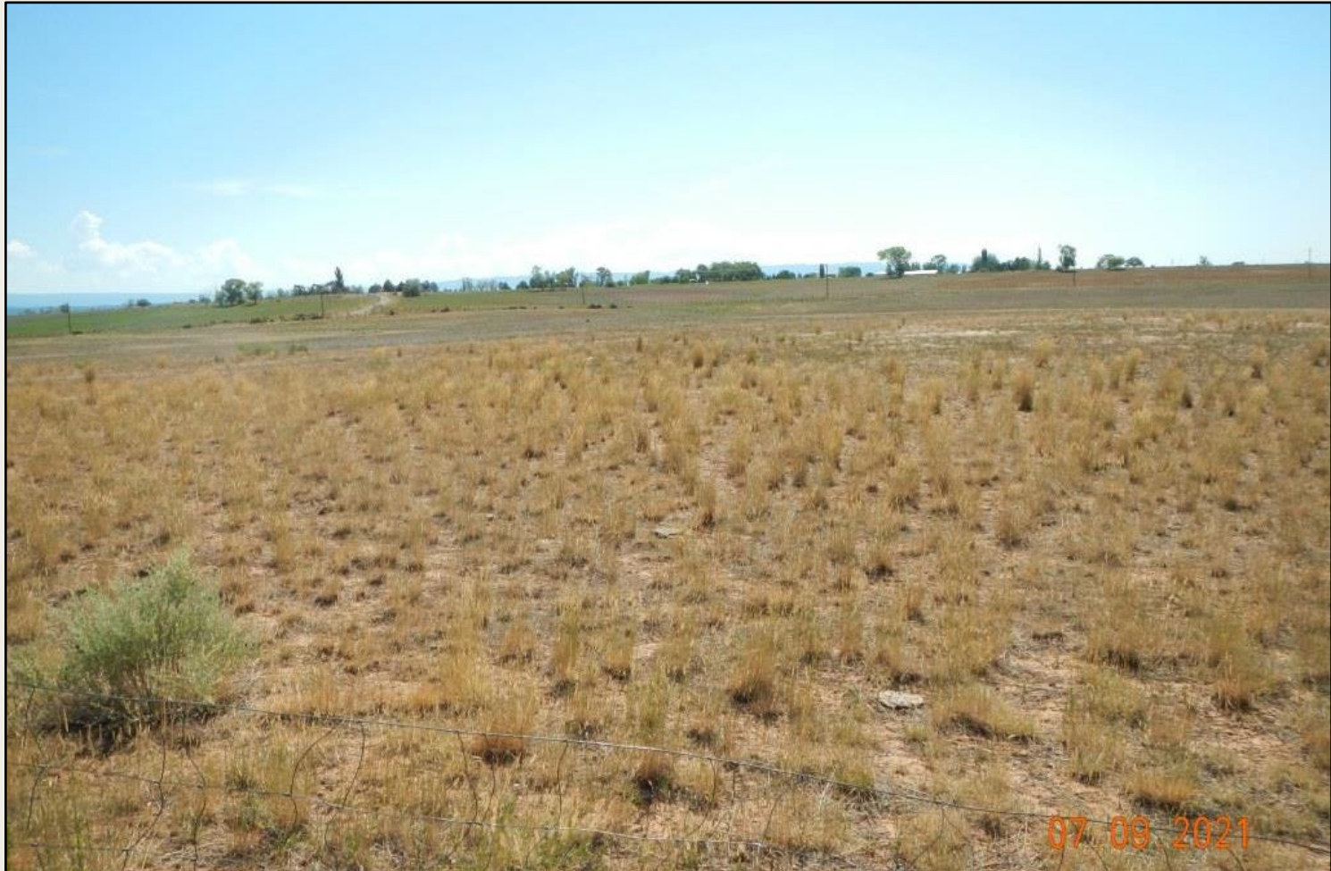
Photo 6. View the northern project area from the northeastern corner facing westward.