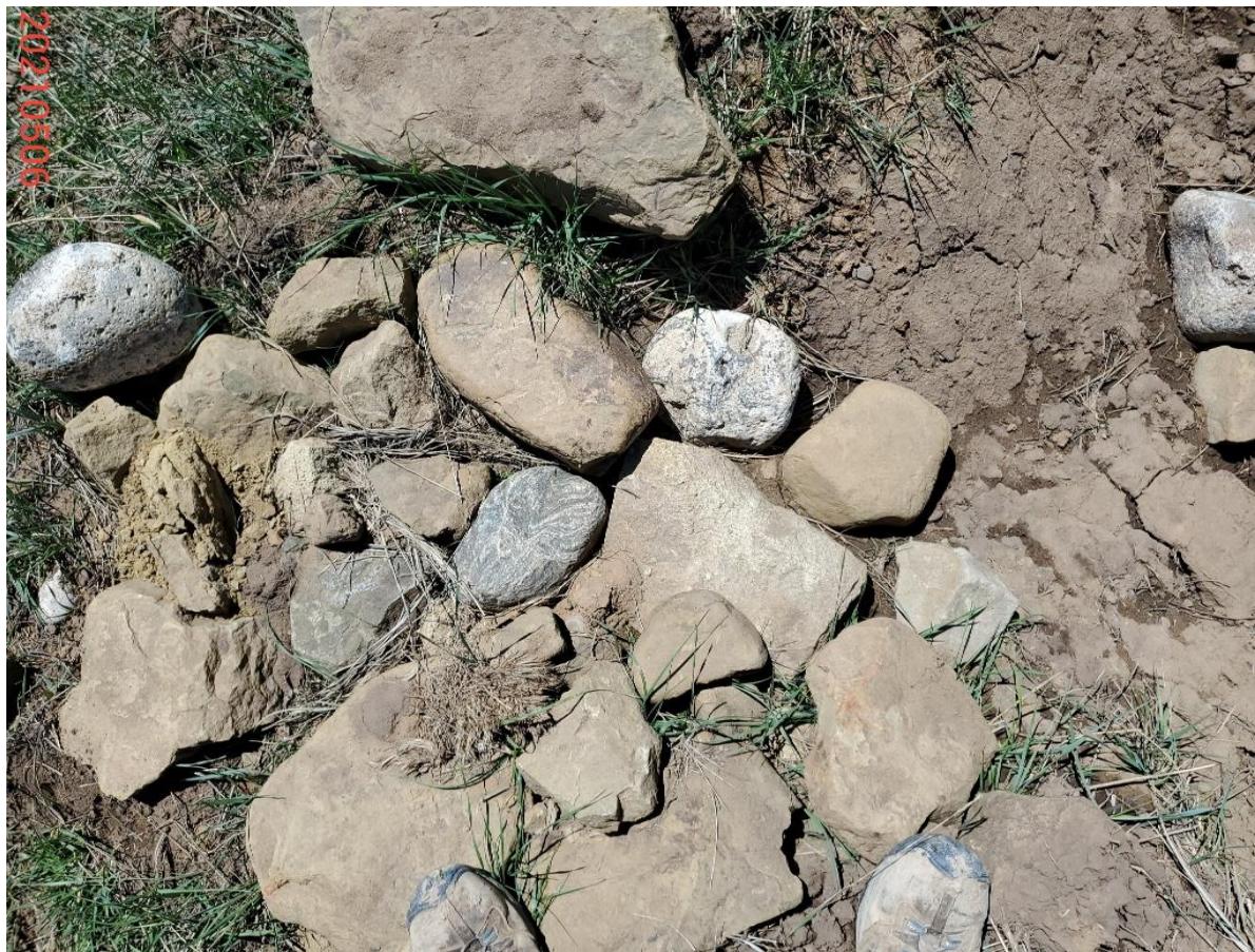
Photo 15: See comments under photo 13. Outlet not been installed with a geotextile liner beneath the riprap in accordance with good engineering practice.