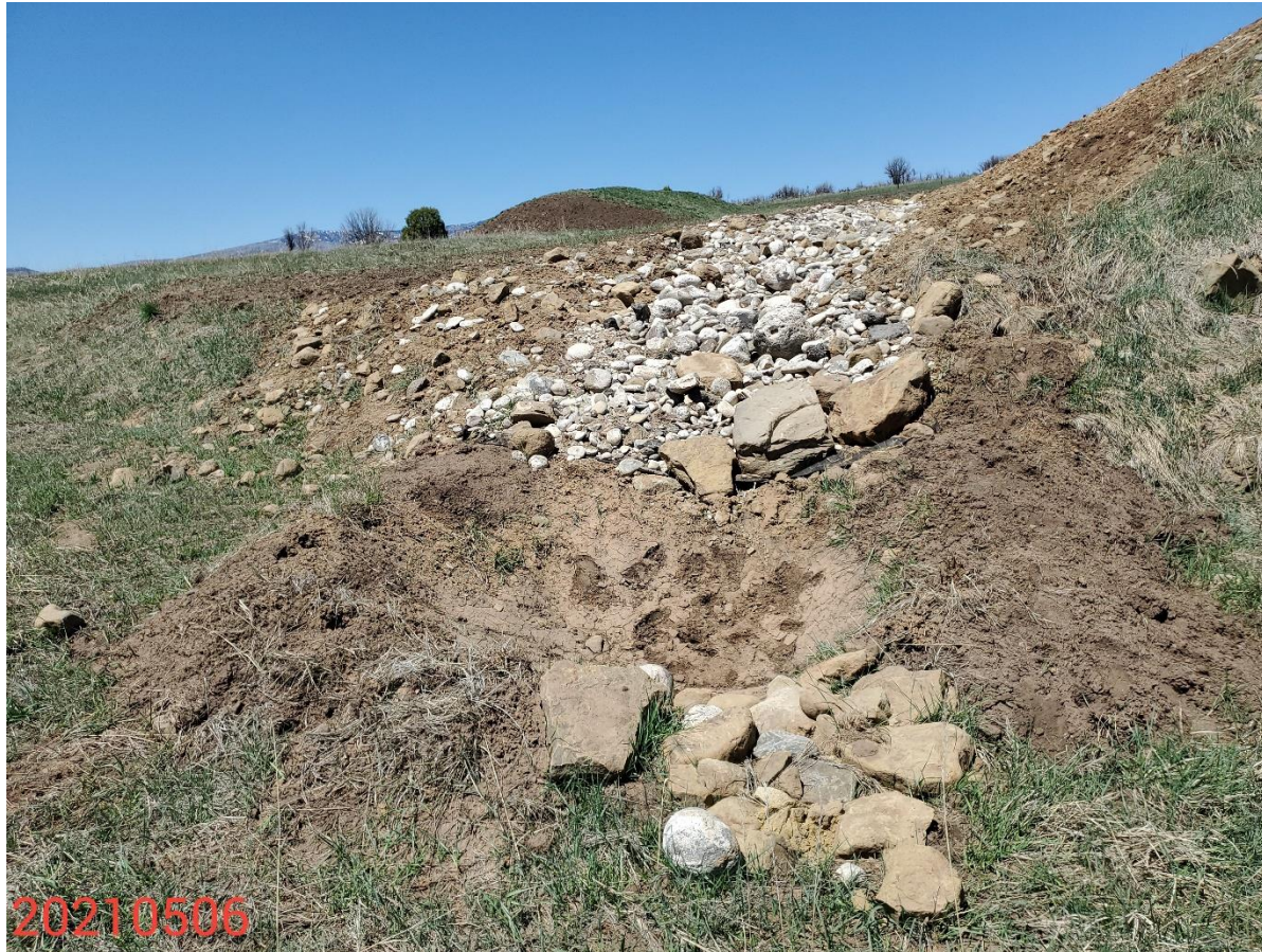
Photo 13: Photo taken from the southwest corner of the Location. Photo shows sediment trap. Previous inspections documented that the sediment trap was not been constructed with an appropriate outlet per good engineering practices. Photo shows outlet has not been constructed with an appropriate outlet.