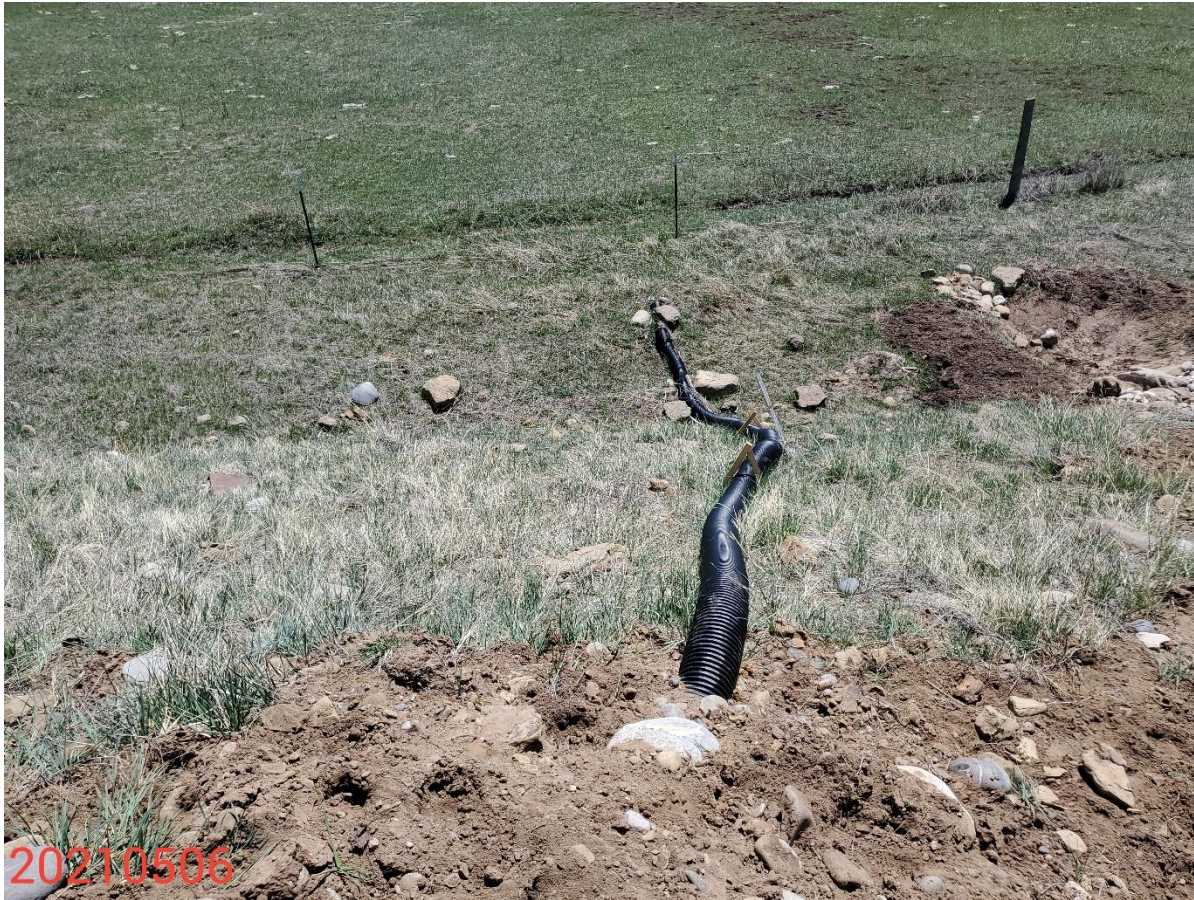
Photo 11: Photo taken from the southwest corner of the Location. Photo shows slope drain. Previous inspections documented that the slope drain was not been constructed with an appropriate outlet per good engineering practices. Photo shows slope drain has not been constructed with an appropriate outlet.