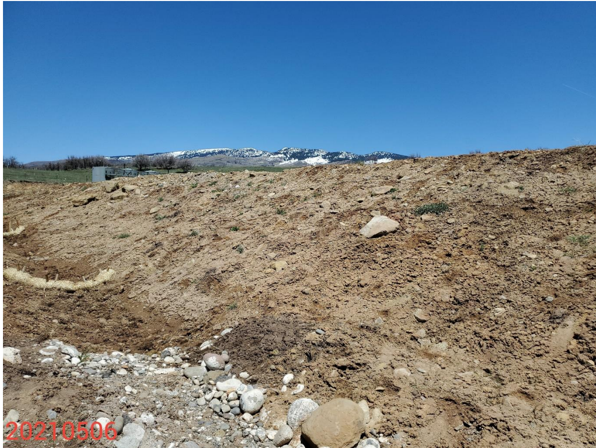
Photo 16: Photo taken from the slopes on the west end of the Location. Previous inspections documented that control measures to protect/stabilize slopes on the Location were missing or insufficient. Photo shows control measures to protect/stabilize slopes on the Location remain missing or insufficient.