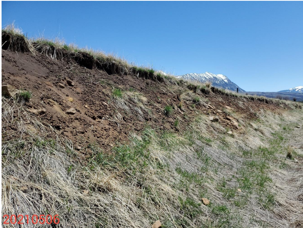
Photo 23: Photo taken from the northeast end of the Location. Previous inspections documented that control measures to protect/stabilize slopes on the Location were missing or insufficient. Photo shows control measures to protect/stabilize slopes on the Location remain missing or insufficient