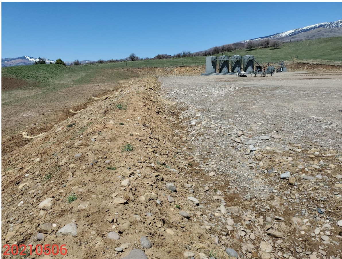
Photo 6: Photo taken from the southwest corner of the Location, facing north. Photos 6-8 show areas on the southwest corner of the Location have not been reclaimed in accordance with 1003 rules and corrective actions.