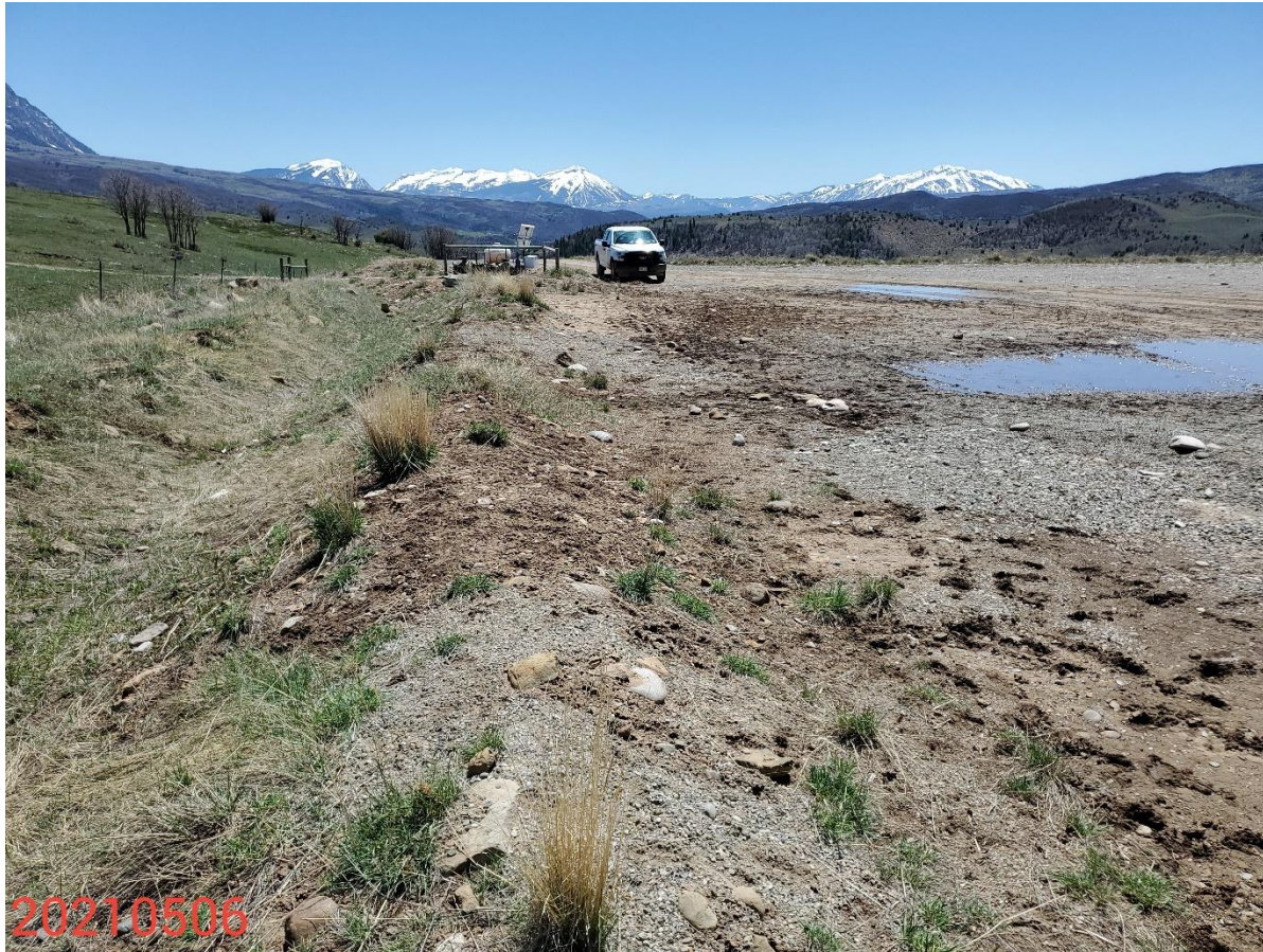
Photo 1: Photo taken from the east end of the production area, facing south. Photos 1-5 provide an overview of the Location from south, southwest, west, northwest to north. Photos also show areas on the southwest end of the Location not needed for production; photo shows areas not needed for production have not been reclaimed.