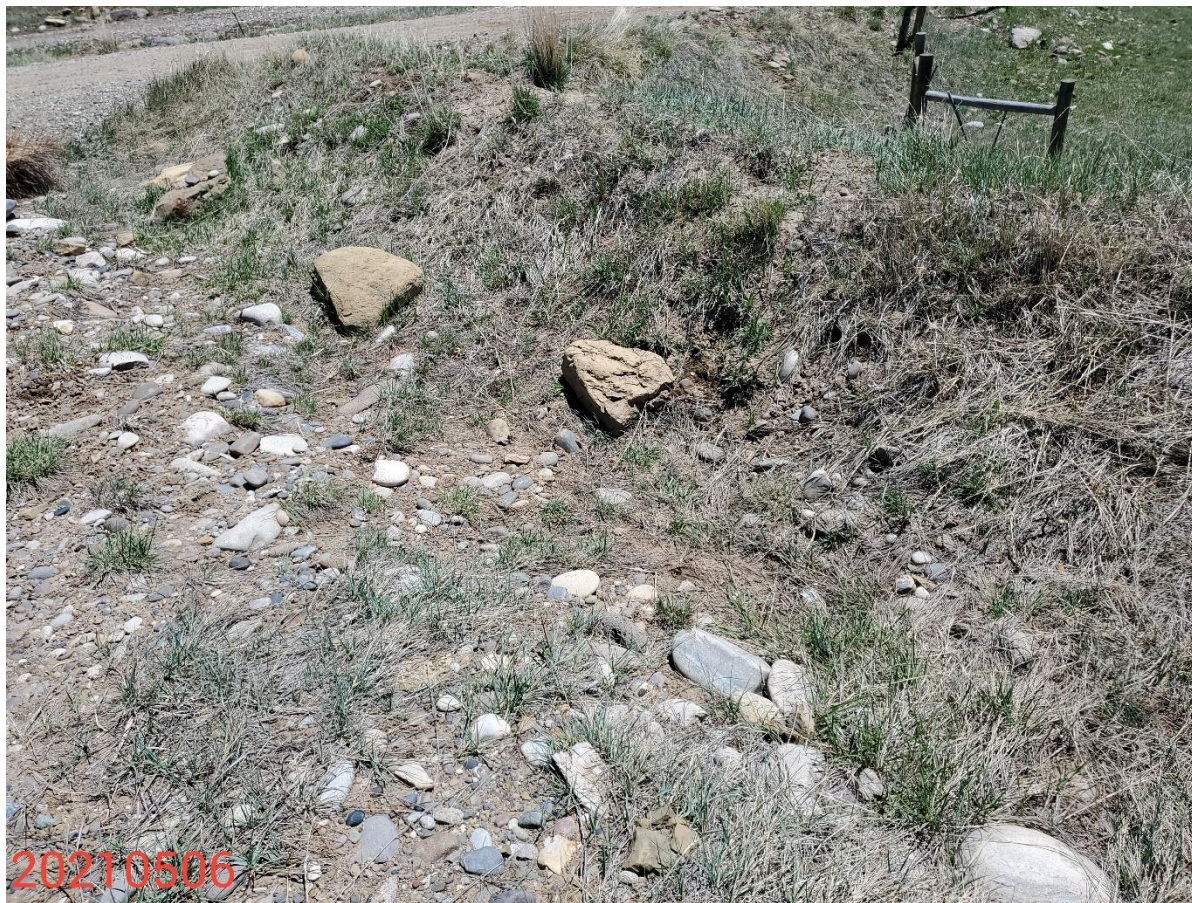
Photo 10: Photo taken from the southeast corner of the Location. Photo shows inlet of the slope drain remains filled with sediment and not in proper functioning condition.