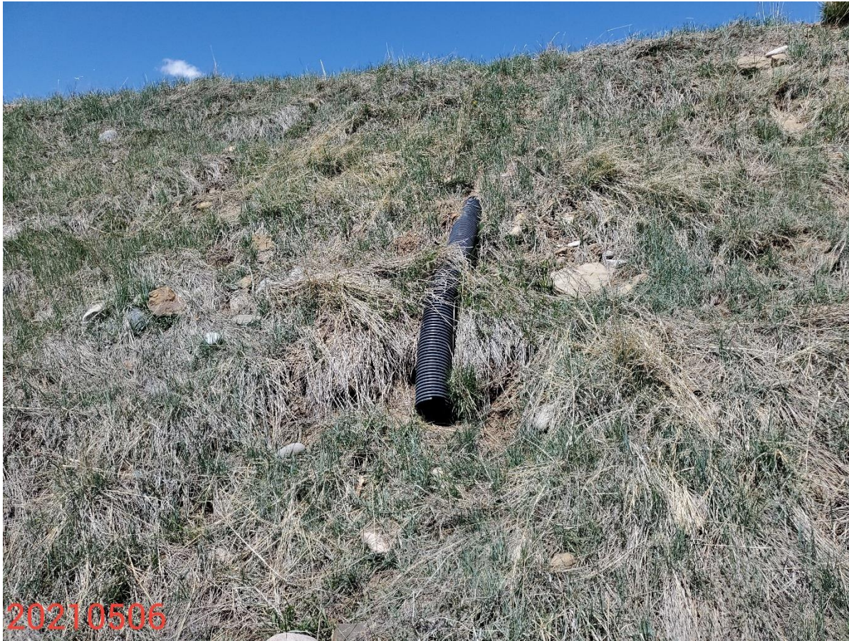
Photo 9: Photo taken from the southeast corner of the Location. Photo shows slope drain. Previous inspections documented that the slope drain was not been constructed with an appropriate outlet per good engineering practices. Photo shows slope drain has not been constructed with an appropriate outlet.