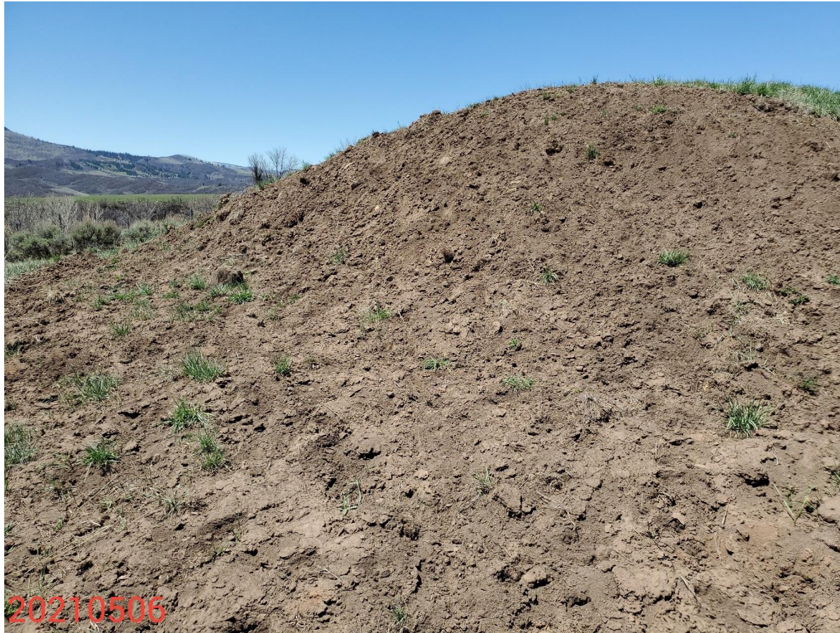
Photo 18: Photo taken from the topsoil stockpile on the west end of the Location. Previous inspections documented that control measures to protect/stabilize slopes on the Location were missing or insufficient. Photo shows control measures to protect/stabilize slopes on the Location remain missing or insufficient.