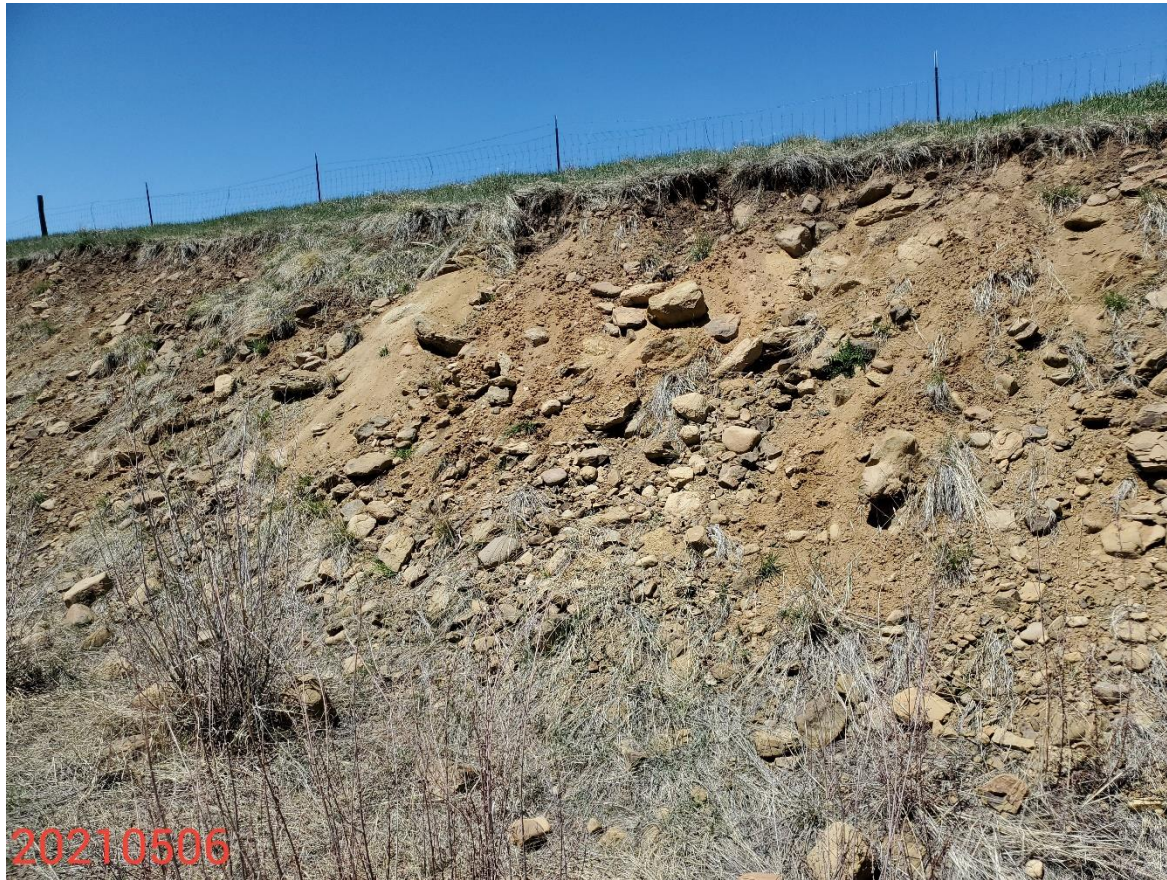
Photo 21: Photo taken from the north end of the Location. Previous inspections documented that control measures to protect/stabilize slopes on the Location were missing or insufficient. Photo shows control measures to protect/stabilize slopes on the Location remain missing or insufficient