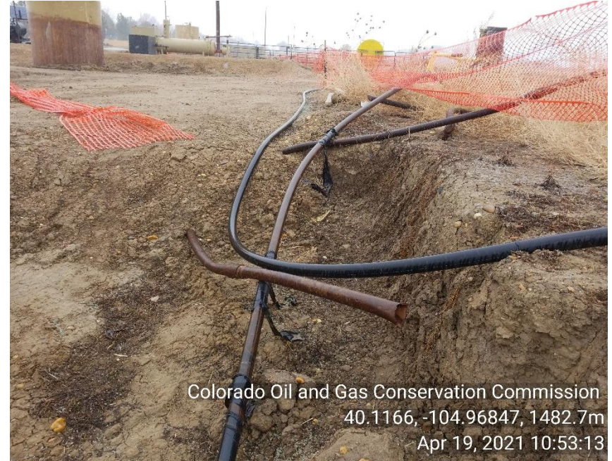
Photo 14 exposed lines not plugged or capped.