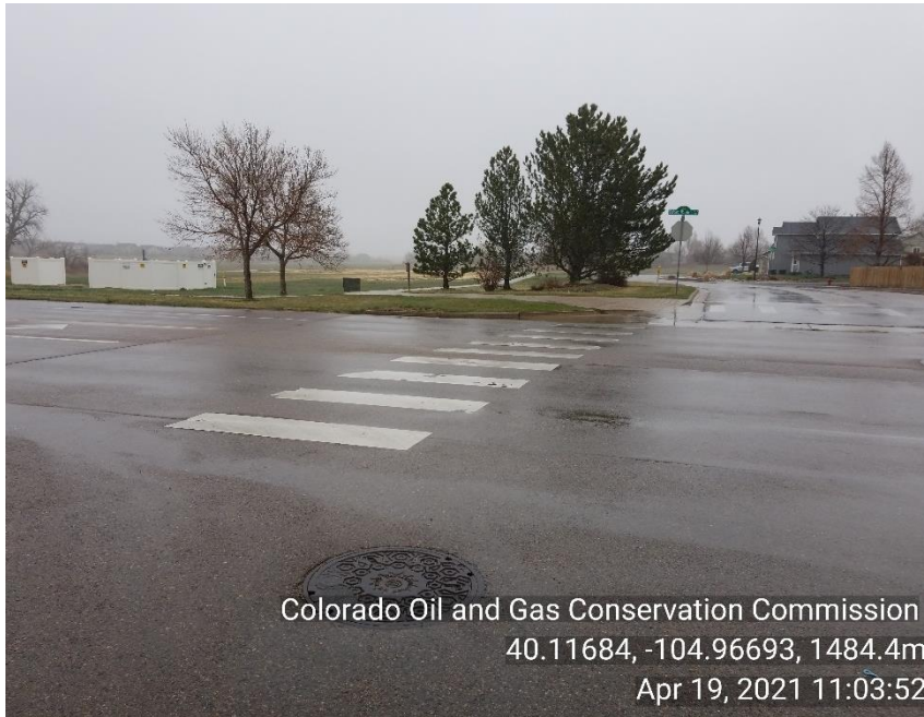
Photo 43 Cross walk guard escorts elementary kids across county road.