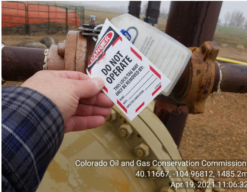
Photo 45 Separator not properly LOTO