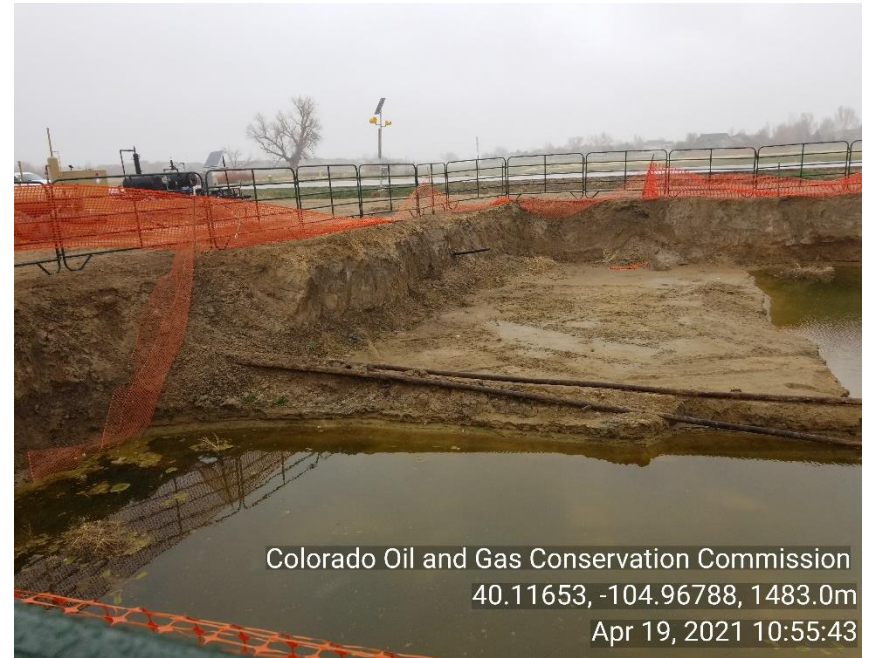
Photo 24 open excavation pic. No BMP's in place to prevent storm water from entering excavation.