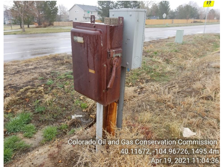
Photo 44 electric box not LOTO.