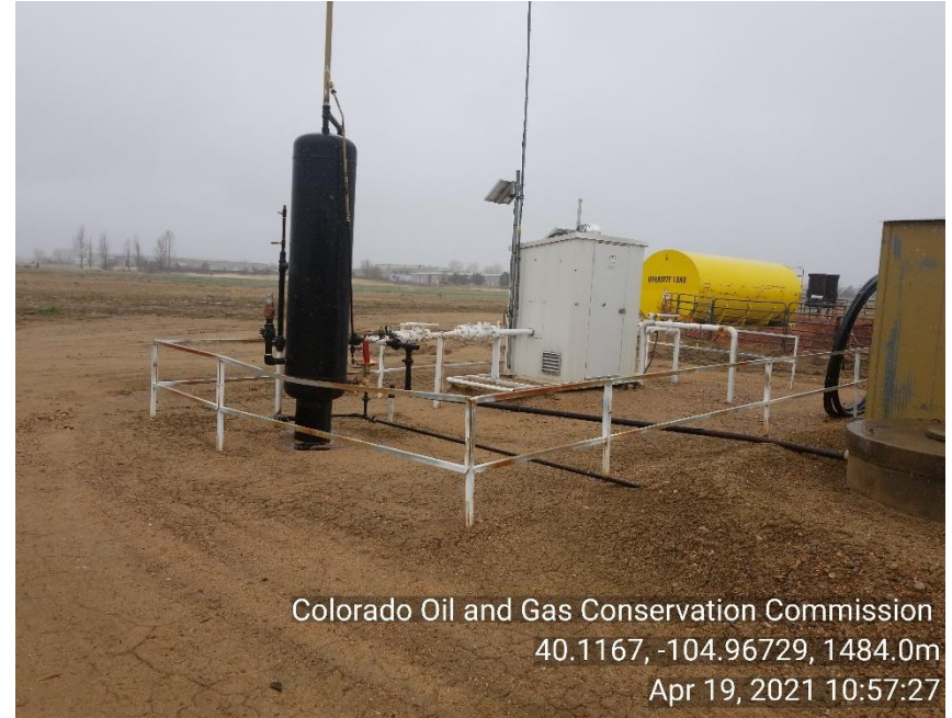
Colorado Oil and Gas Conservation Commission 40.1167, -104.96729, 1484.0m Apr 19, 2021 10:57:27

Photo 30 Meter house. Sales line is in the open position.