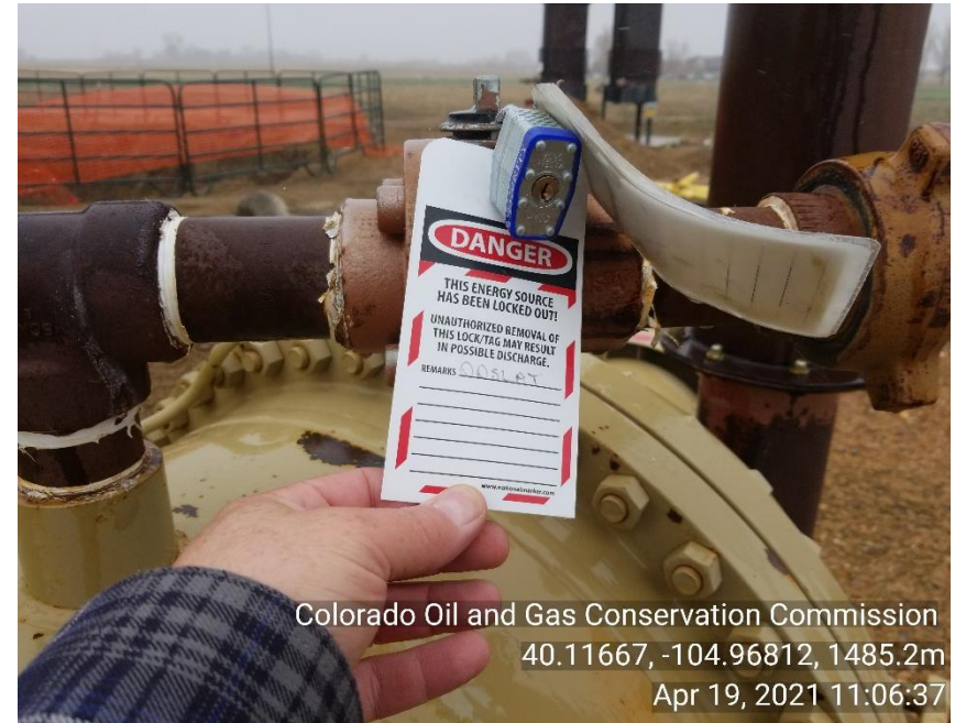
Photo 46 Separator not properly LOTO.