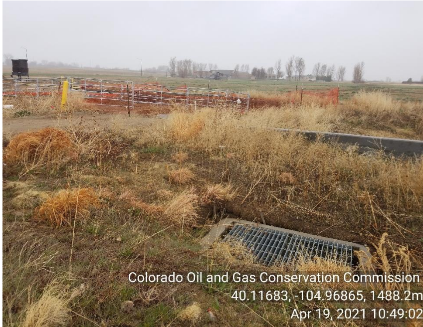
Photo 3 No inlet protection around storm drain.