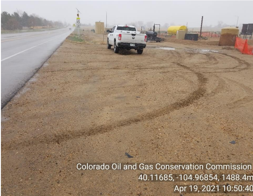
Photo 5 No tracking pad BMP