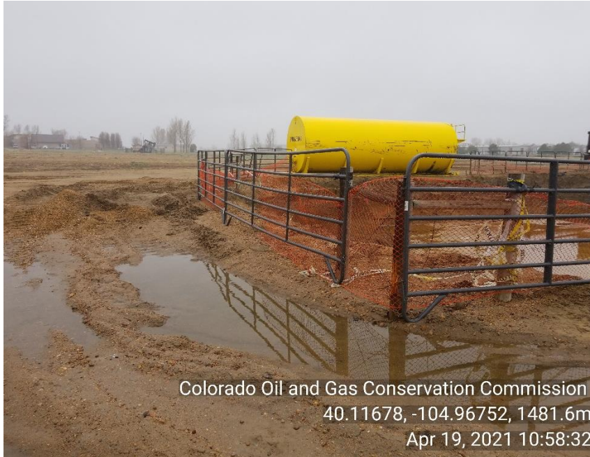
Photo 36 Improper fencing around open excavation and work site