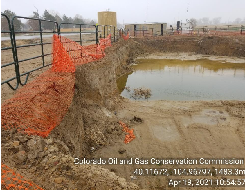
Photo 21 unsafe and improper fencing around open excavation. What appears to be visible ground water.