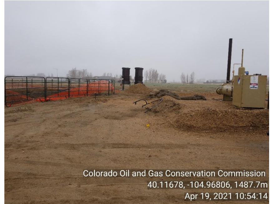
Colorado Oil and Gas Conservation Commission 40.11678, -104.96806, 1487.7m Apr 19, 2021 10:54:14