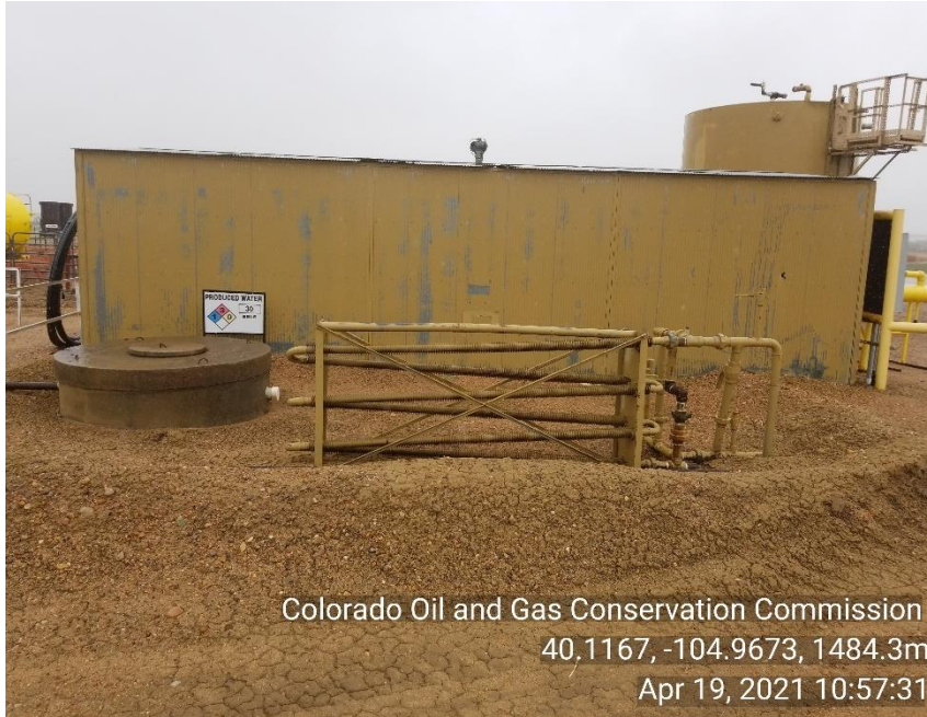
Colorado Oil and Gas Conservation Commission 40.1167, -104.9673, 1484.3m Apr 19, 2021 10:57:31