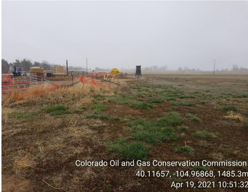
Photo 9 No BMP's around work site to protect run on or run off.