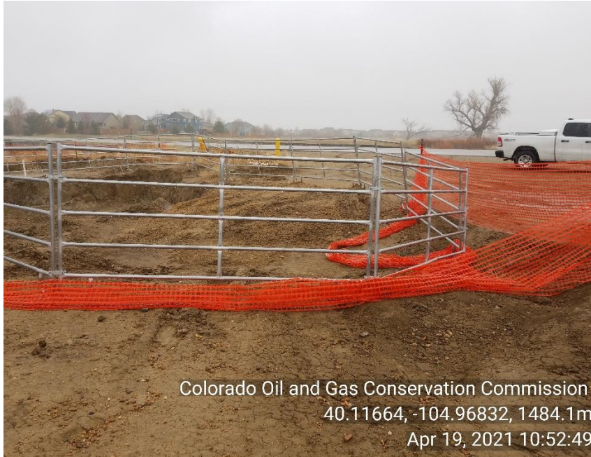
Photo 13 Improper safety fence around work site.