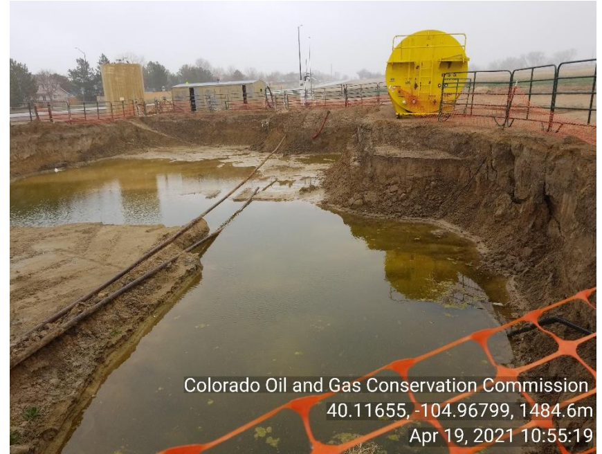
Photo 22 What appears to be visible ground water, unsupported flow lines. Fencing and equipment on edge of vertical bank.