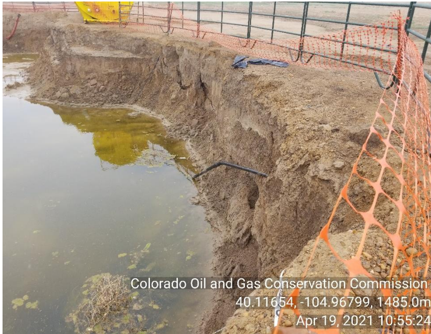
Photo 23 Piping cut and in water