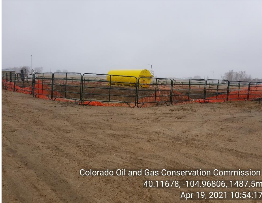
Photo 19 improper fencing around open excavation and work site.