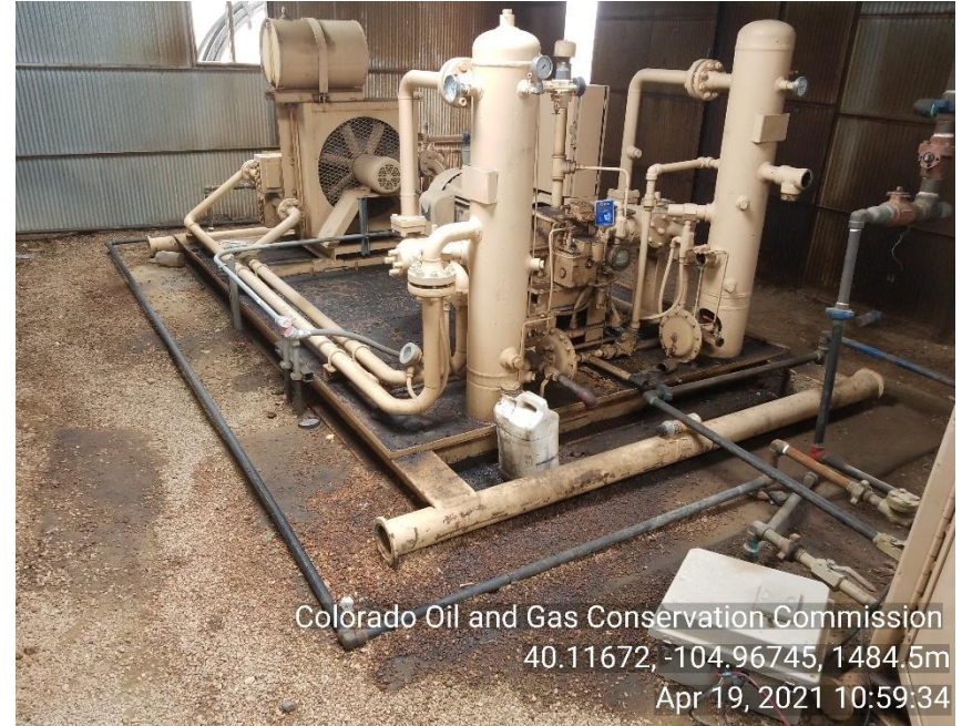
Photo 37 Stained soil and mechanical issues inside compressor building.