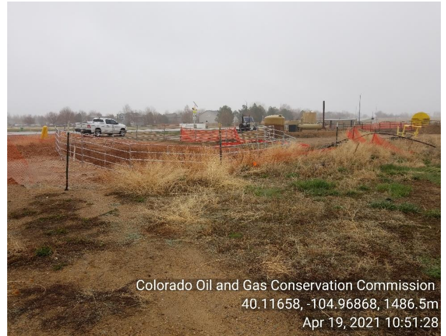
Photo 8 Improper safety fence around work area.