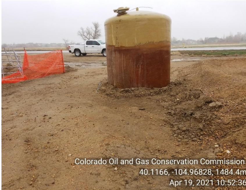
Photo 11 Unused equipment