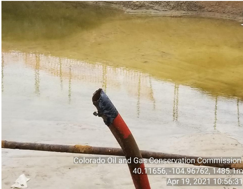
Photo 27 open ended pipe in open excavation.