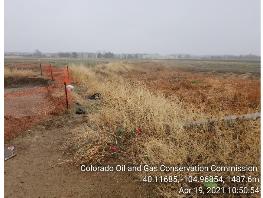
Photo 6 Debris: dead weeds and not BMP between produced water tank excavation and water way.