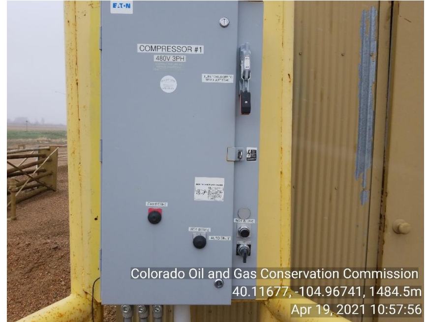
Colorado Oil and Gas Conservation Commission 40.11677, -104.96741, 1484.5m Apr 19, 2021 10:57:56