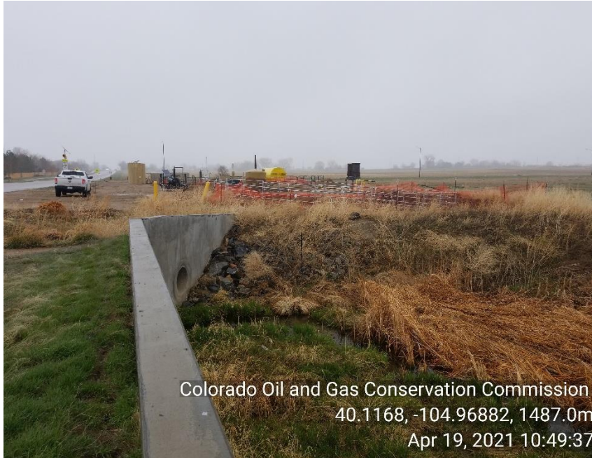
Photo 1 no BMP's in place between active water way (riparian habitat) and open excavation.