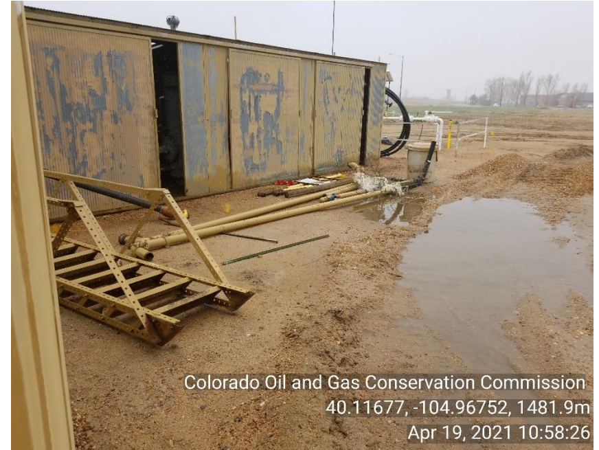
Photo 35 Unused equipment