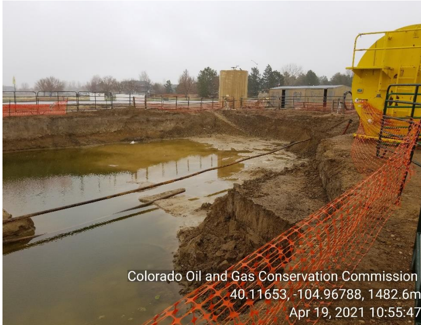
Photo 25 open excavation pic