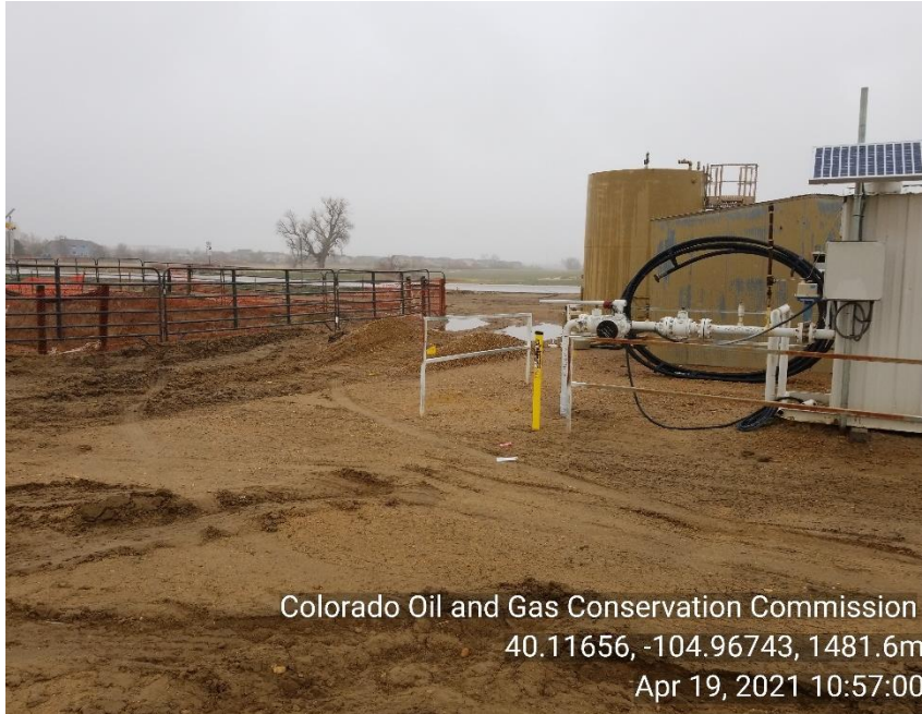
Colorado Oil and Gas Conservation Commission 40.11656, -104.96743, 1481.6m Apr 19, 2021 10:57:00

Photo 30 Meter house. Sales line is in the open position.