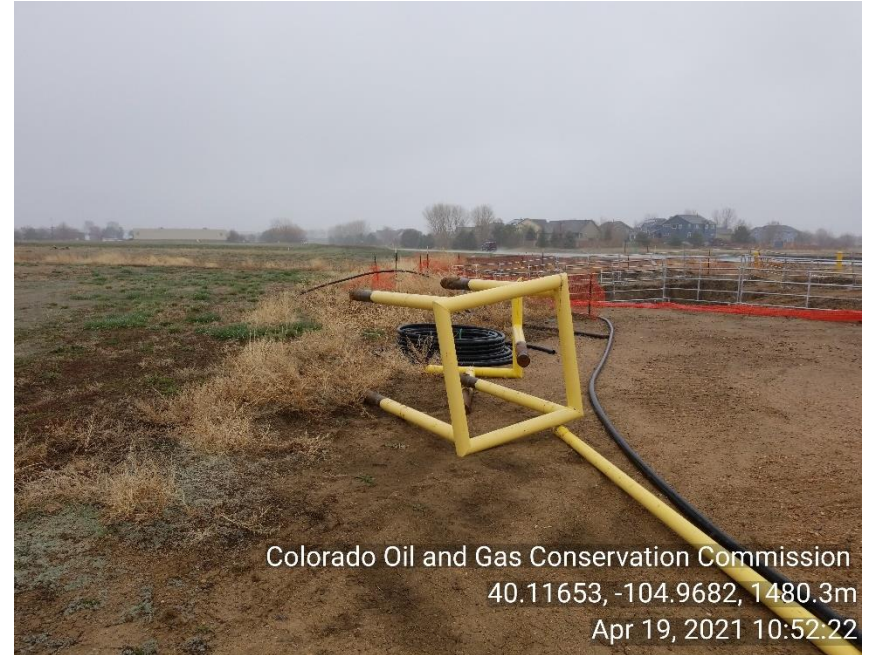
Photo 10 unused equipment.