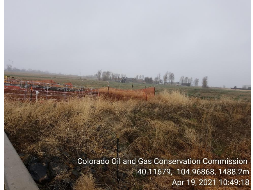
Photo 4 no BMP's in place between active water way (riparian habitat) and open excavation.