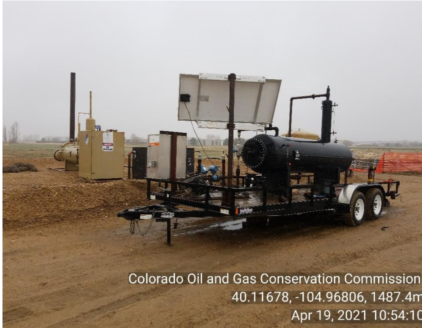
Colorado Oil and Gas Conservation Commission 40.11678, -104.96806, 1487.4m Apr 19, 2021 10:54:10