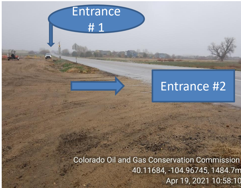
Photo 34 not tracking pad BMP