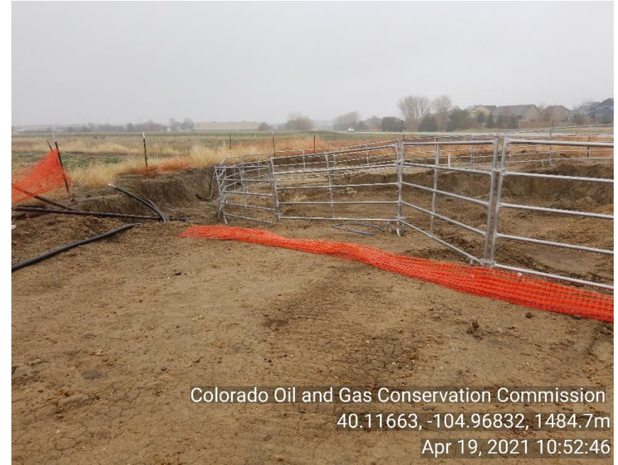
Photo 12 improper safety fence around work zone and open excavation.