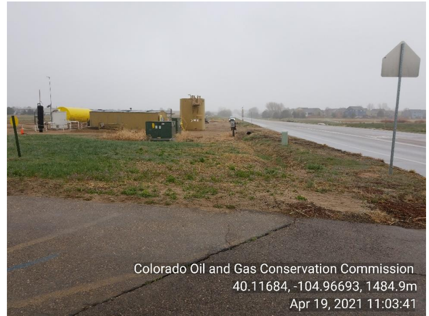
Photo 40 Valves to sales meter in the open position

Colorado Oil and Gas Conservation Commission 40.11684, -104.96693, 1484.9m Apr 19, 2021 11:03:41