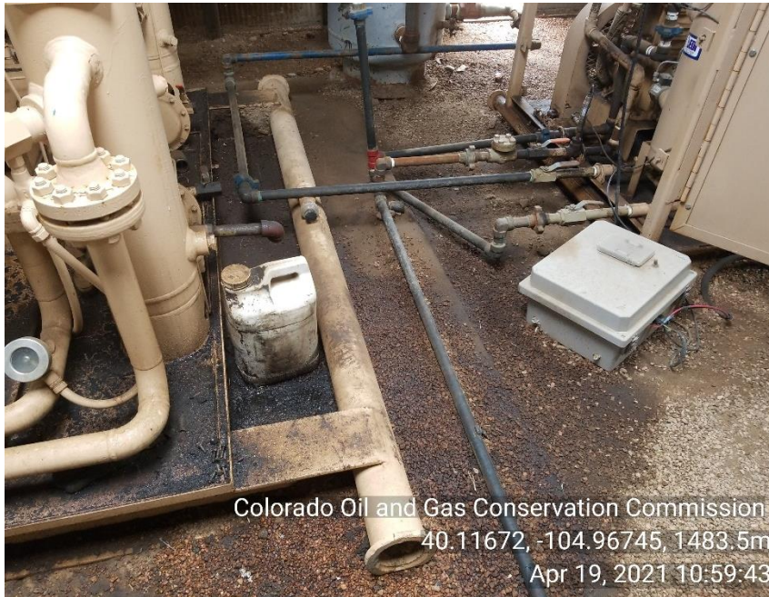
Photo 38 Stained soil and mechanical issues inside compressor building