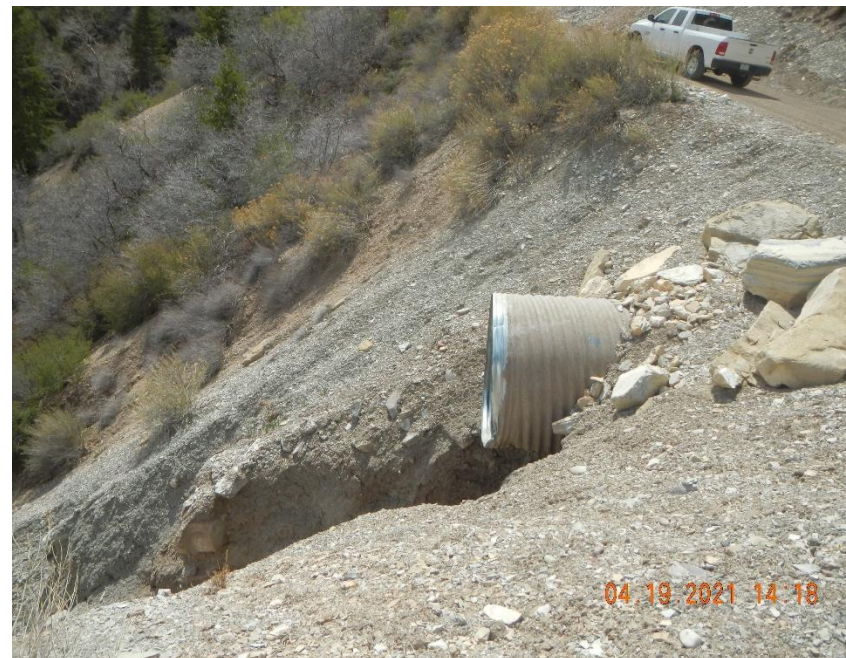
Erosion created from flow of culvert.