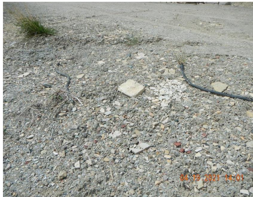
Electric wire cable pieces on edge of location.