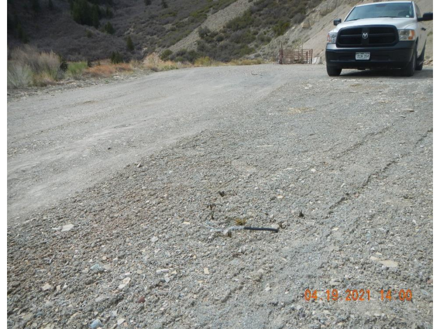
Buried electric cables exposed.