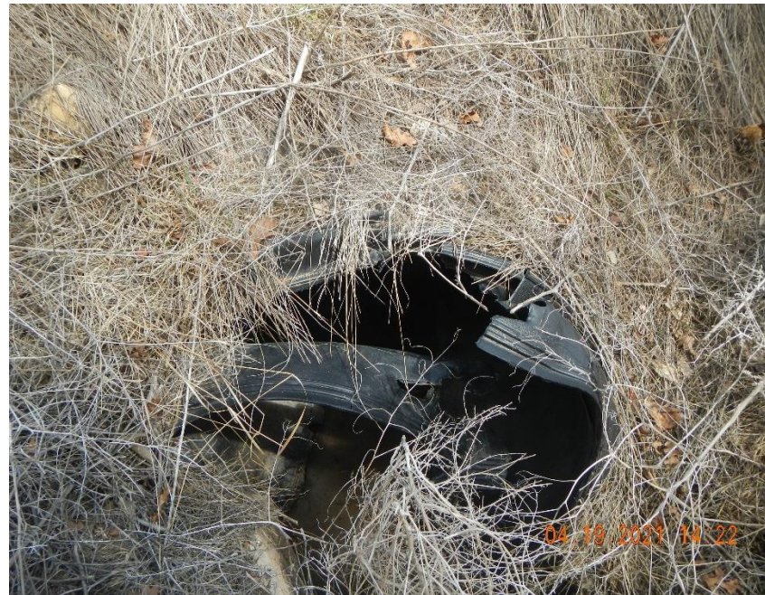
Sediment and rock in culvert.