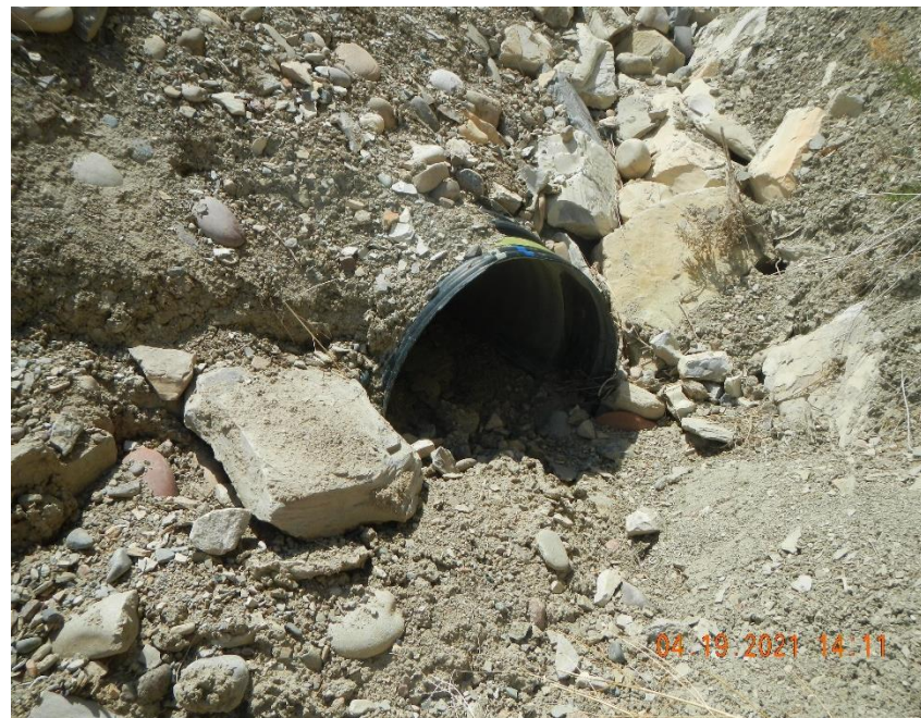
Sediment in culvert.