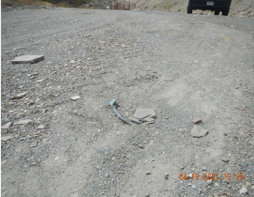
Buried electric cables exposed.