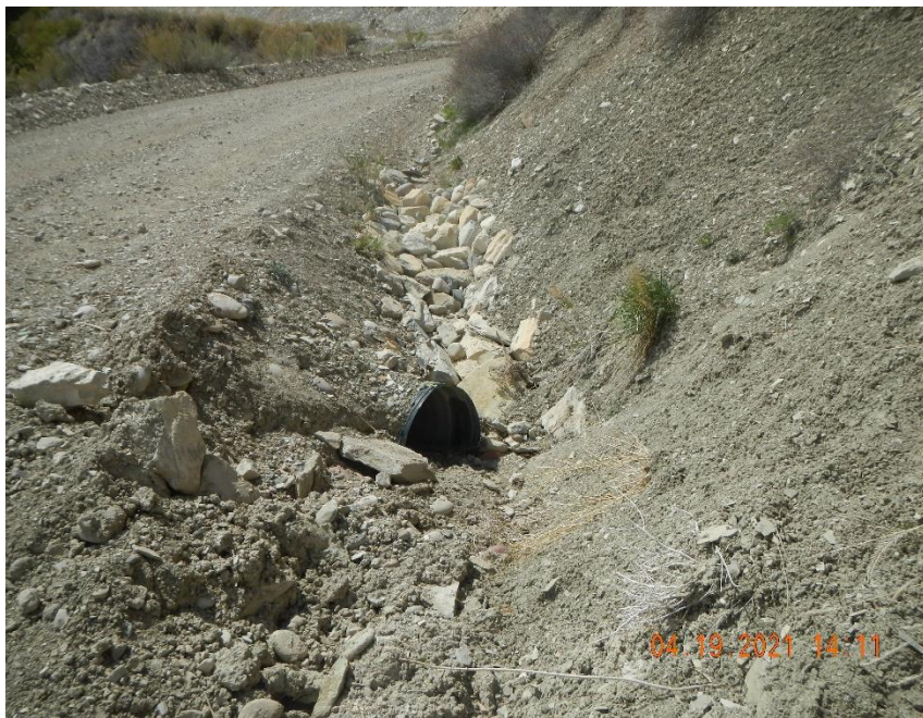
Sediment in culvert.