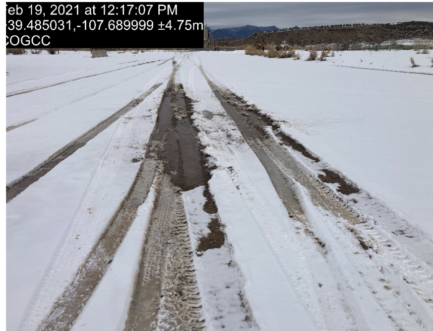
Lack of stabilization/entrance