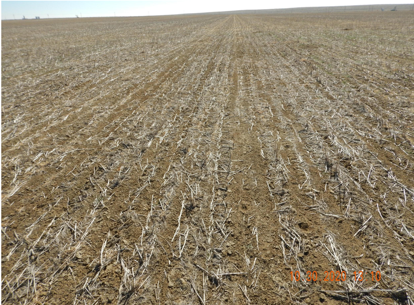
Photo 3. Photo taken from the well location, facing South. See comments under Photo 2.