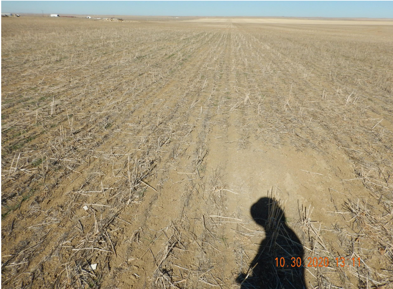
Photo 5. Photo taken from the well location, facing North. See comments under Photo 2.