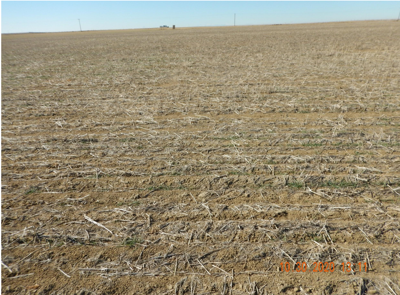
Photo 4. Photo taken from the well location, facing West. See comments under Photo 2.