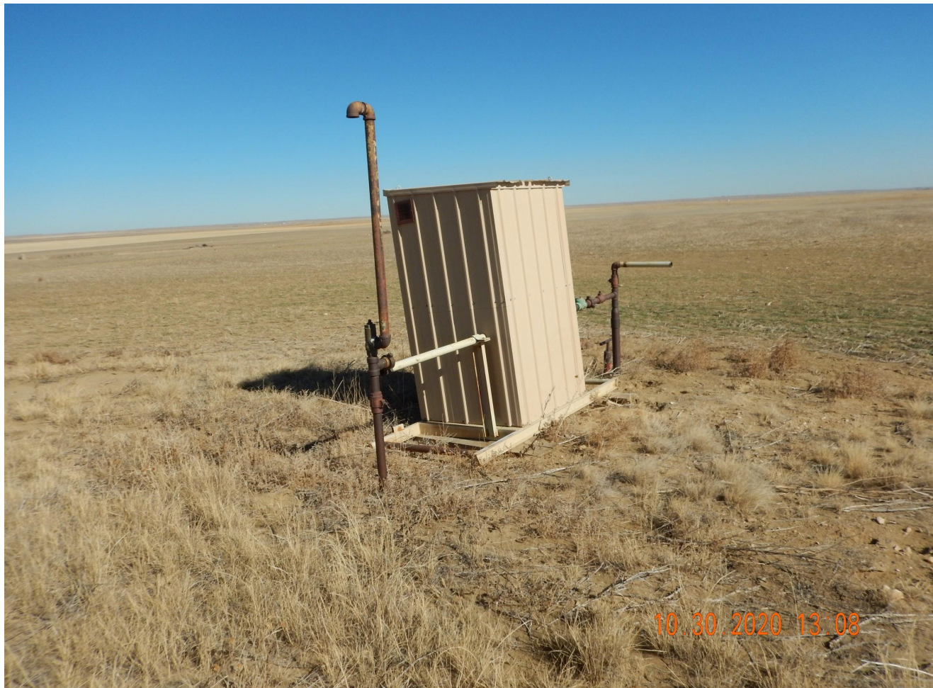
Photo 1. Photo taken from the associated offsite tank battery, facing East. Photo illustrates the Operator has failed to remove all equipment. This failure to remove equipment also appears to be inhibiting the surface owner from putting an area into crop production. Winter wheat is currently planted in the adjacent reference areas.