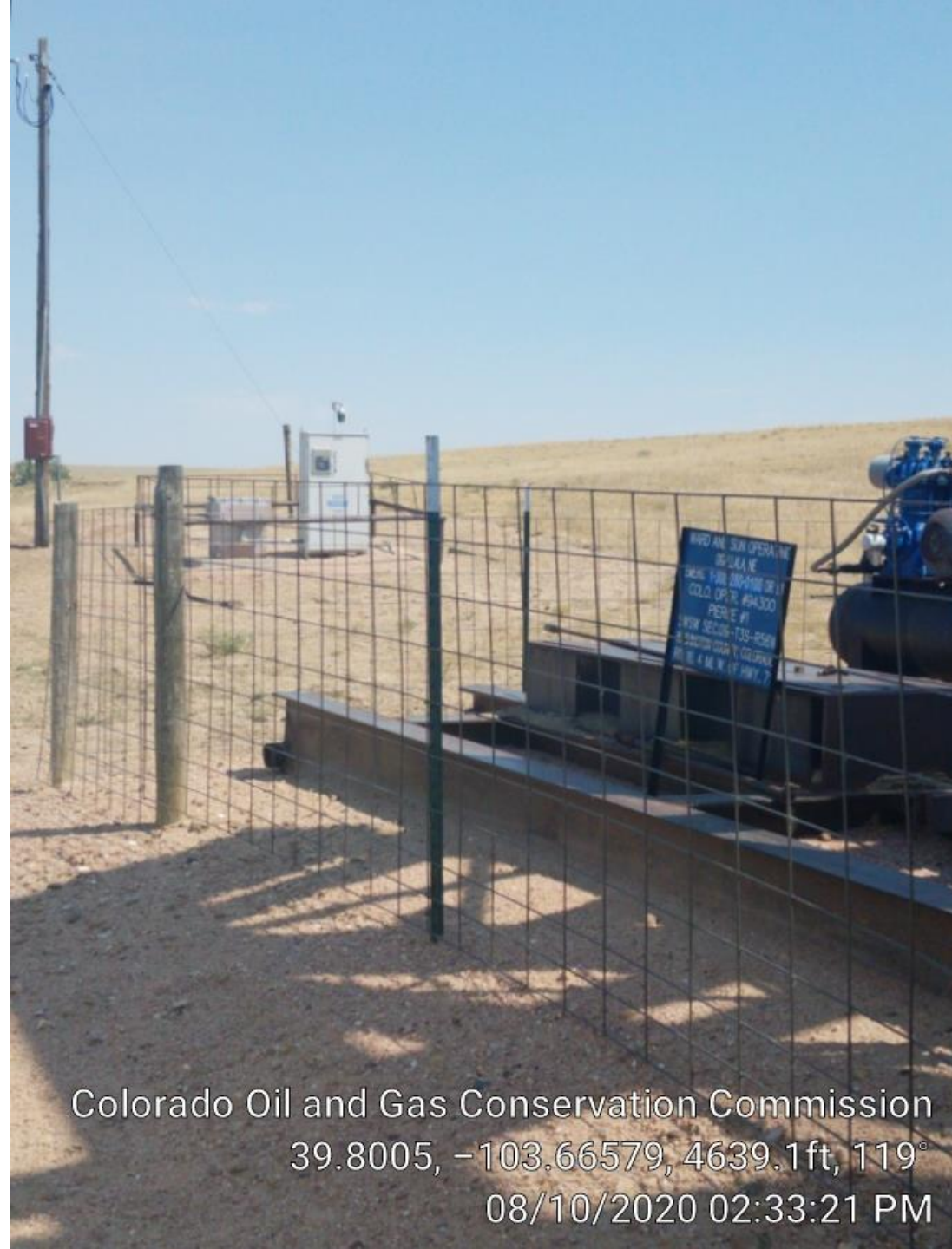
Colorado Oil and Gas Conservation Commission 39.8005, -103.66579, 4639.1ft, 119° 08/10/2020 02:33:21 PM