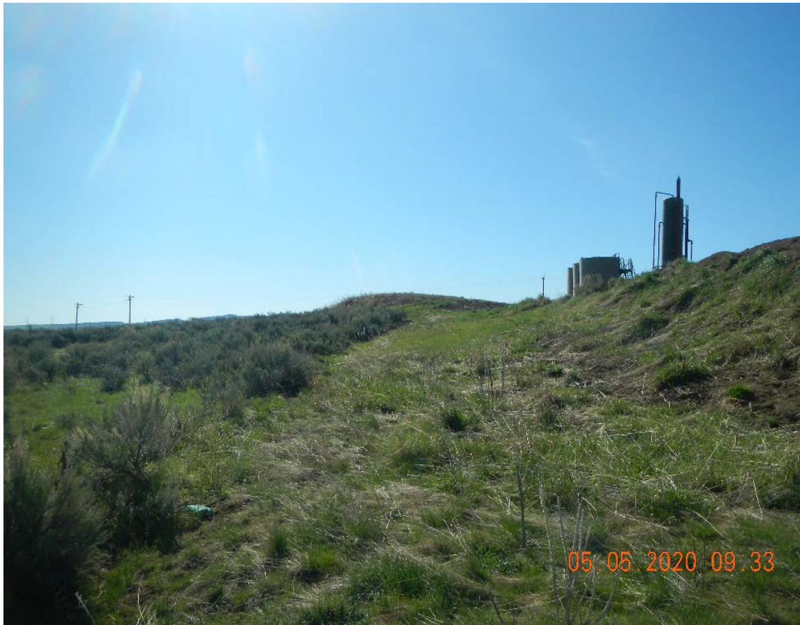
Photo #9 North side of pad. It is believed that pile in the center of the photo is Topsoil.