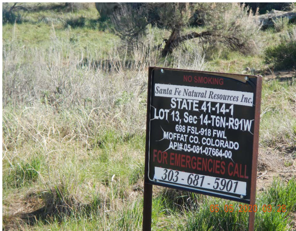
Photo #1 Sign on access road. (see location of photos plotted on Google earth image.)