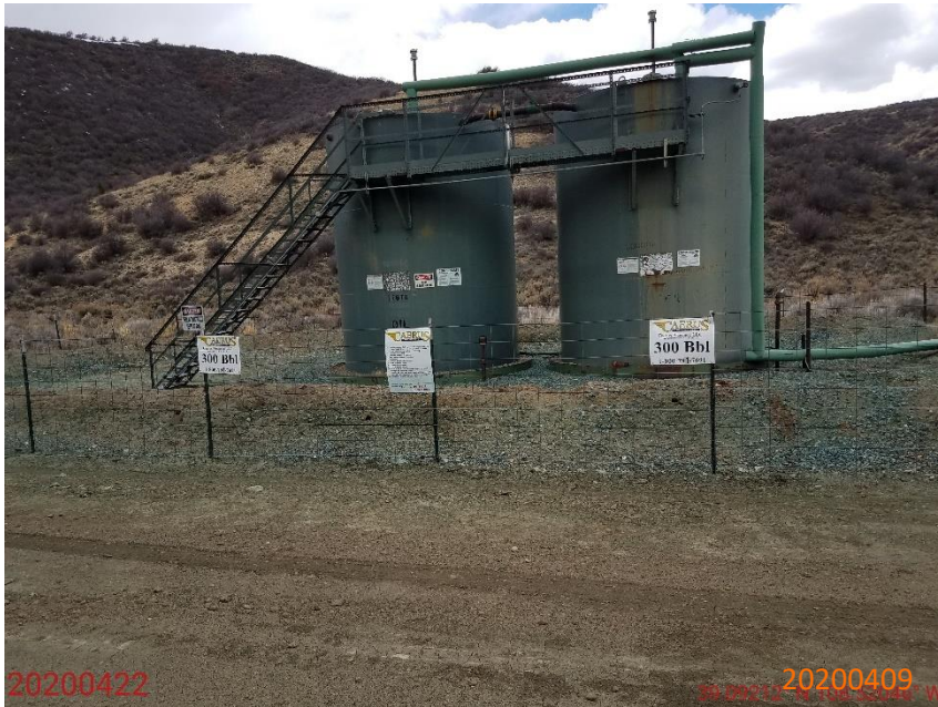
Photo 3: Continued from photo 1. Photo of the two 300 bbl AST. Tank on left "Condensate", tank on right "produced water".