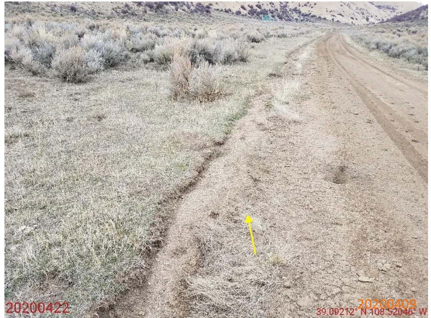
Photo 8: Photo taken from the access road, north of the Location, facing north. Photo shows sediment deposition resulting from erosion degradation and stormwater runoff from the Location.