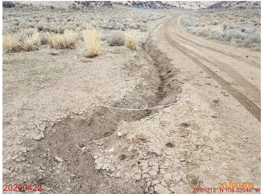
Photo 6: Photo taken from the north end of the Location, facing north. Photo shows erosion degradation due to stormwater runoff from the Location. 6 foot measuring stick for reference.