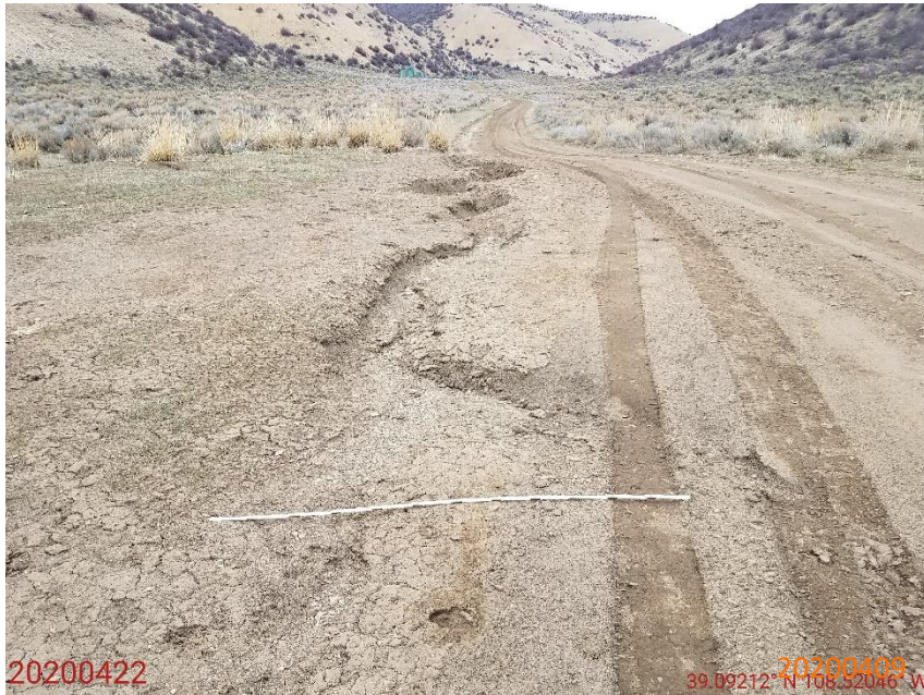
Photo 5: Photo taken from the north end of the Location, facing north. Photo shows erosion degradation due to stormwater runoff from the Location. 6 foot measuring stick for reference.