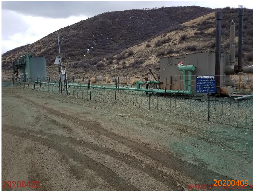
Photo 1: Photo taken from the west end of the Location, facing southwest. Photo of production equipment.