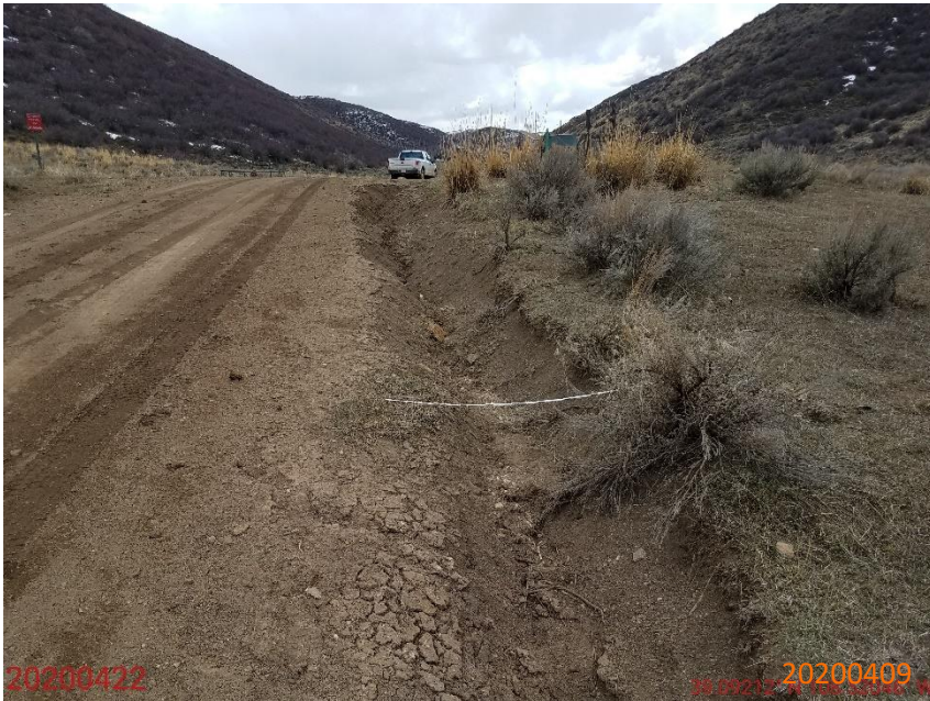
Photo 7: Photo taken from the access road, north of the Location, facing south. Photo shows erosion degradation due to stormwater runoff from the Location. 6 foot measuring stick for reference.