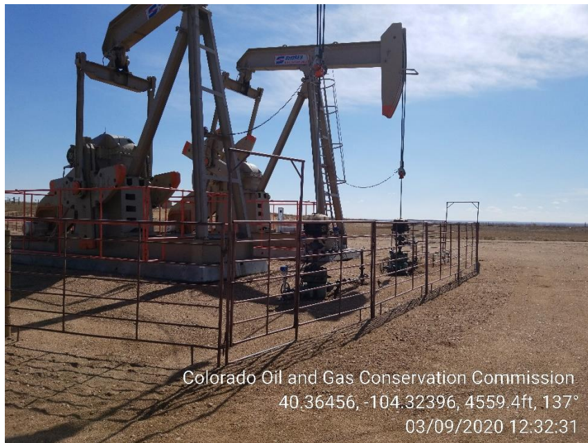
Photo 1 – Wells