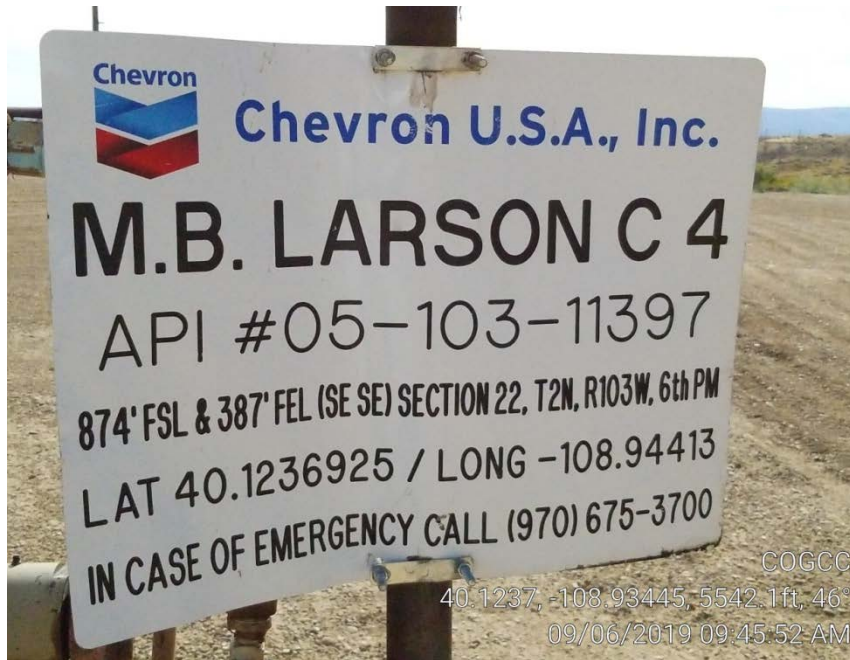
Photo 1. Well head sign.

M.B. Larson C 4, C5 API: 05-103-11397, 11429 Inspection: 679705355