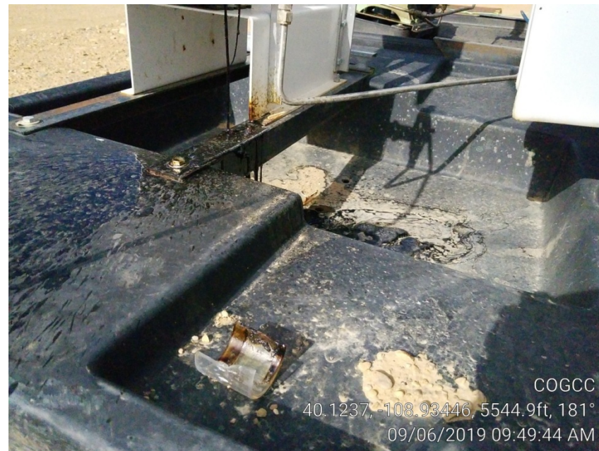
Photo 4. Asphaltene inhibitor pump.