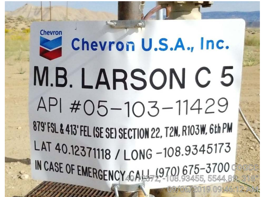
Photo 2. Well head sign.