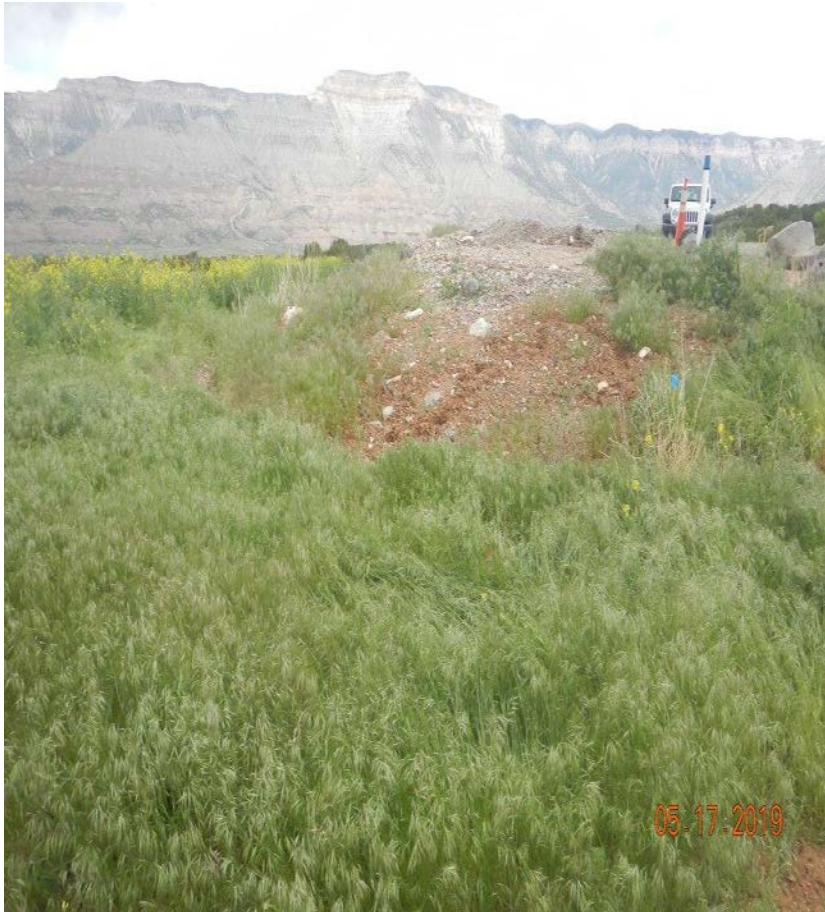
Photo#2: Establishment of Cheat grass, Tumble mustard, and Filaree.