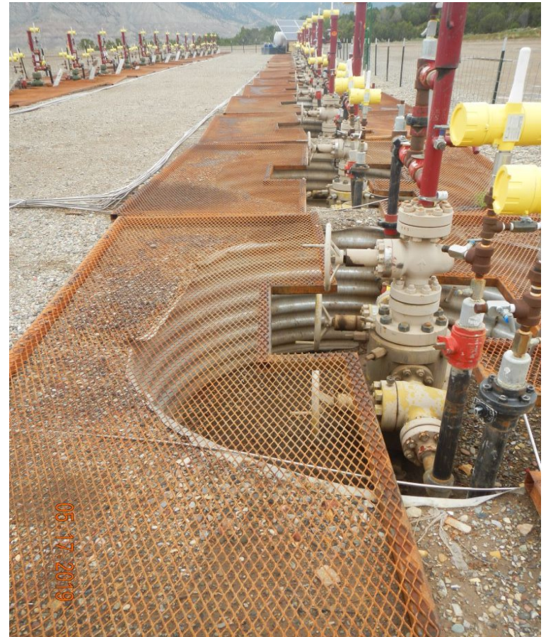
Photo#9: View over east Well line up; no wildlife escape boards installed.