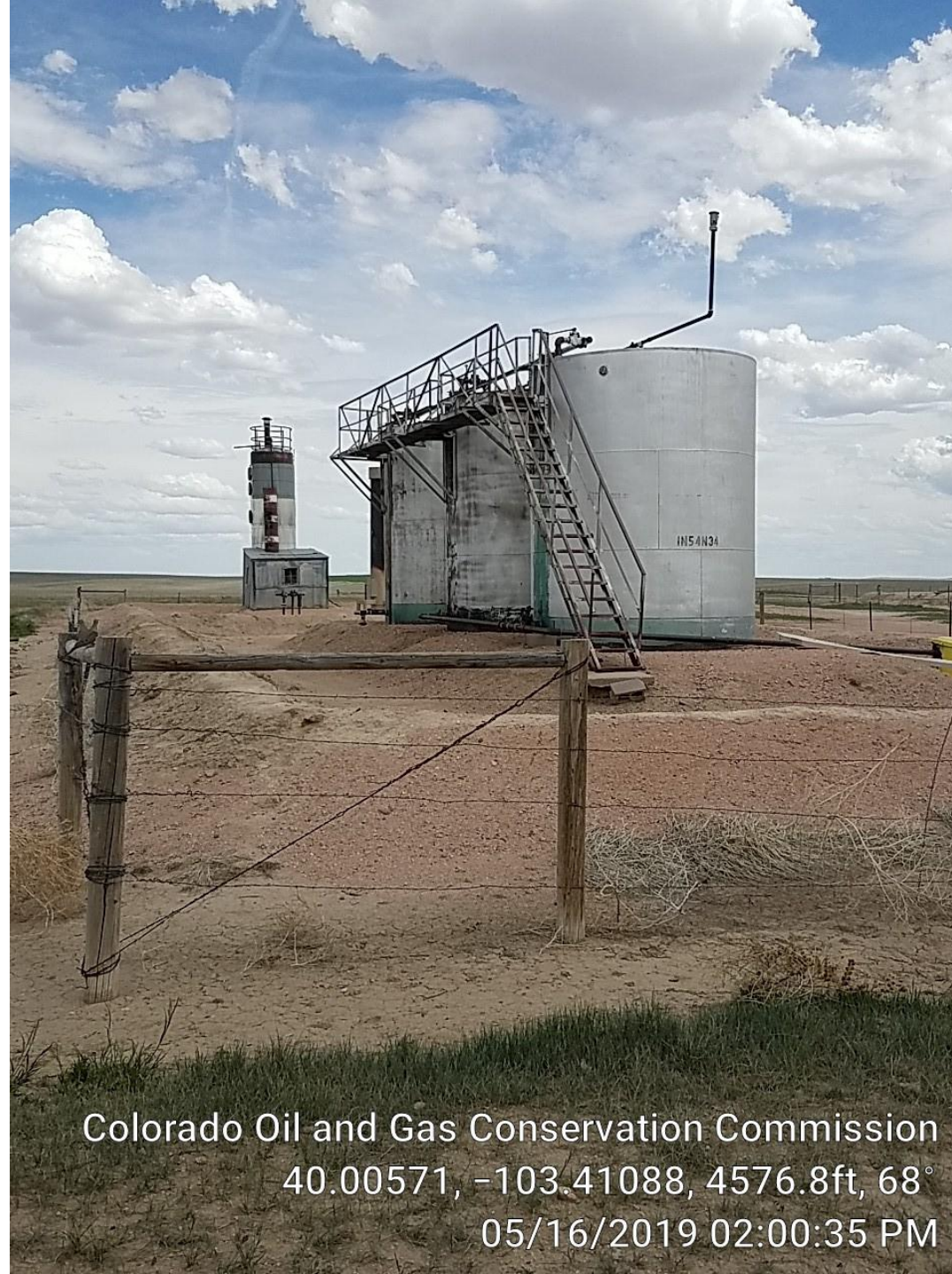
Colorado Oil and Gas Conservation Commission 40.00571, -103.41088, 4576.8ft, 68° 05/16/2019 02:00:35 PM