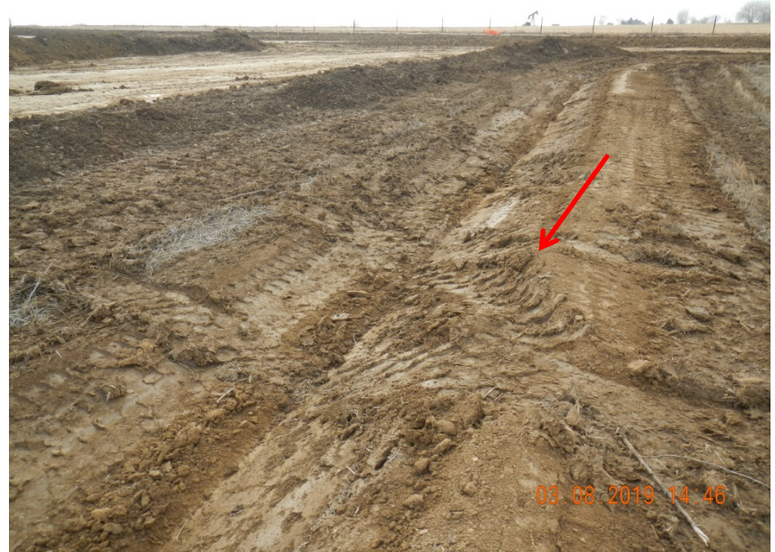
Photo 10. Photo taken from the northern perimeter of the location, facing West. See comments from Photo 9.