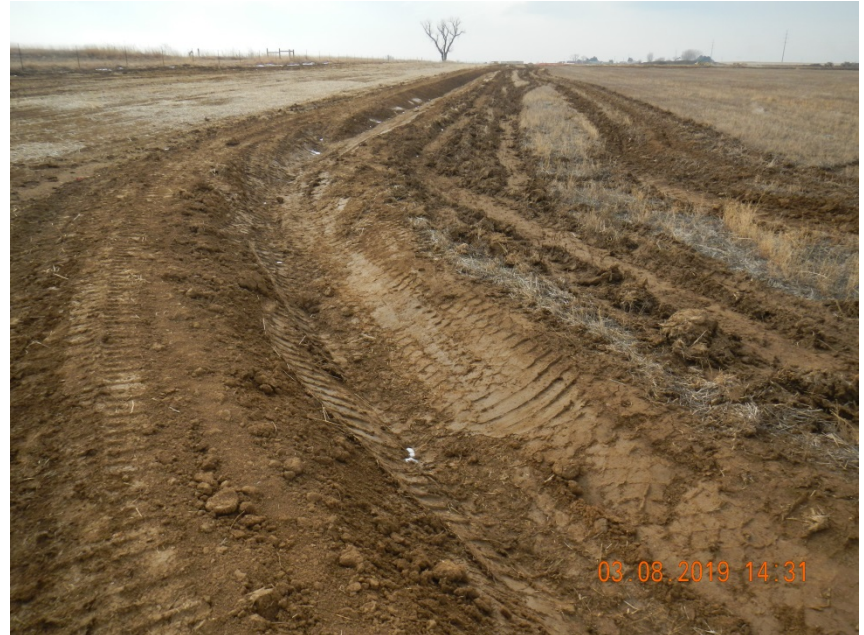
Photo 4. Photo taken from the southeastern perimeter of the location, facing West. See comments from Photo 2.