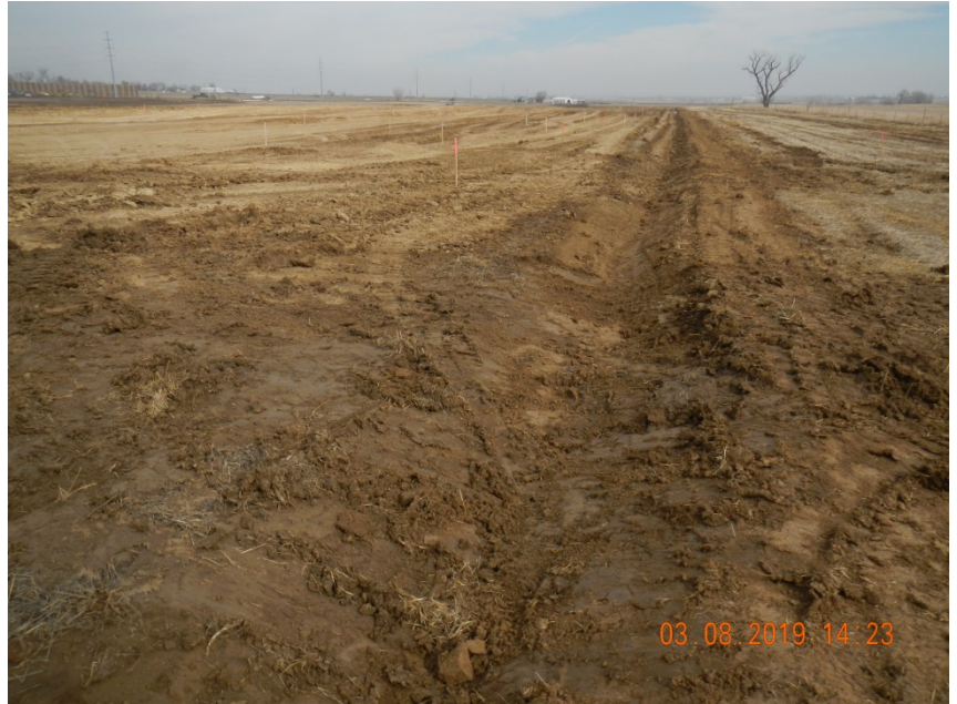
Photo 2. Photo taken from the southern perimeter of the location, facing East. Appears the operator has installed a ditch and berm BMP around the perimeter of the location.