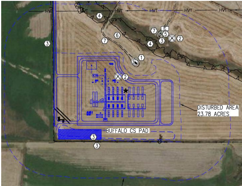
Photo 11. Location Drawing from the approved 2A showing 23.78 acres of disturbed area.