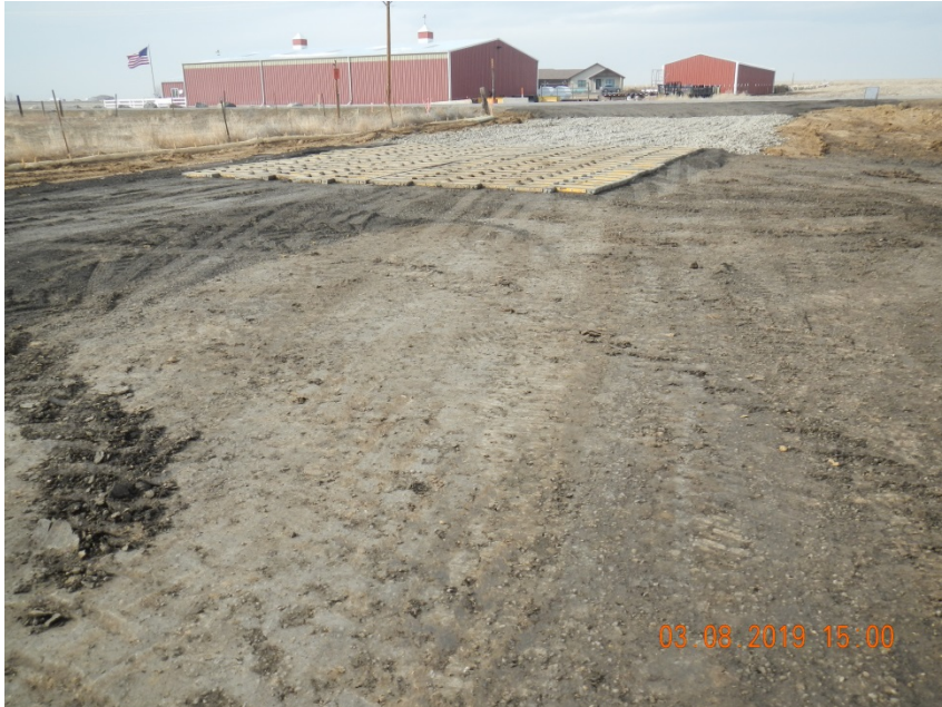
Photo 1. Photo taken from the access road looking at the entrance off CR 6, facing North. Operator has installed gravel and a track pad to potentially limit tracking onto the county road.