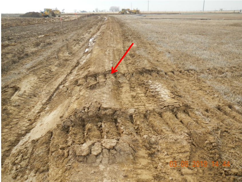
Photo 9. Photo taken from the northern perimeter of the location, facing West. Photo depicts the ditch and berm BMP has been compromised by equipment track through.