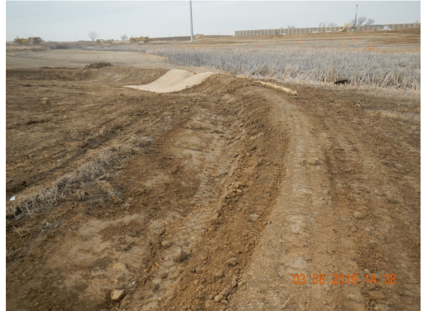
Photo 6. Photo taken from the northern perimeter of the location, facing West. Photo depicts a sediment trap with an apparent temporary stabilized outlet BMP installed on location.