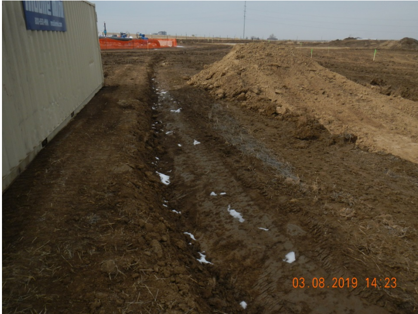
Photo 3. Photo taken from the southwestern perimeter of the location, facing Northwest. See comments from Photo 2.