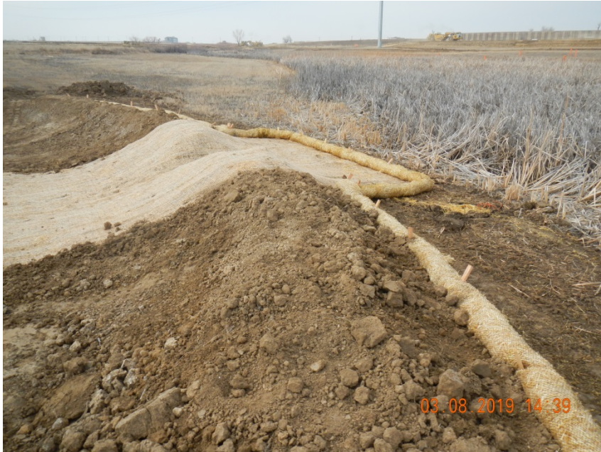
Photo 7. Photo taken from the northern perimeter of the location, facing Northeast. Appears the temporary stabilized outlet is adjacent to the wetlands to the north of the location.