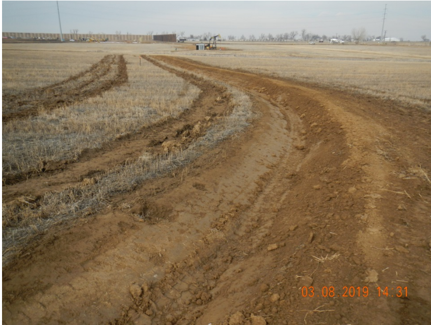
Photo 5. Photo taken from the southeastern perimeter of the location, facing North. See comments from Photo 2.