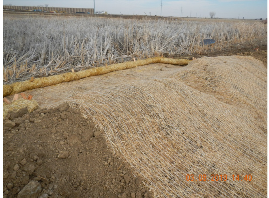
Photo 8. Photo taken from the northern perimeter of the location, facing Northeast. See comments from Photo 7.