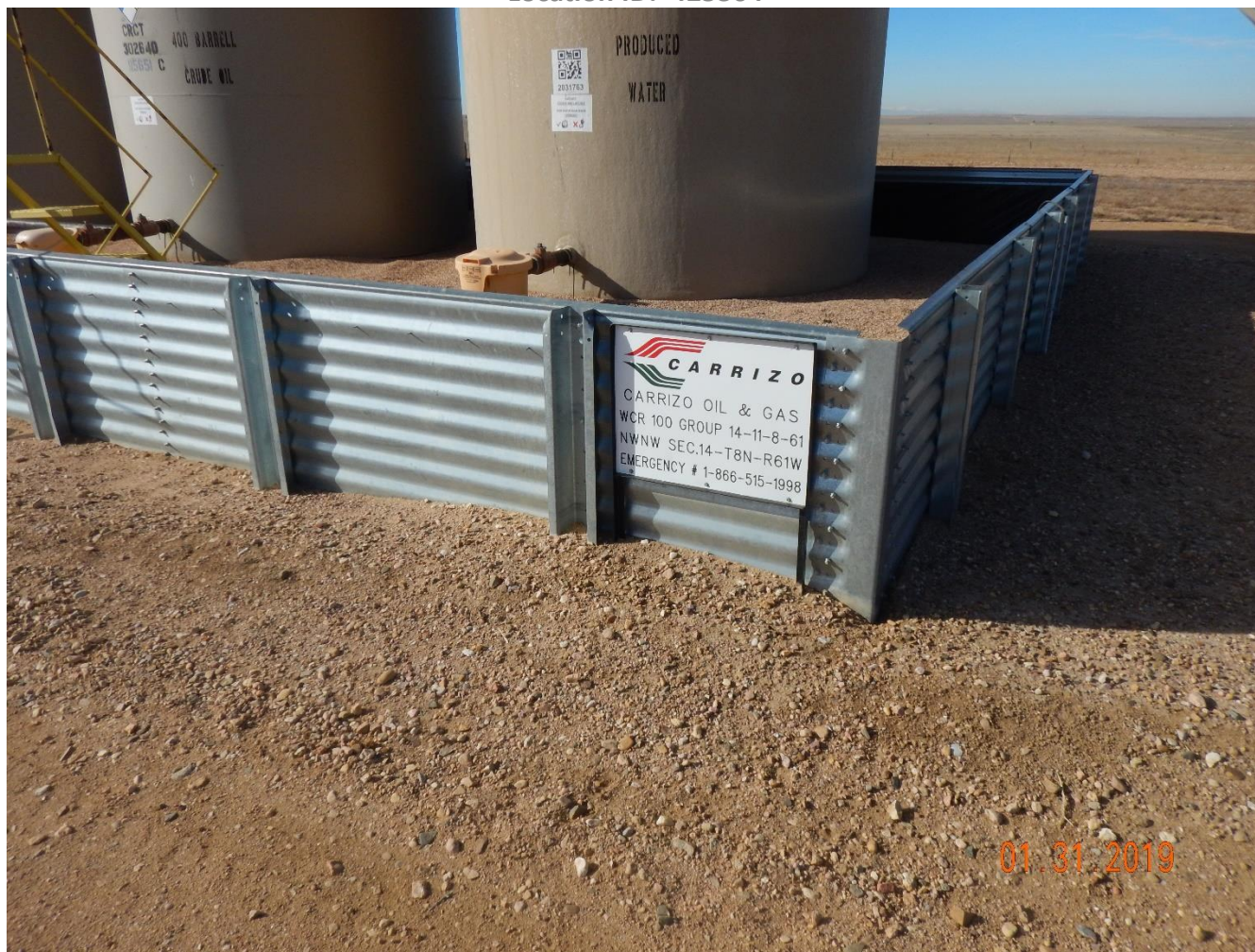
Photo 7: Photo taken from the tank battery. Photo shows sign with incorrect operator information.