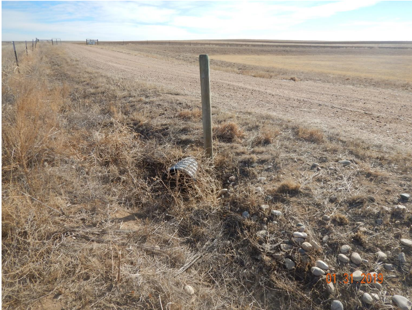
Photo 9: Photo of culvert at access road. Culvert appears to be in proper functioning condition.