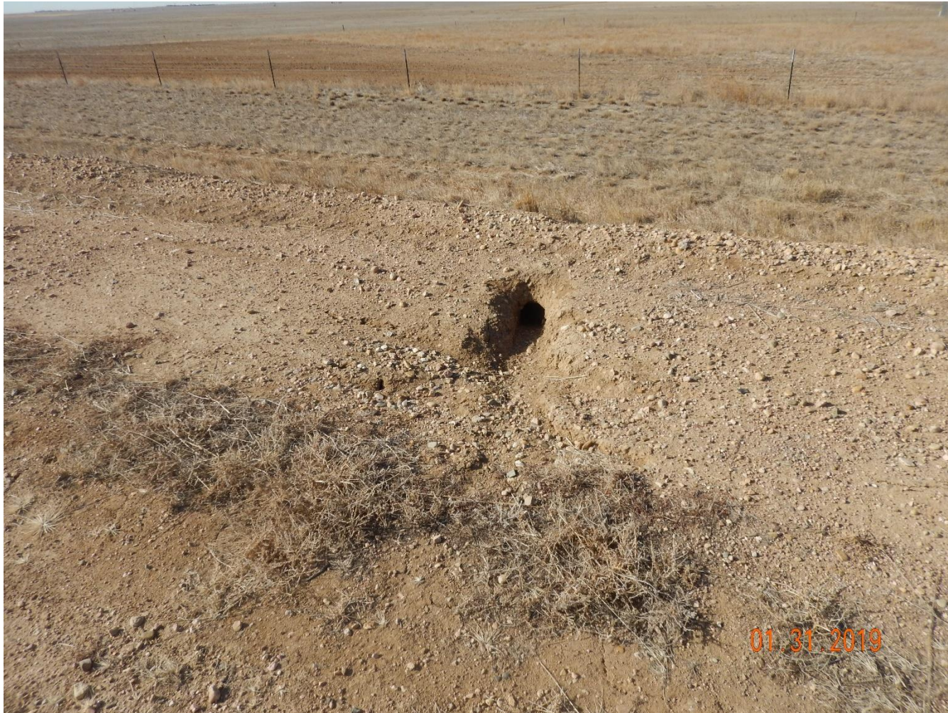
Photo 12: Photo taken from the west end of the location. Photo shows wildlife appears to have burrowed into the stormwater berm. Maintenance required.