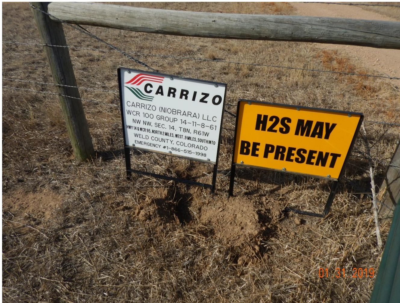
Photo 6: Photo taken from the location entrance. Photo shows sign with incorrect operator information.