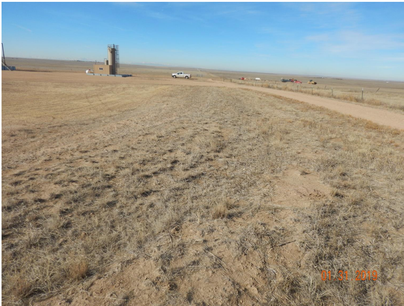
Photo 8: Photo taken from the northeast corner of the location, facing west. Photo shows current interim areas and the location.