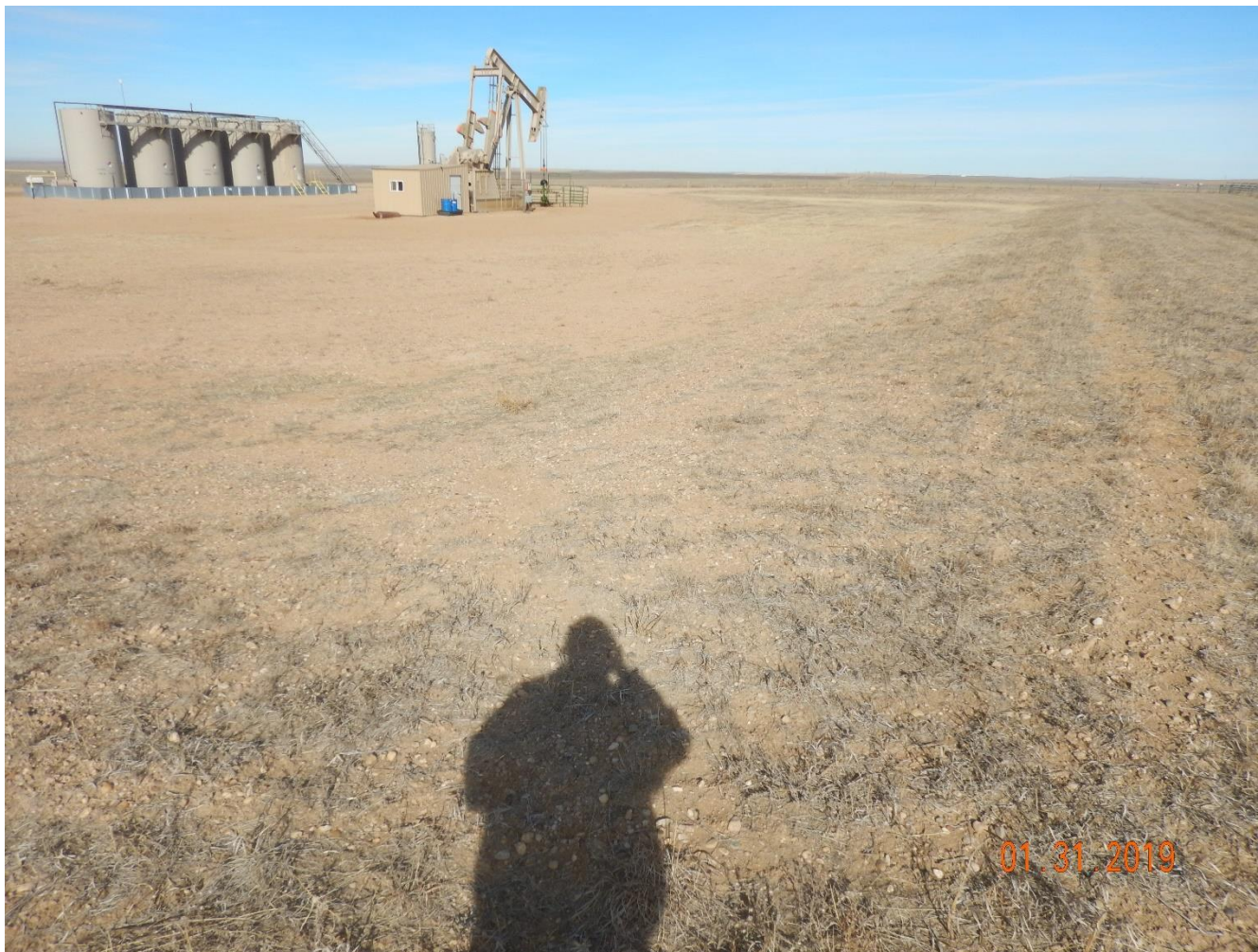
Photo 10: Photo taken from the southeast corner of the location, facing north. Photo shows current interim areas and the location.