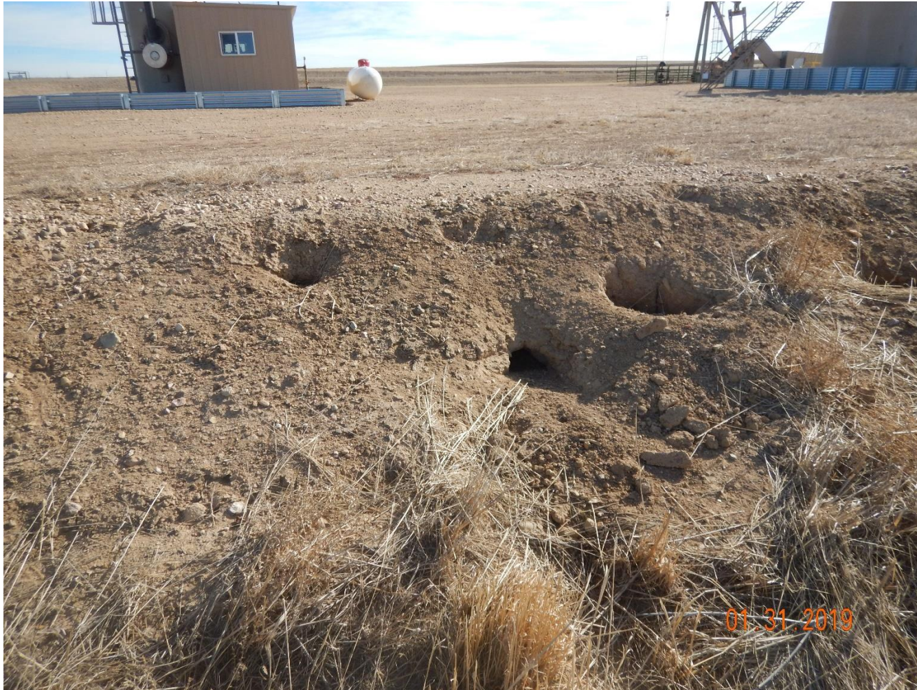
Photo 13: Photo taken from the west end of the location. Photo shows wildlife appears to have burrowed into the stormwater berm. Maintenance required.