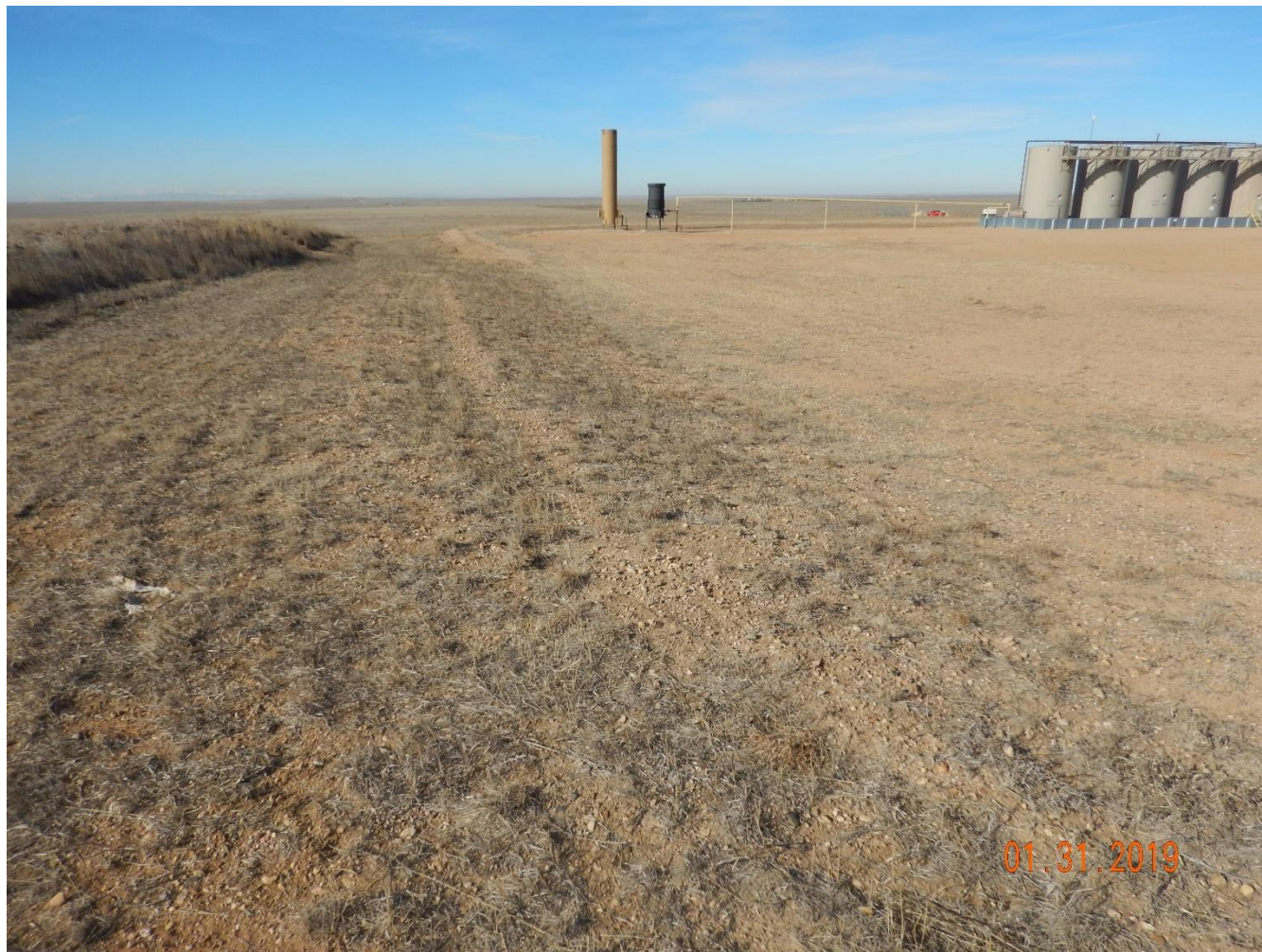
Photo 11: Photo taken from the southeast corner of the location, facing west. Photo shows current interim areas and the location.